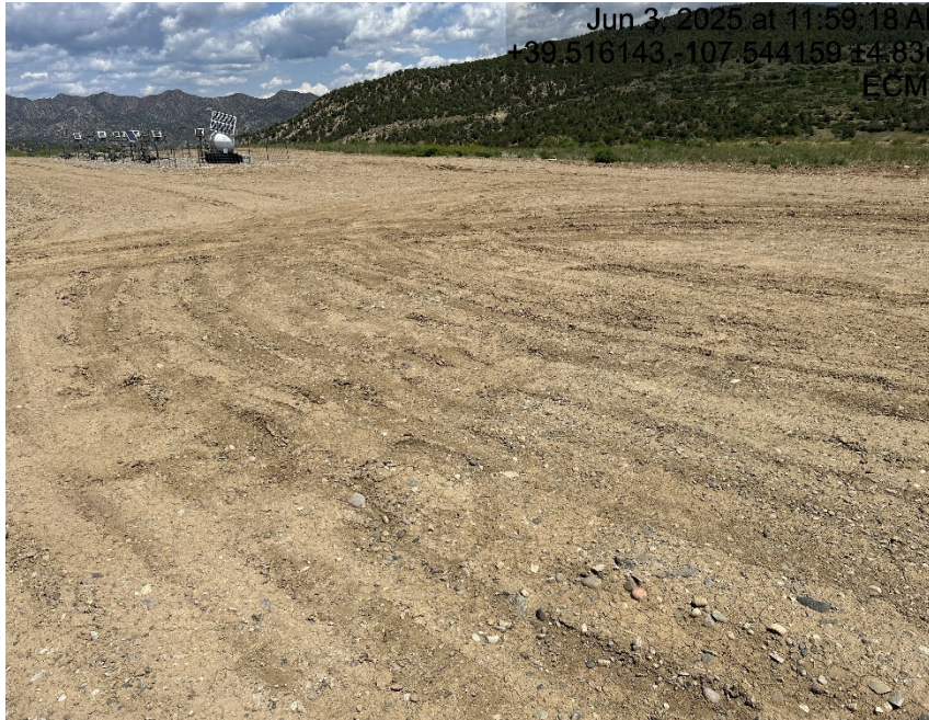
Lack of stabilization/compaction