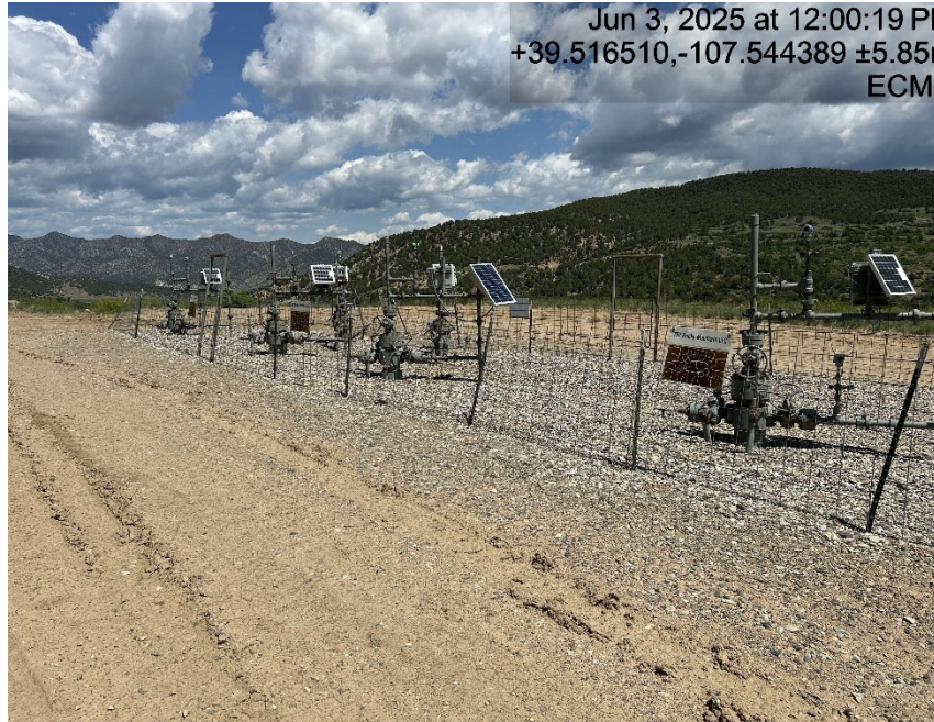
Some well signs are illegible