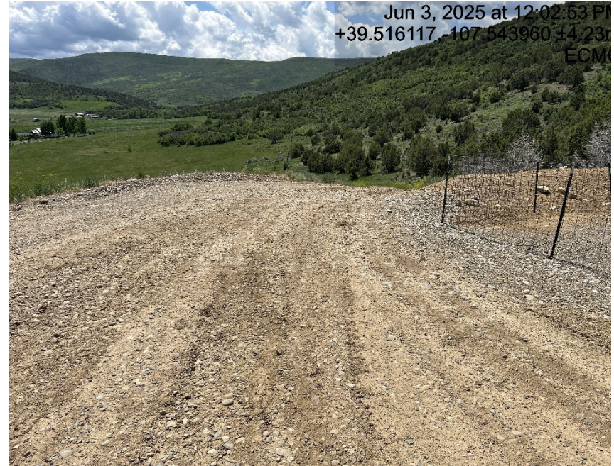
Access road has areas of stabilization issues and lack of tracking controls