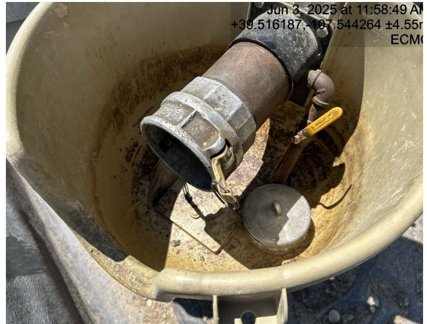
Load line lacking cap