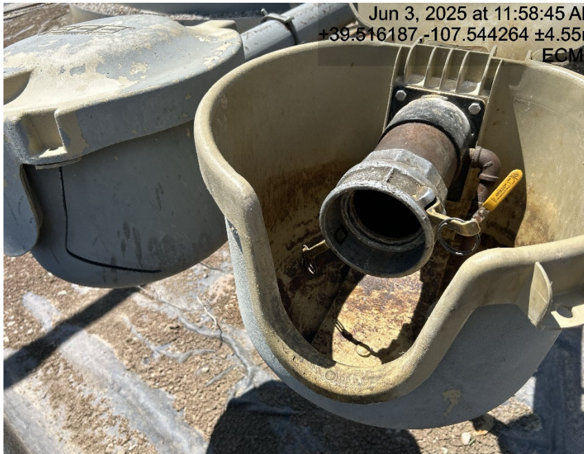
Load line lacking cap