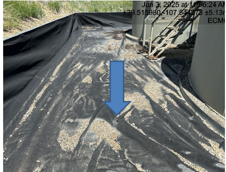
Hole in containment