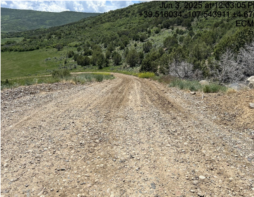
Access road has areas of stabilization issues