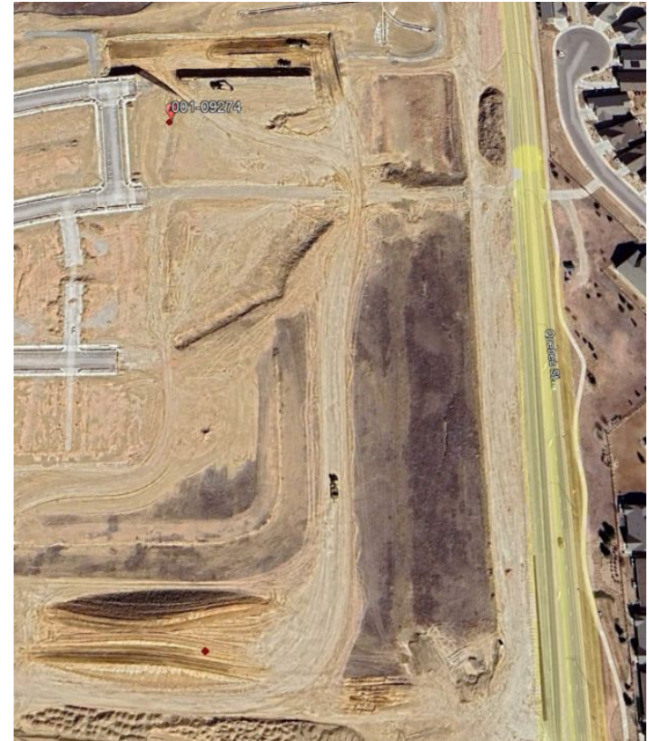
Photo 3. Google earth aerial imagery taken 03/2025. Location and access road have been superseded by construction activity.