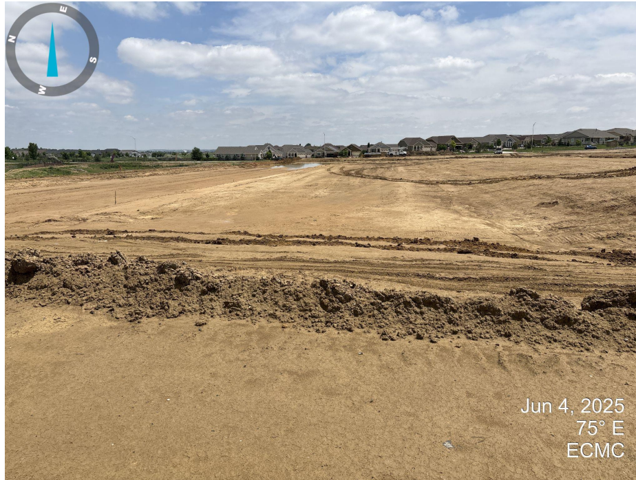
Photo 1. Looking east across the well location. No oil and gas equipment remains on location. The location and access road are within a land use change to residential development.