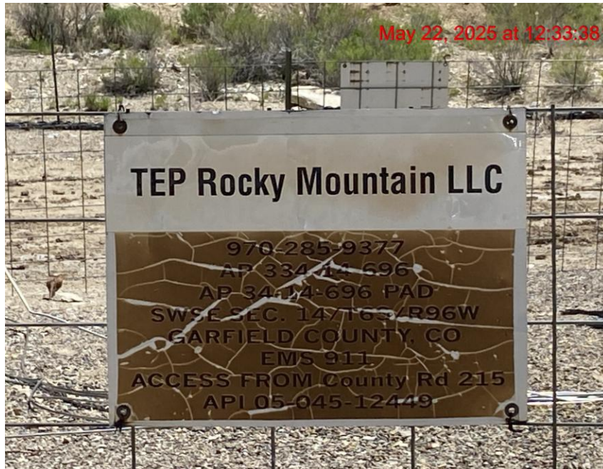
Illegible Wellhead Sign – Photo #09057