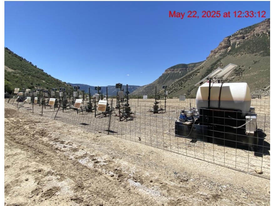
Location – Photo #09056