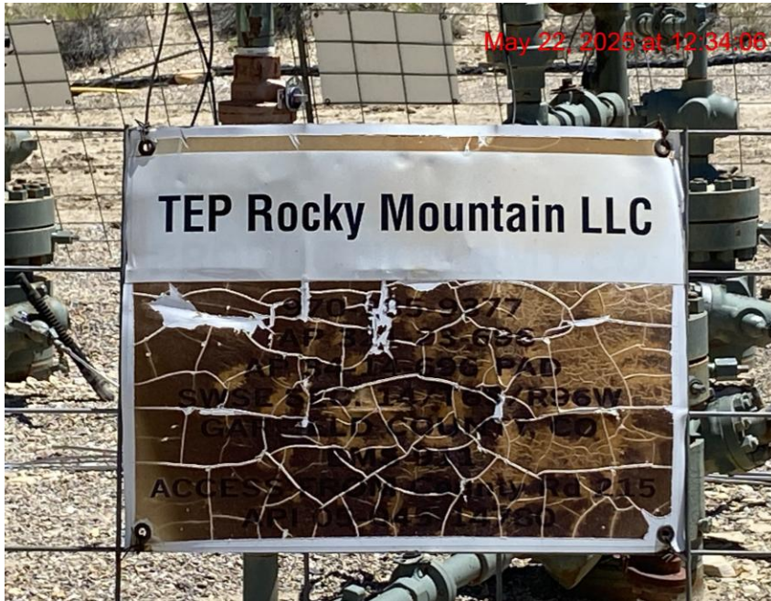
Illegible Wellhead Sign – Photo #09059