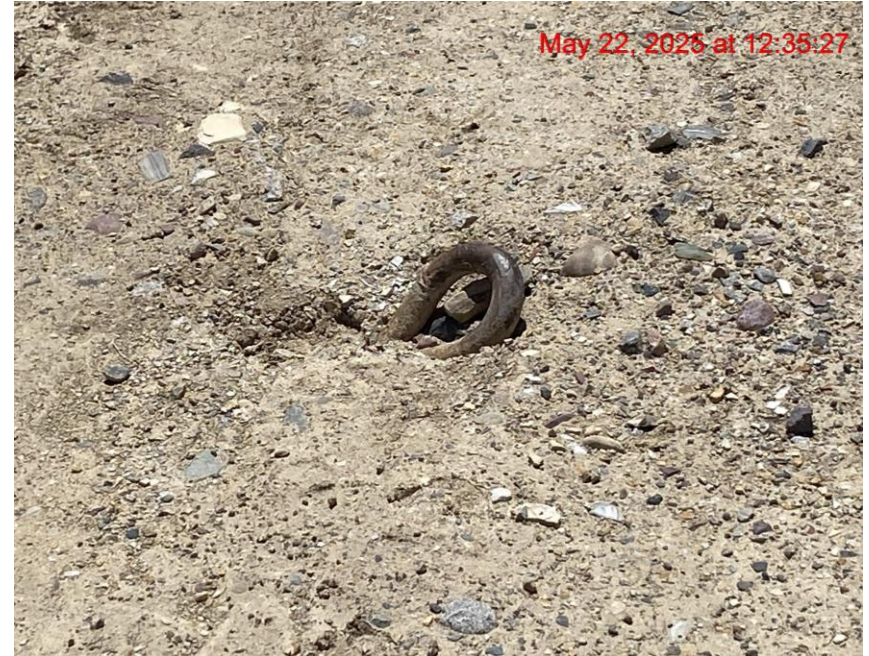
Unmarked Deadman – Photo #09063