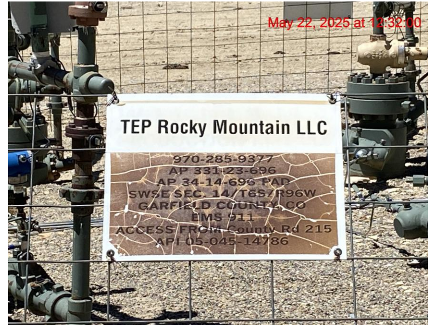
Illegible Wellhead Sign – Photo #09049