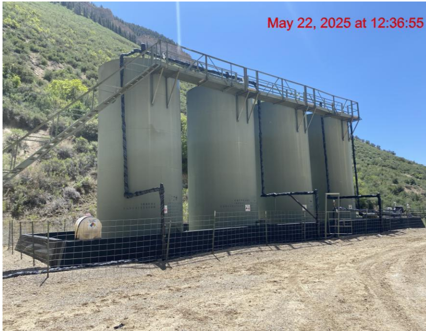
Location – Photo #09066