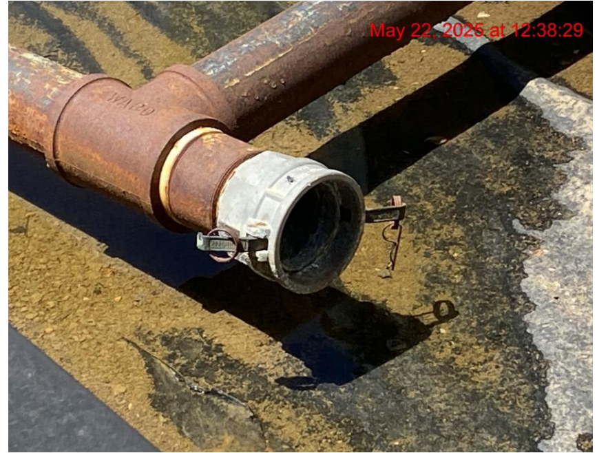
Open-Ended Line/Wildlife Entry Hazard – Photo #09073