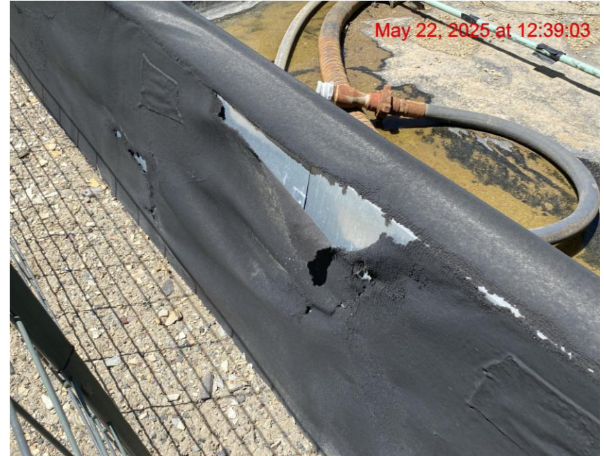
Damaged Berm Liner – Photo #09075