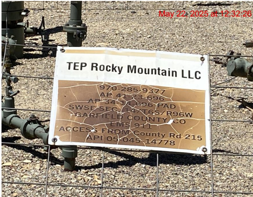
Illegible Wellhead Sign – Photo #09052