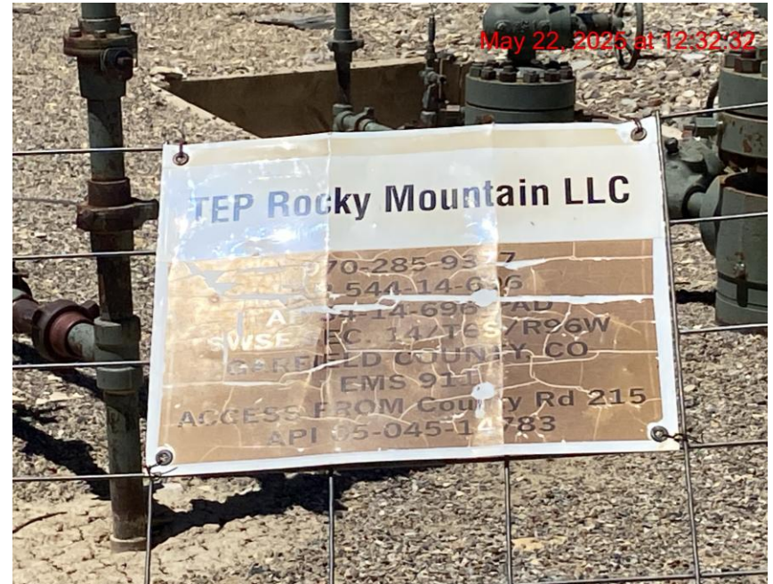
Illegible Wellhead Sign – Photo #09053