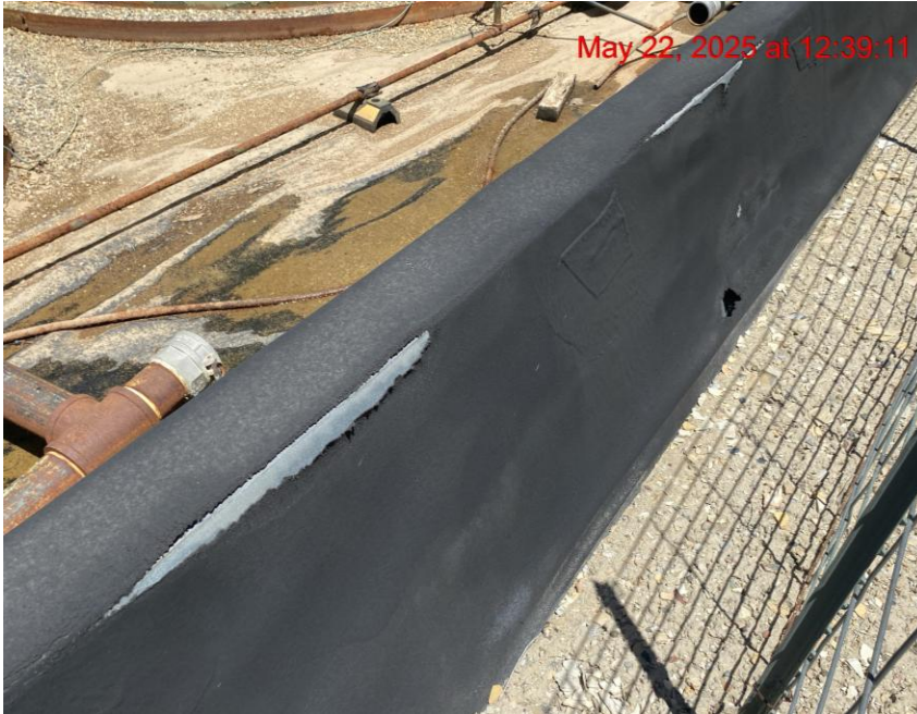
Damaged Berm Liner – Photo #09076