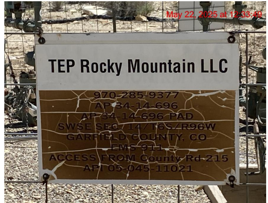
Illegible Wellhead Sign – Photo #09058