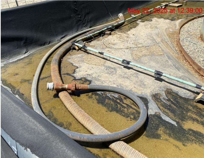
Stored Supplies/Wildlife Entry Hazard – Photo #09074