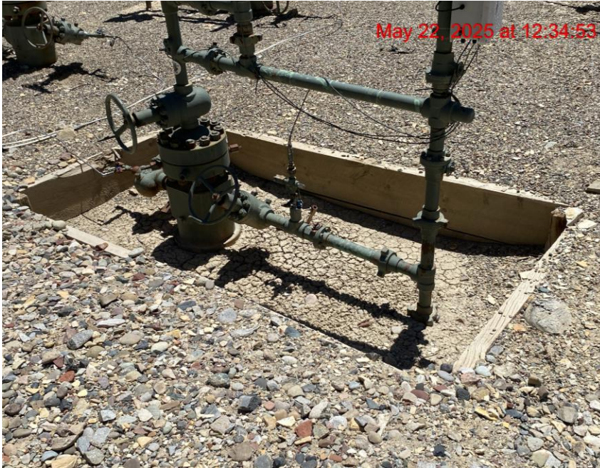
No Wildlife Egress in Well Cellar – Photo #09062