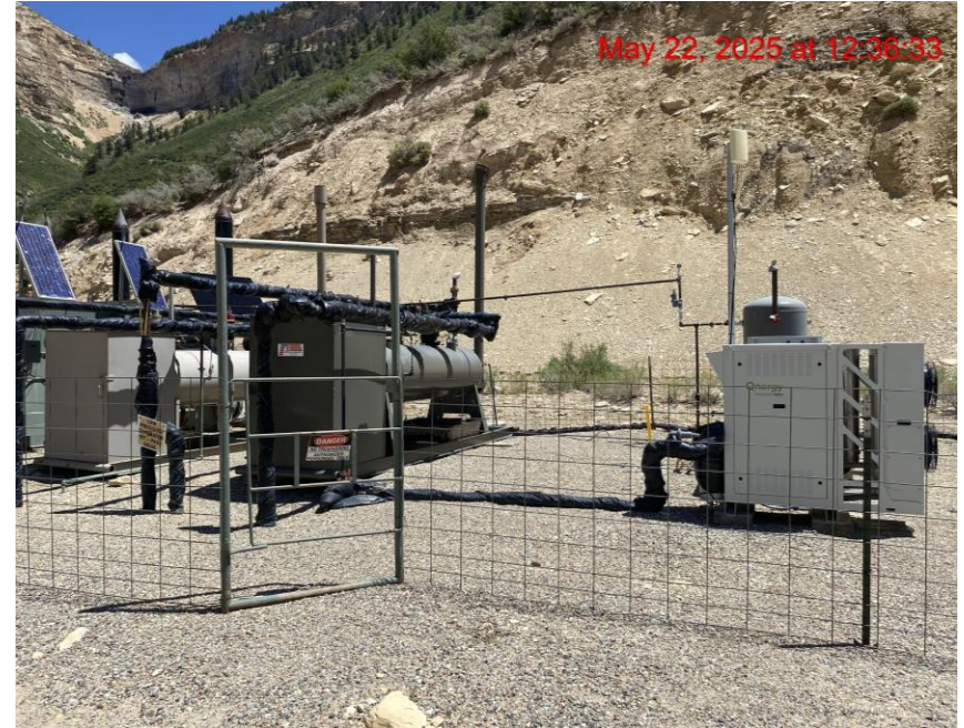
Location – Photo #09065