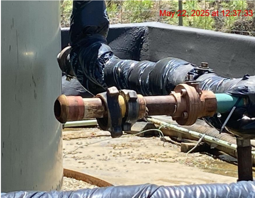
Open-Ended Line/Wildlife Entry Hazard – Photo #09071