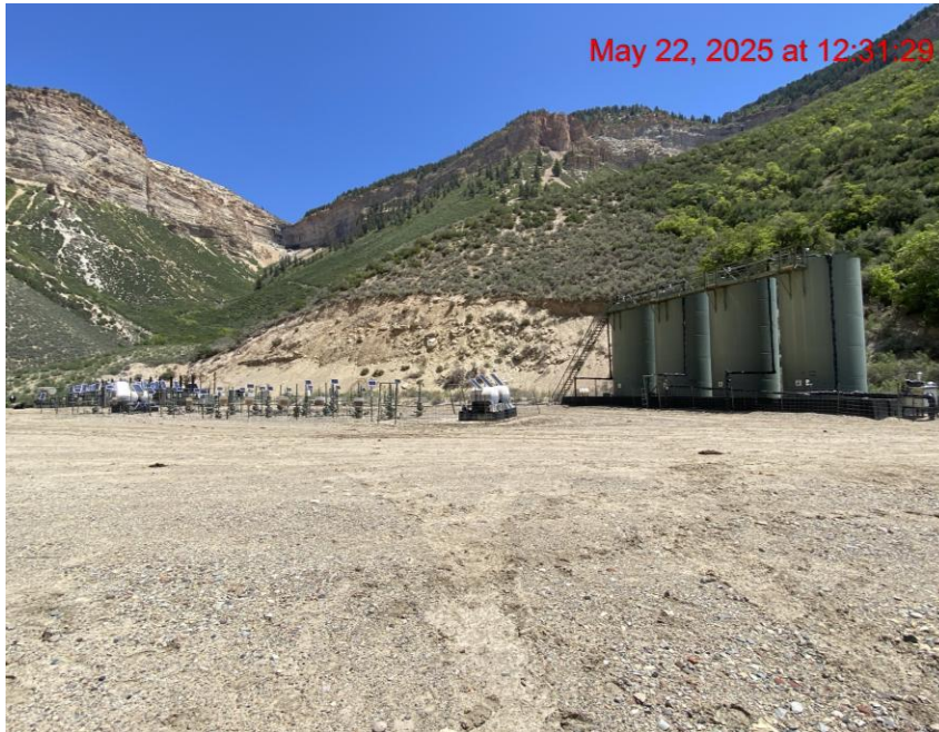
Location Overview – Photo #09048