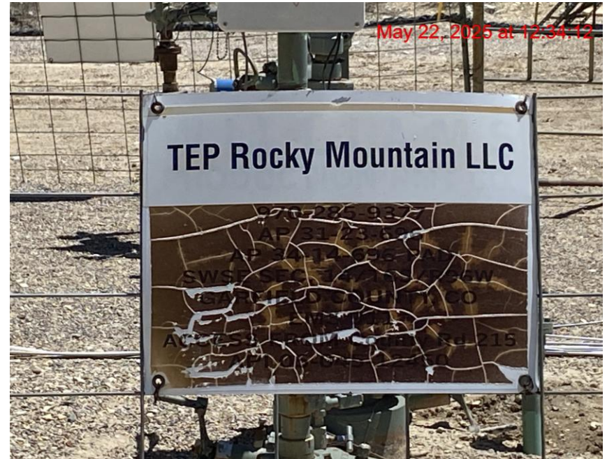
Illegible Wellhead Sign – Photo #09060