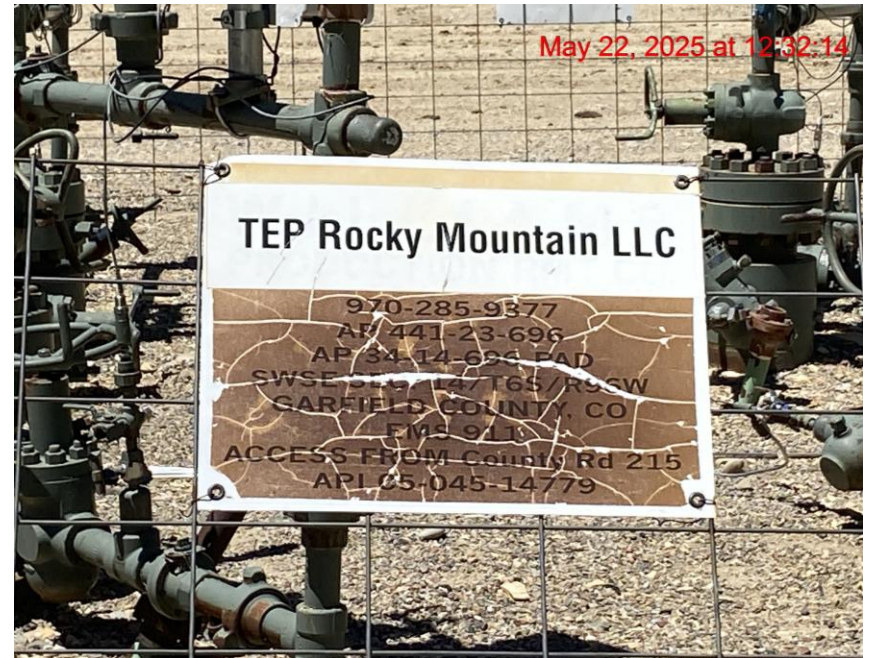
Illegible Wellhead Sign – Photo #09051