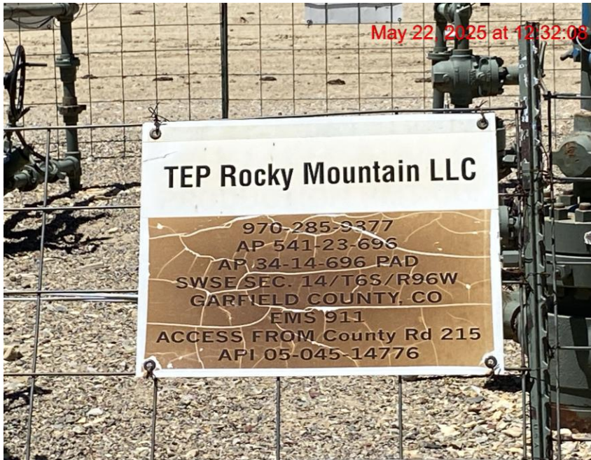
Illegible Wellhead Sign – Photo #09050