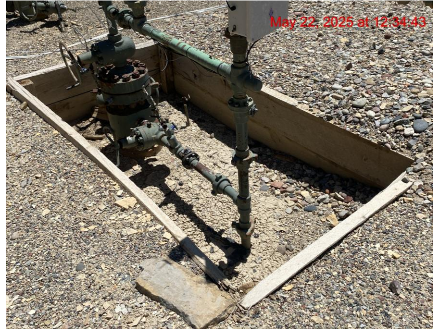
No Wildlife Egress in Well Cellar – Photo #09061