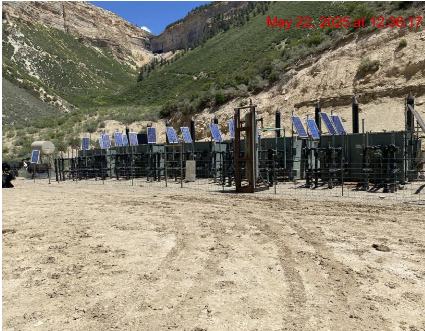
Location – Photo #09064