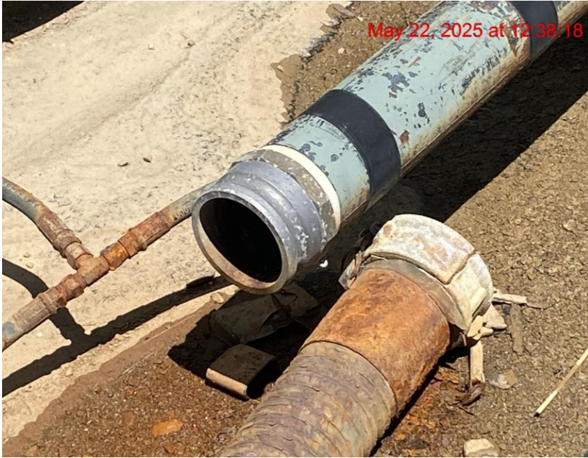
Open-Ended Line/Wildlife Entry Hazard – Photo #09072