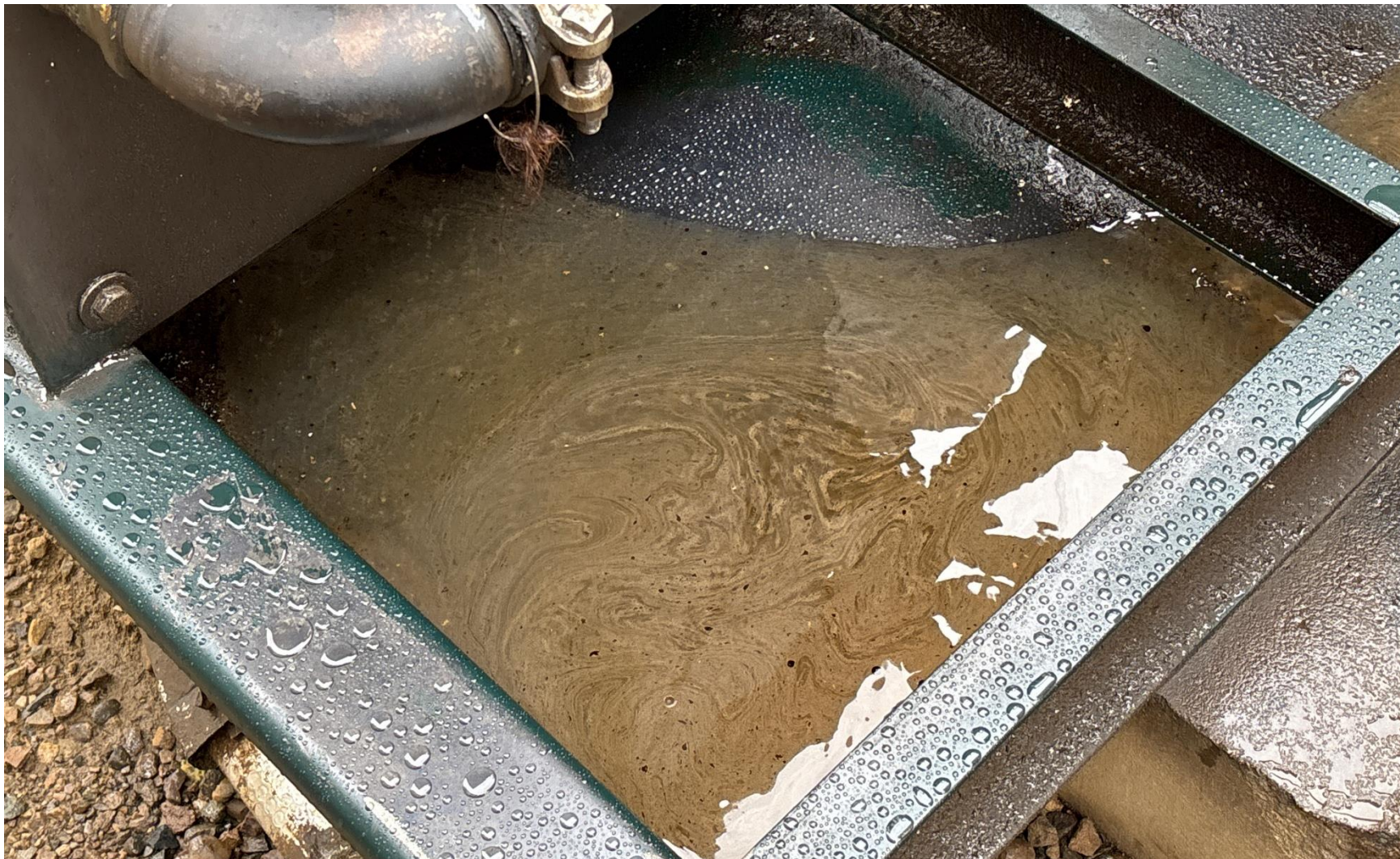
PHOTO 5: OILY WASTE IS PRIME MOVER ENGINE SKID (ALTHOUGH IT APPEARS THAT THE SKID HAS BEEN CLEANED SINCE LAST INSPECTION THE EQUIPMENT MAINTANANCE HAS EITHER NOT BEEN PERFORMED OR REPAIRS ARE INADEQUATE). DRAIN OILY WASTE REPAIR ALL LEAKS AND REMOVE IMPACTED SOIL PER RULE 1002..(2).D & 1002.f.(2)B, Comply with general provisions of the oil and gas act for wildlife protection AND SB-181. ( THIS IS THE 3 RD INSPECTION OF THIS EQUIPMENT WITH THE SAME COMPLIANCE CONDITIONS LEAKING EQUIPMENT MUST BE REPAIRED OR REPLACED. CA DATE 6/3/2025.