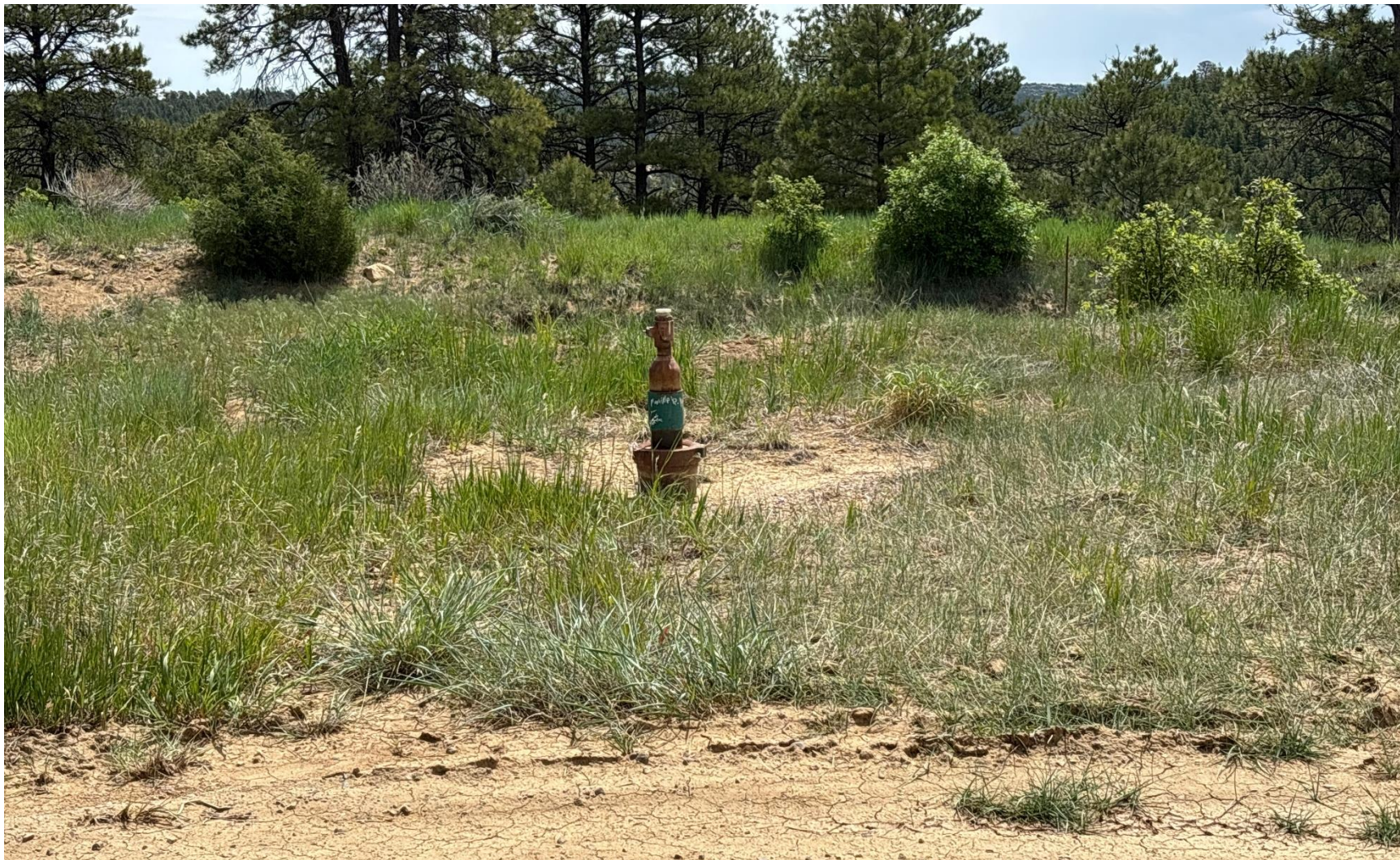
PHOTO 3: WELLHEAD AND EQUIPMENT. WEED MAINTANANCE NEEDED AROUND WELLHEAD.