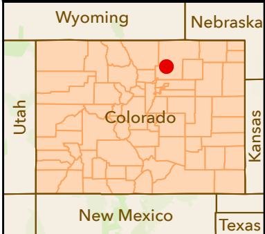
Figure 2 Sample Location Map REICHERT 09-05 SWNW-SEC 9-T4N-R65W Weld County, Colorado Noble Energy Inc.