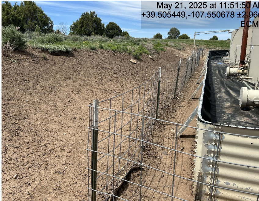
Cut slope erosion