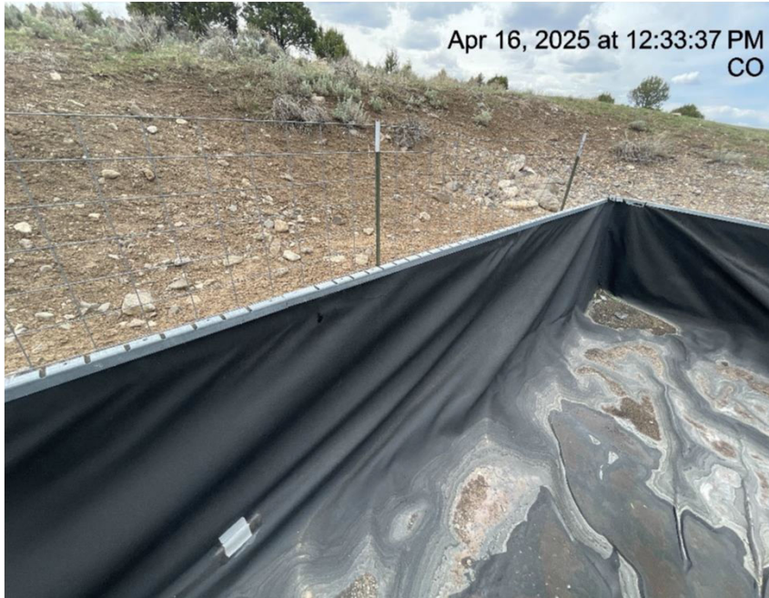
Previous inspection photo