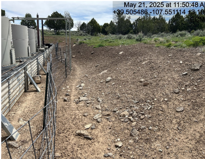
Cut slope erosion