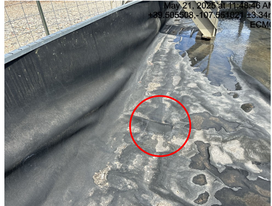
C/A from previous inspection completed