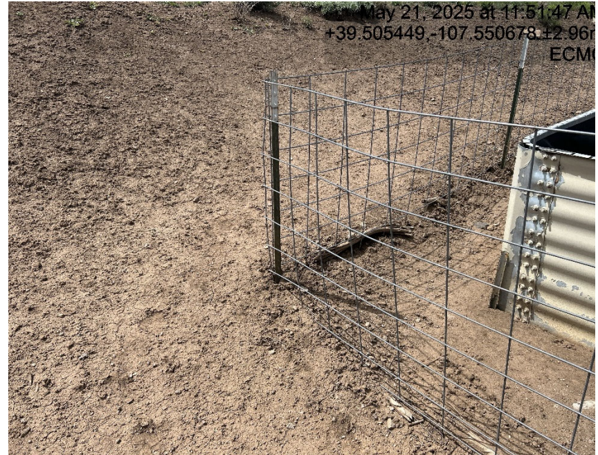
Cut slope erosion