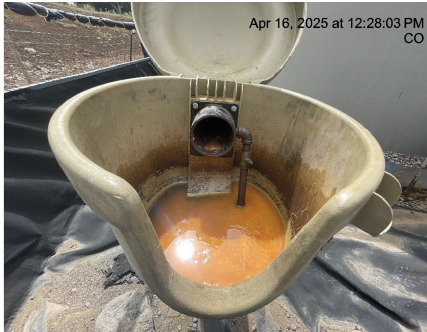
Previous inspection photo