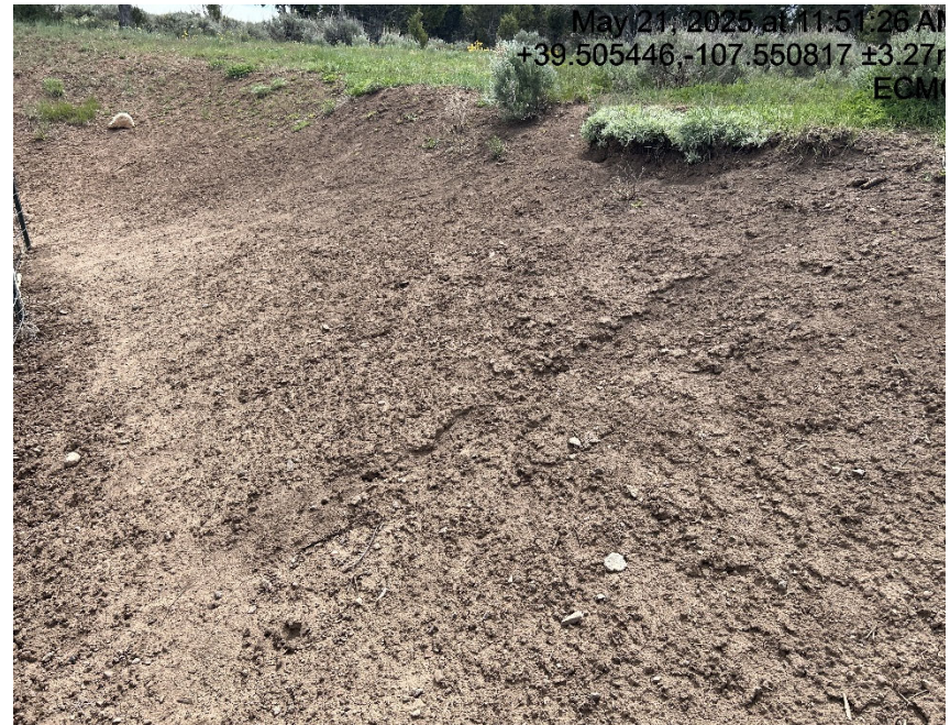
Cut slope erosion