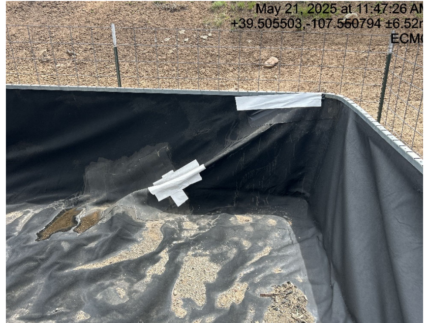
C/A from previous inspection completed