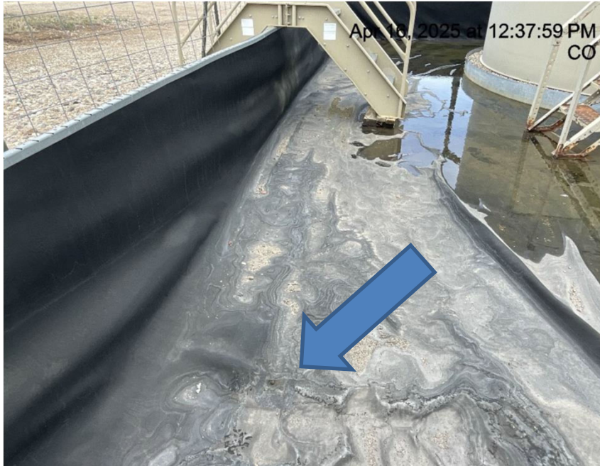
Previous inspection photo