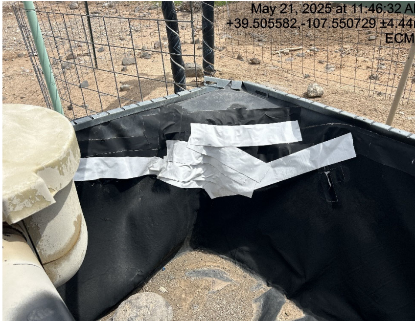
C/A from previous inspection completed