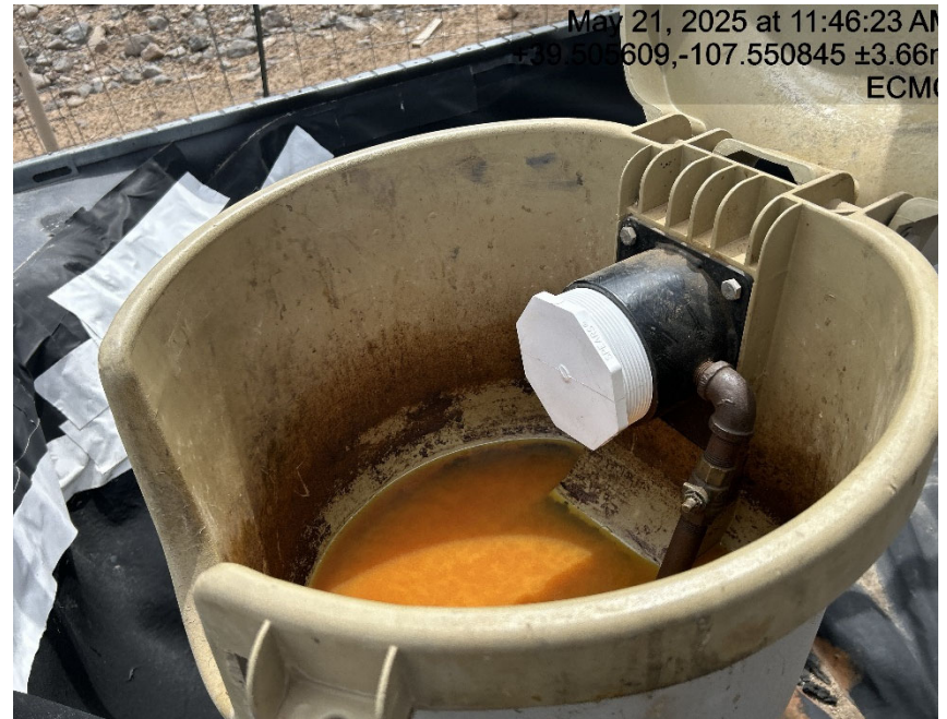
C/A from previous inspection completed