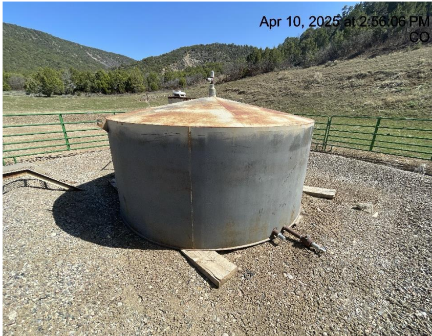
Photo # 624 From inspection 708906247 conducted on 04/10/2025 Tank is disconnected & not in use/unused equipment