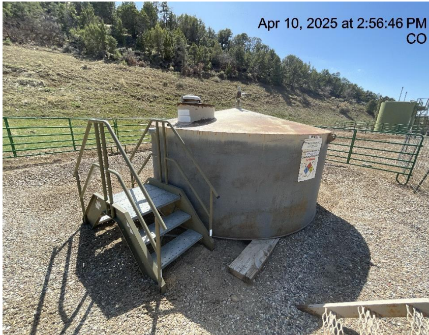
Photo # 623 From inspection 708906247 conducted on 04/10/2025 Tank is disconnected & not in use/unused equipment