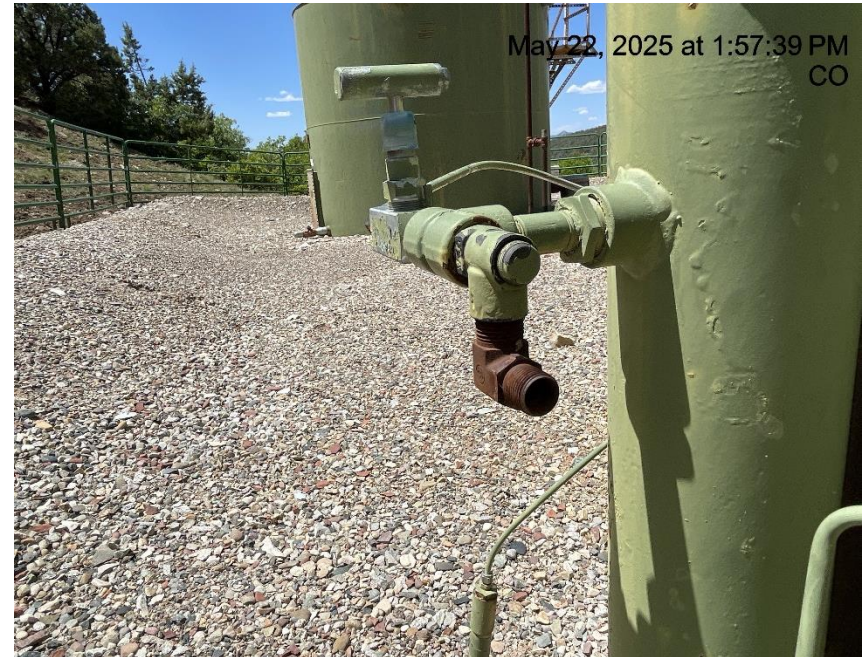
Photo # 2832 PRV vent line does not comply with CECMC pressure safety device rules or general safety rules