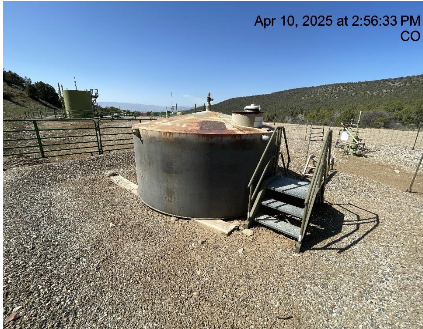
Photo # 625 From inspection 708906247 conducted on 04/10/2025 Tank is disconnected & not in use/unused equipment