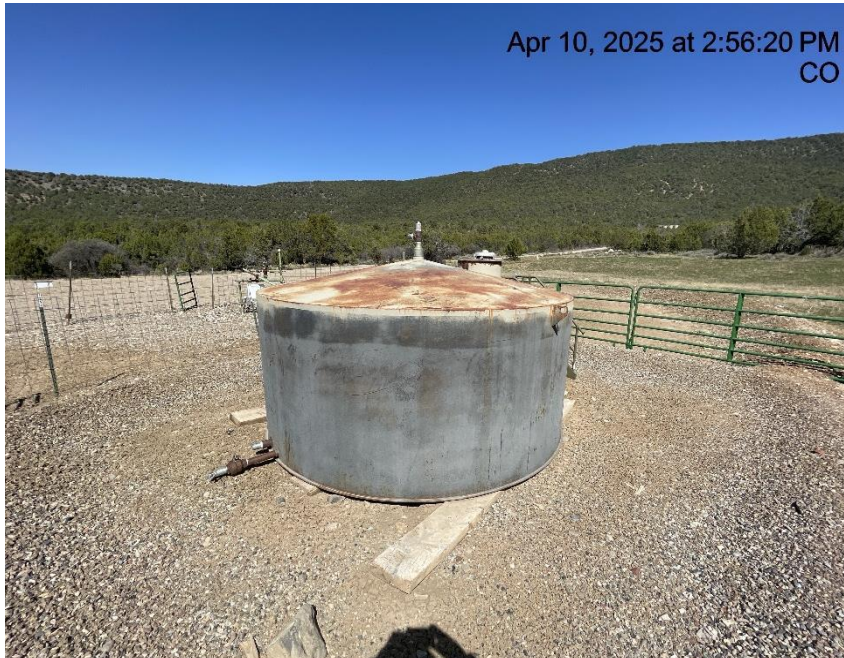
Photo # 626 From inspection 708906247 conducted on 04/10/2025 Tank is disconnected & not in use/unused equipment