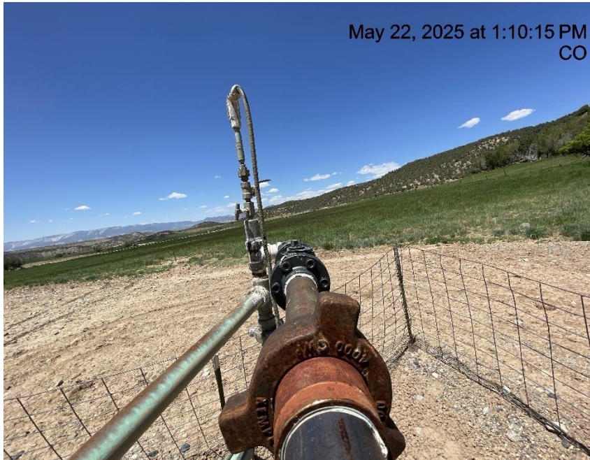
Photo # 2467 GIBSON GULCH UNIT 6-29 well - Ball valve on line connecting BH line to flowline appears to be shut