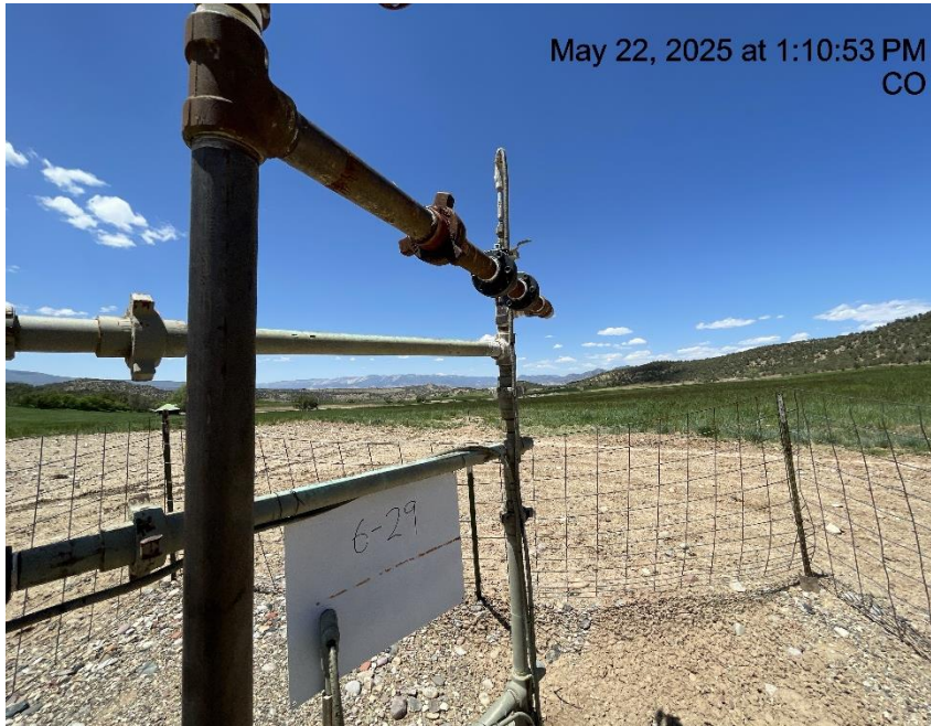
Photo # 2463 GIBSON GULCH UNIT 6-29 well - Ball valve on line connecting BH line to flowline appears to be shut