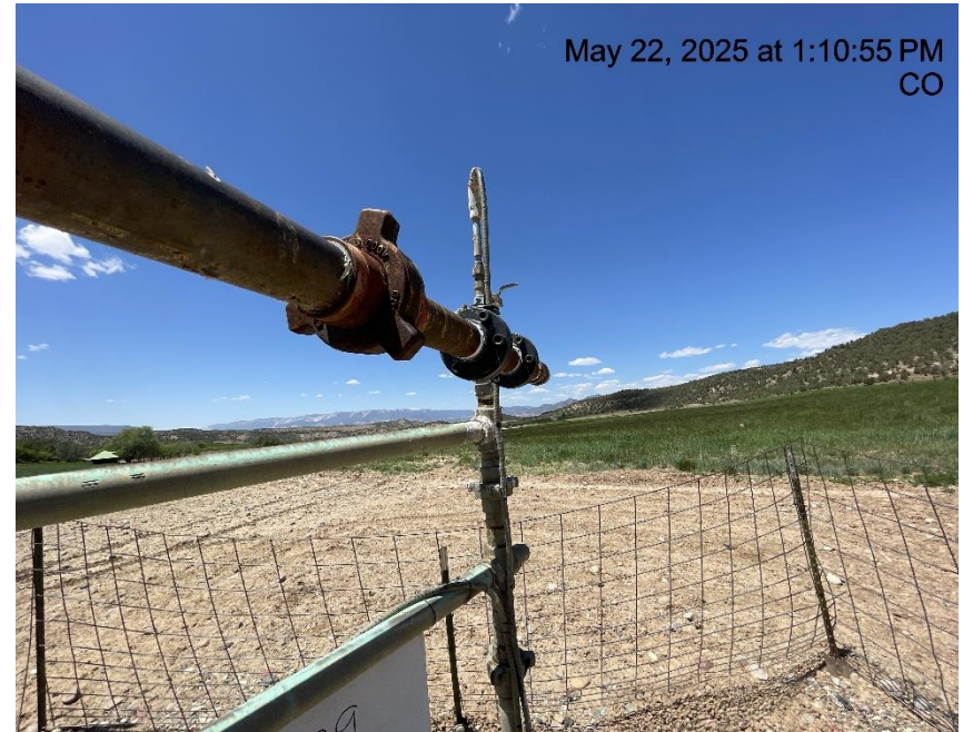
Photo # 2464 GIBSON GULCH UNIT 6-29 well - Ball valve on line connecting BH line to flowline appears to be shut