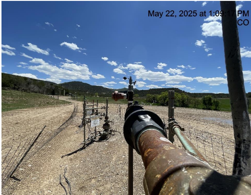
Photo # 2461 GIBSON GULCH UNIT 6-29 well - Ball valve on line connecting BH line to flowline appears to be shut