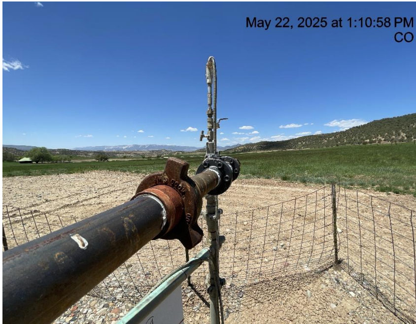
Photo # 2465 GIBSON GULCH UNIT 6-29 well - Ball valve on line connecting BH line to flowline appears to be shut