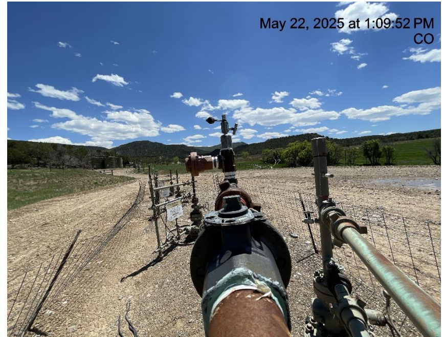
Photo # 2462 GIBSON GULCH UNIT 6-29 well - Ball valve on line connecting BH line to flowline appears to be shut