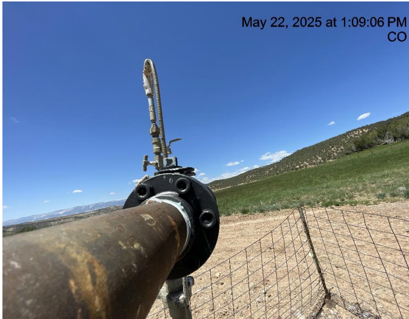
Photo # 2469 GIBSON GULCH UNIT 6-29 well - Ball valve on line connecting BH line to flowline appears to be shut