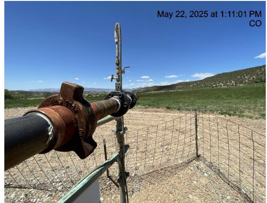
Photo # 2466 GIBSON GULCH UNIT 6-29 well - Ball valve on line connecting BH line to flowline appears to be shut