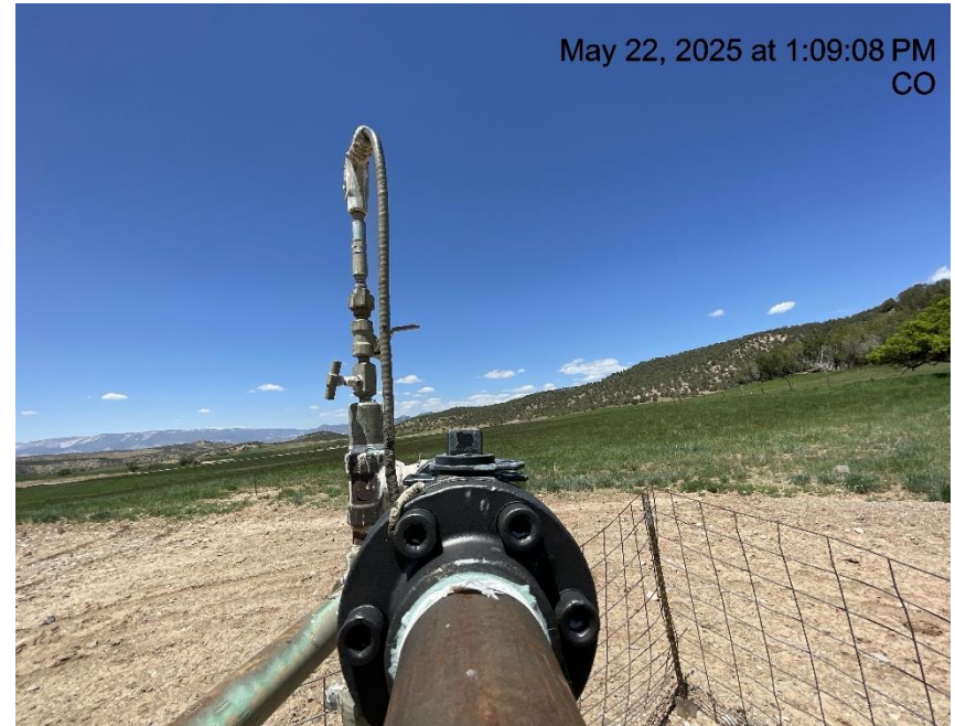
Photo # 2460 GIBSON GULCH UNIT 6-29 well - Ball valve on line connecting BH line to flowline appears to be shut