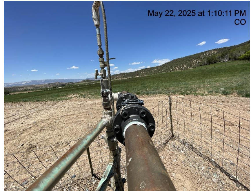
Photo # 2468 GIBSON GULCH UNIT 6-29 well - Ball valve on line connecting BH line to flowline appears to be shut