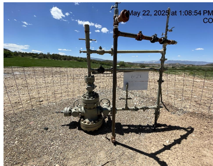
Photo # 2458 GIBSON GULCH UNIT 6-29 well BH line connected to flowline