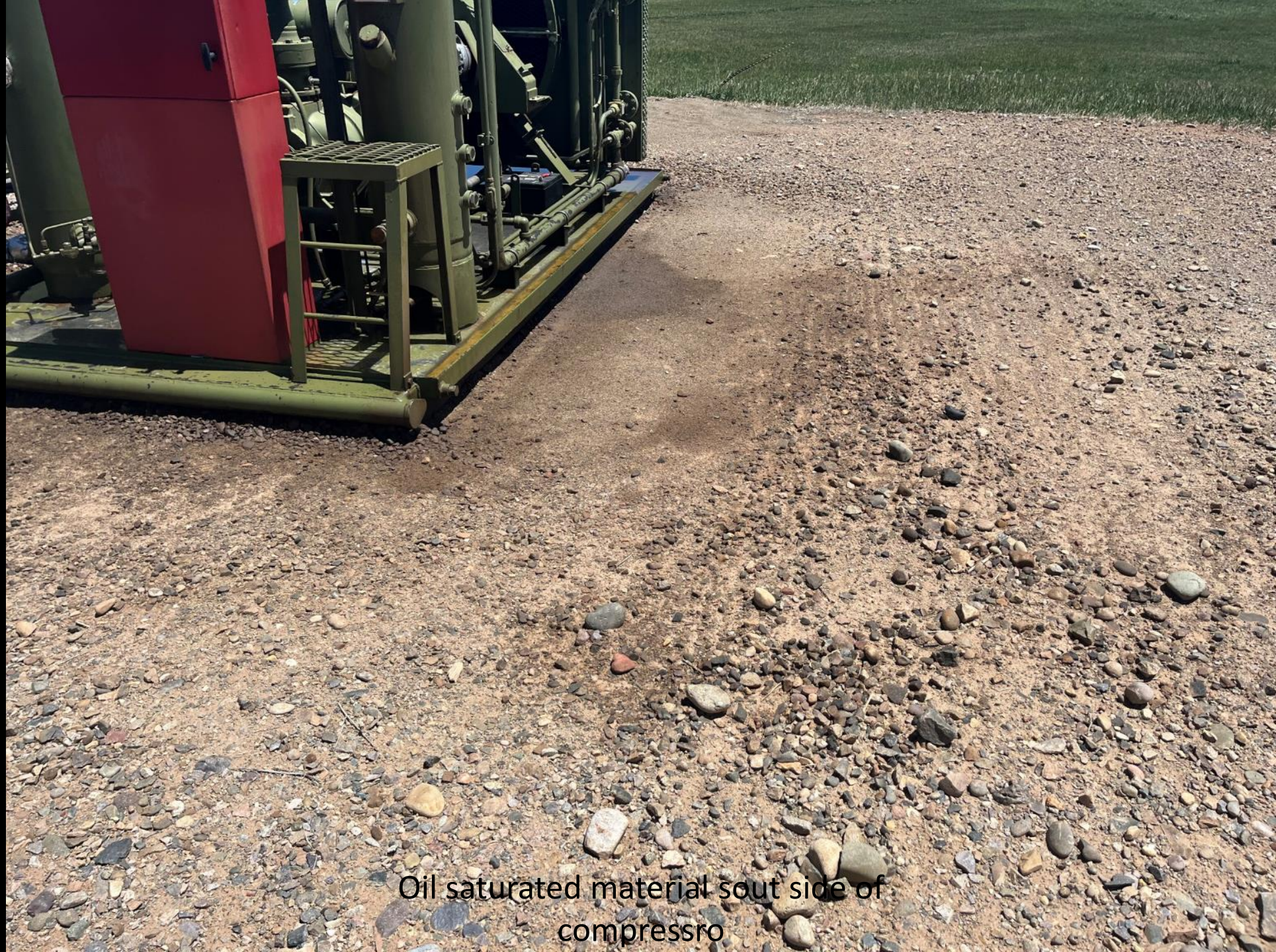
Oil saturated material south side of compressor