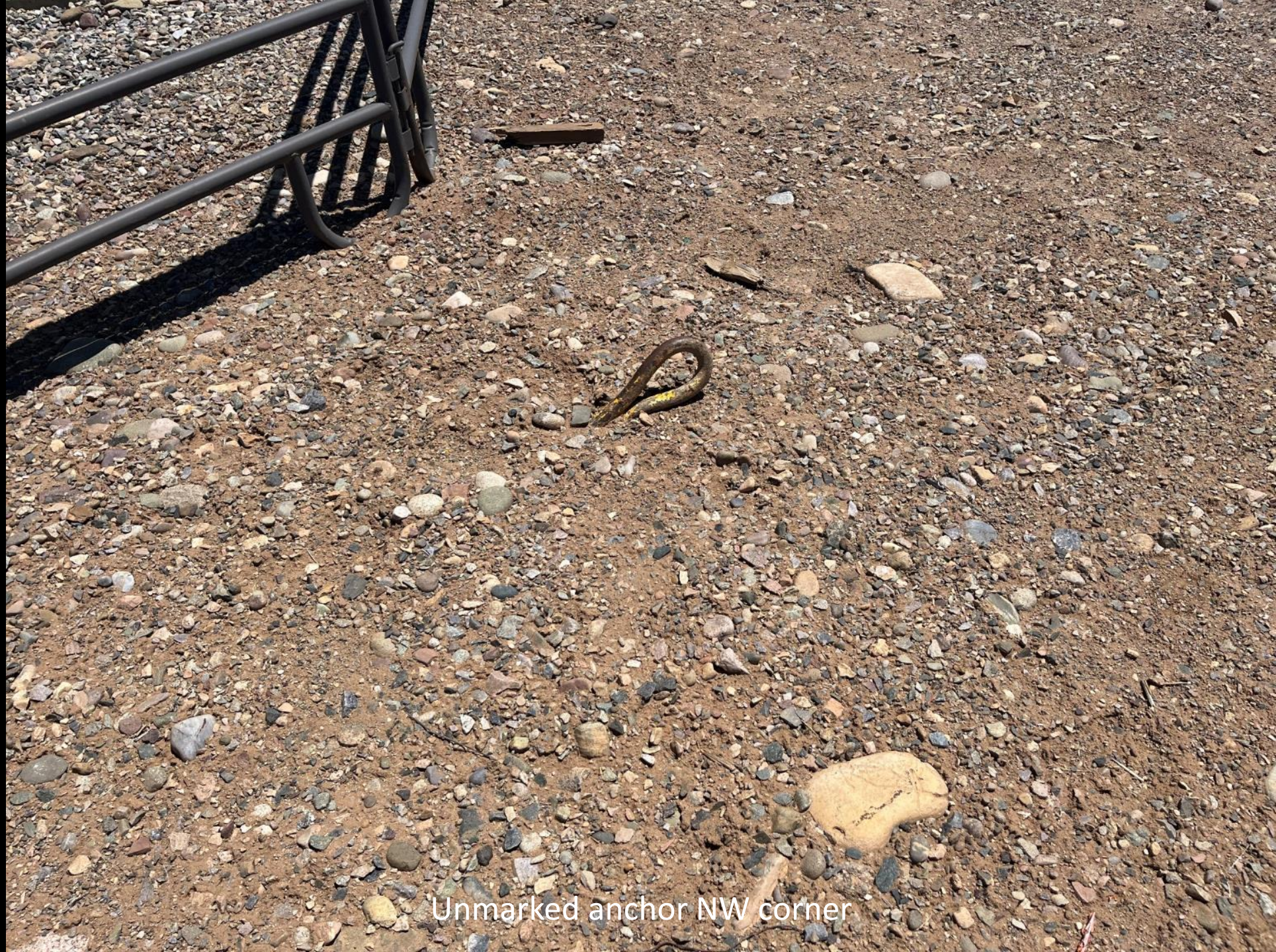
Unmarked anchor NW corner