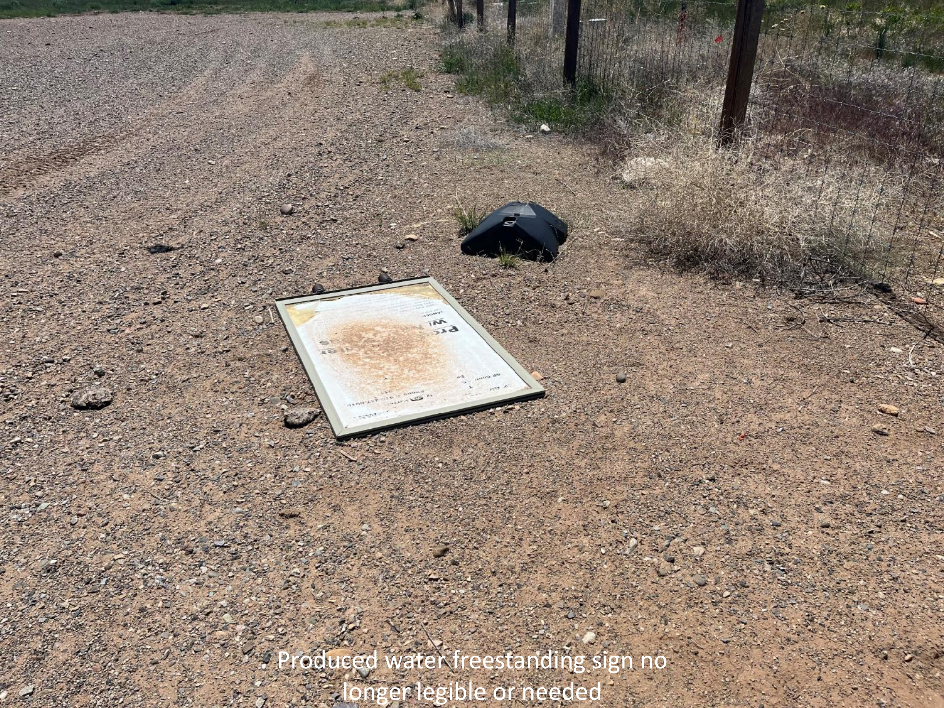
Produced water freestanding sign no longer legible or needed