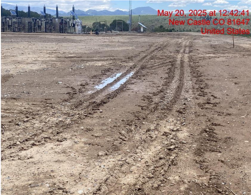
Lack of Stabilization – Photo #08816