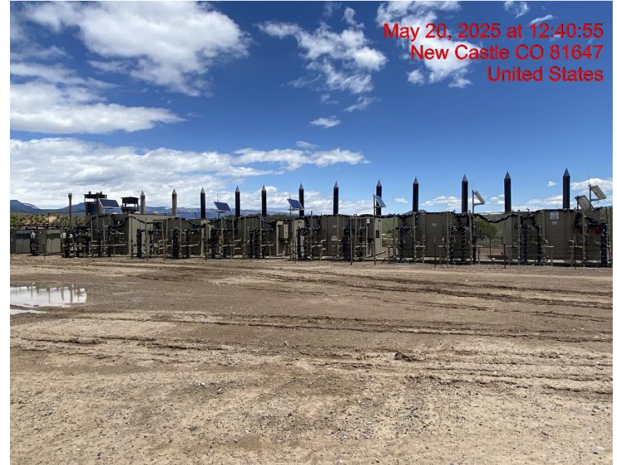
Location – Photo #08791

May 20, 2025 at 12:40:55 New Castle CO 81647 United States