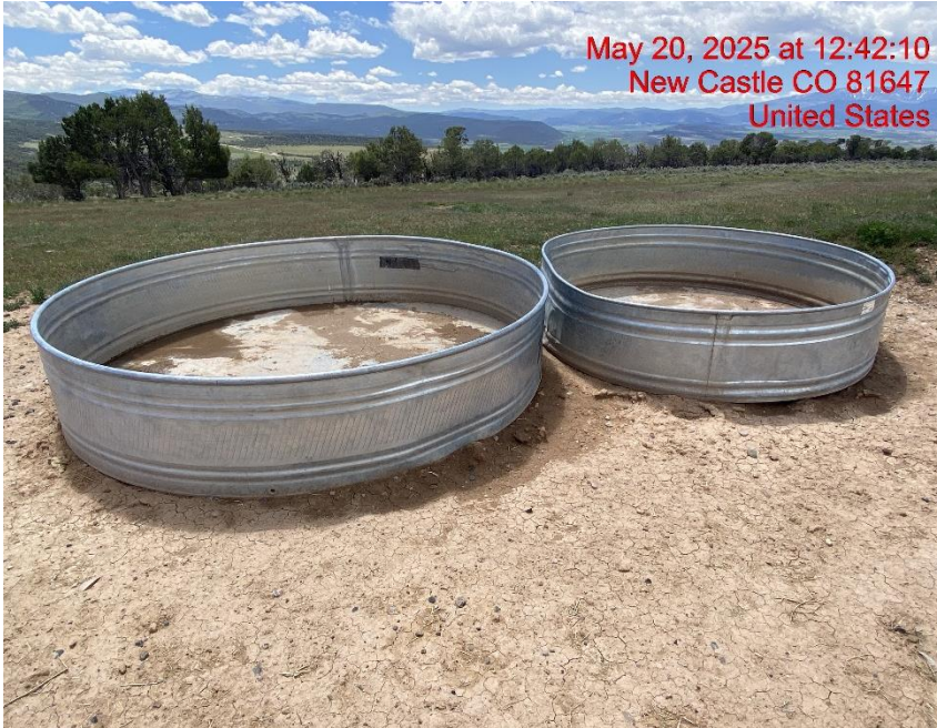
Stored Supplies/Equipment – Photo #08814