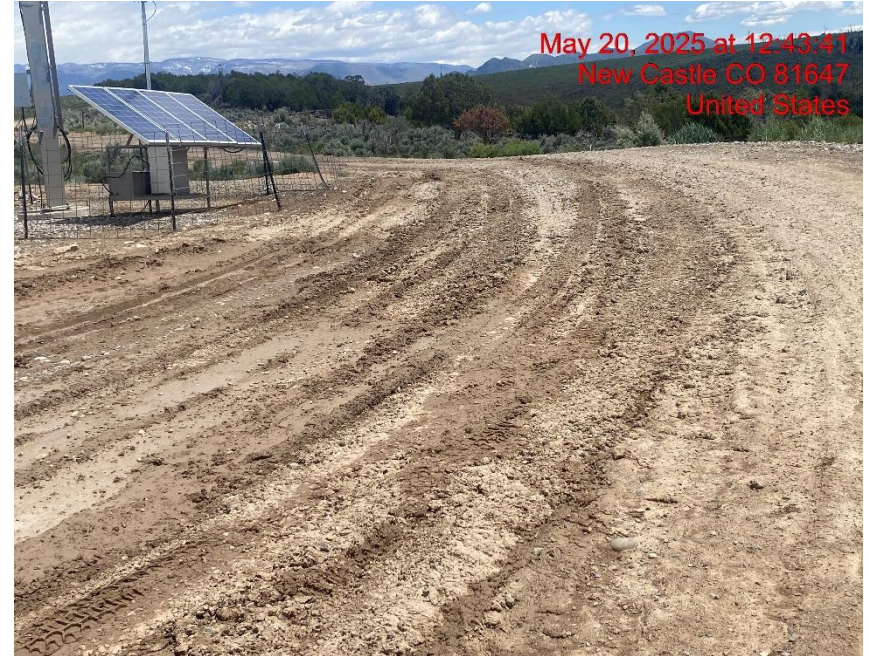
Insufficient Tracking BMPs – Photo #08817