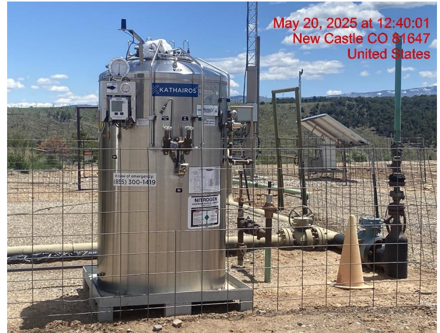
Location – Photo #08812