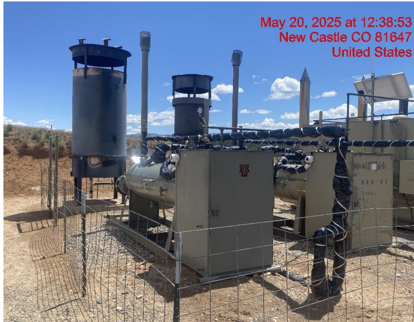
Location – Photo #08811