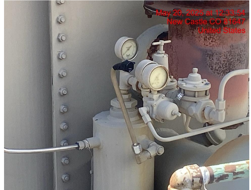
PRV Terminates in Unsafe Manner – Photo #08798