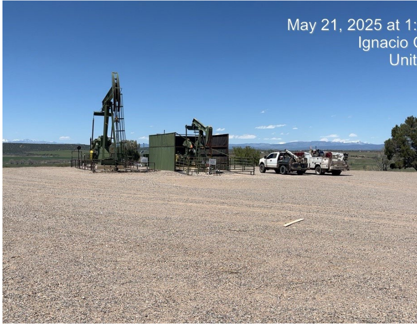
May 21, 2025 at 1:5 Ignacio C Unit