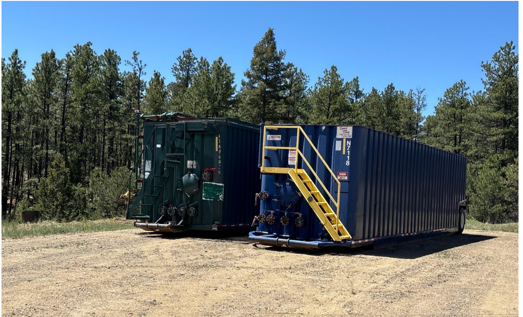
PHOTO 4: UNUSED EQUIPMENT STORED ON LOCATION (TWO FRAC TANKS). REMOVE UNUSED EQUIPMENT PER RULE 606. CA DATE 5/30/2025.