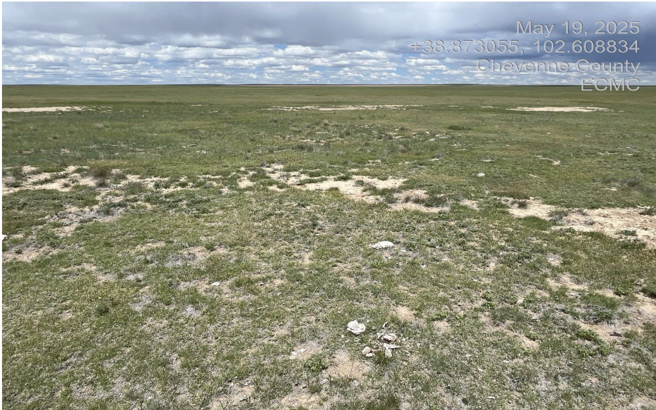
Photo 5. Center of the location facing north..