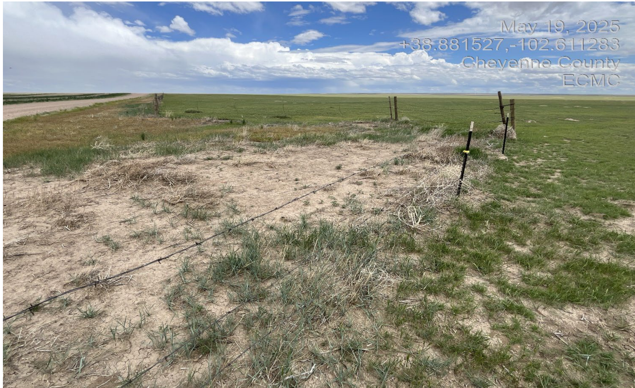
Photo 1. The fence at the entrance has not been installed back to the original position.