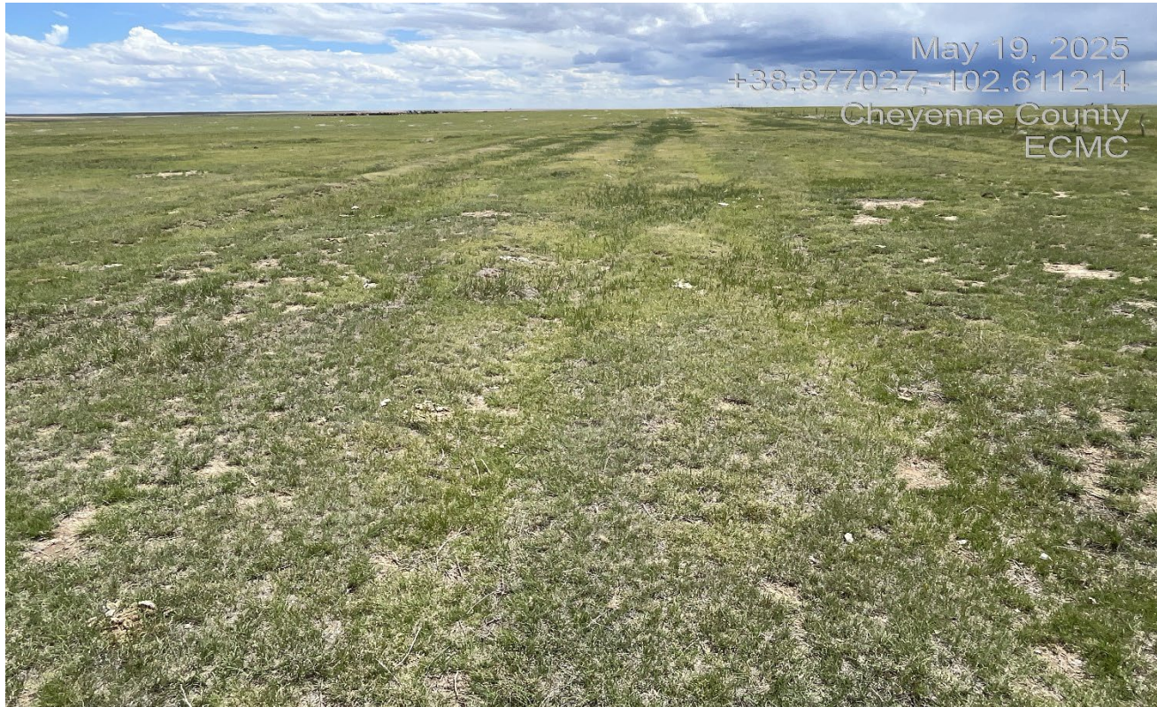
Photo 2. Facing south toward the former access road which has revegetated.