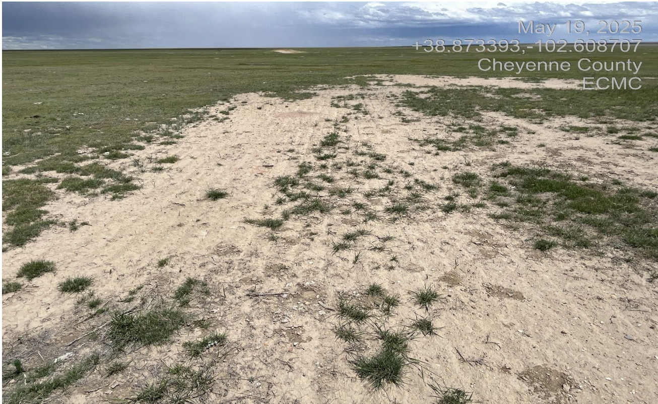
Photo 4. Facing east at the northeast side of the location. It appears this area was recently drill seeded due to visible drill rows. There was some germination observed.