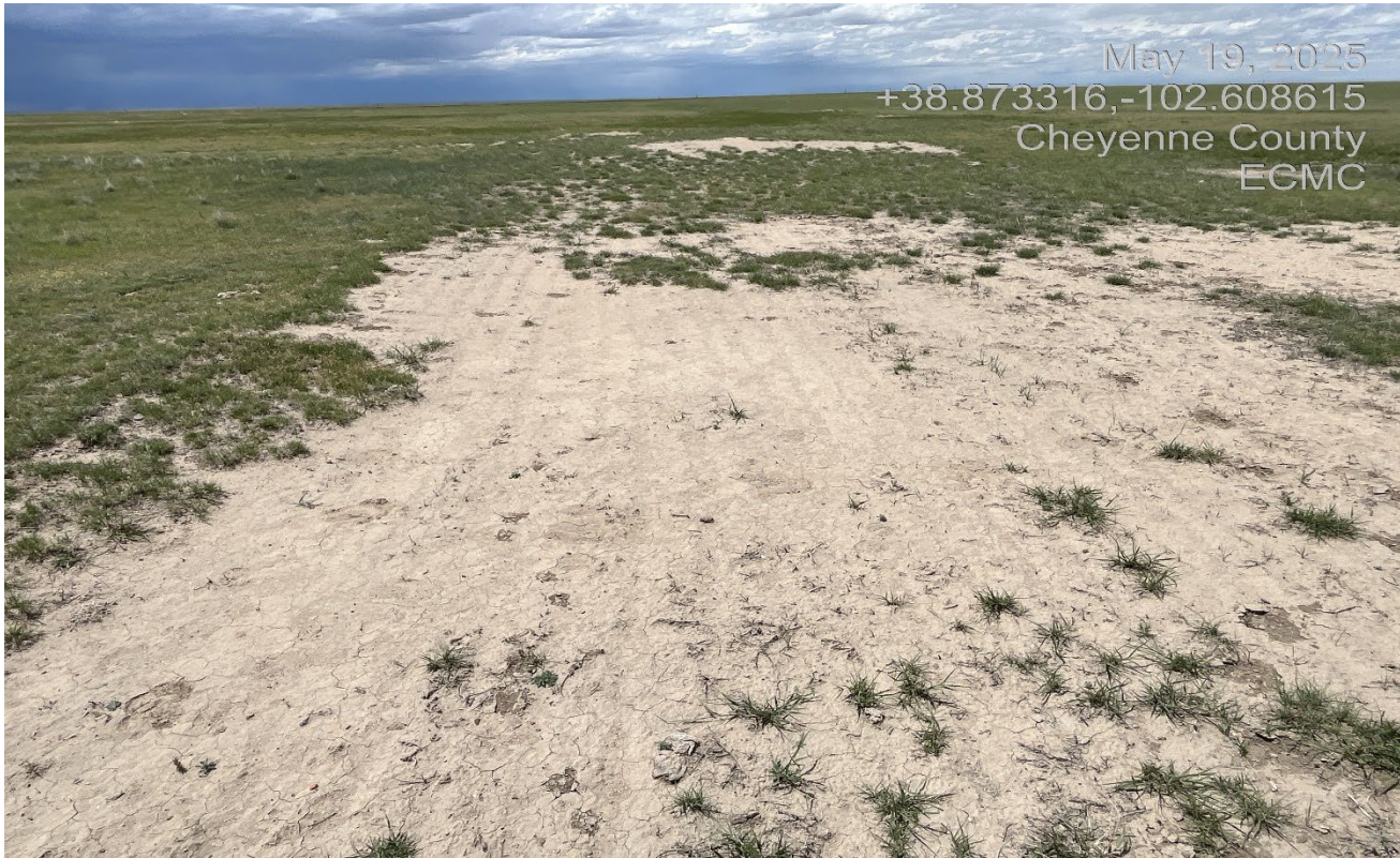
Photo 3. Facing east at the north side of the location. It appears this area was recently drill seeded due to visible drill rows. There was some germination observed.