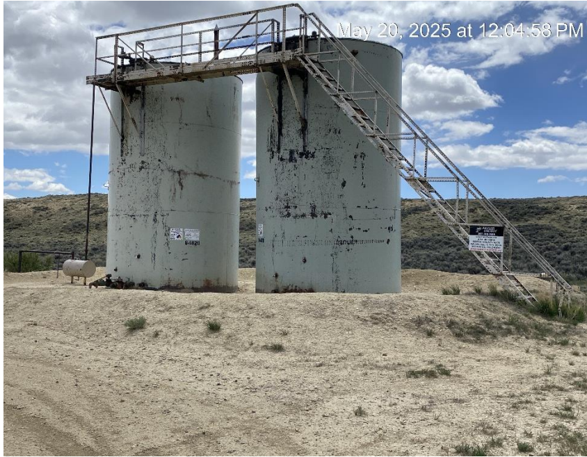
28' x 48' – 18" to 24" depth capacity = 481 bbl maximum