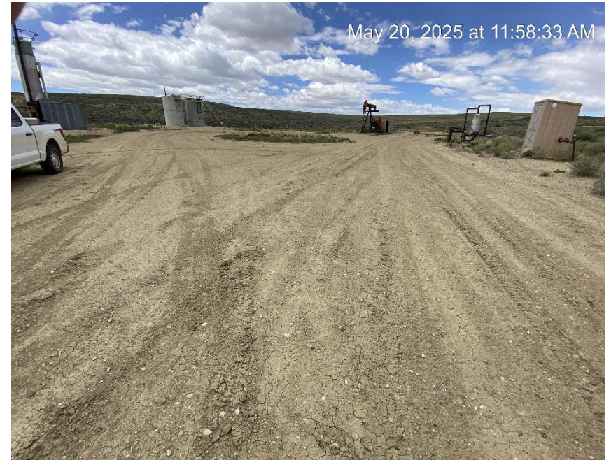
Northeast entrance to location