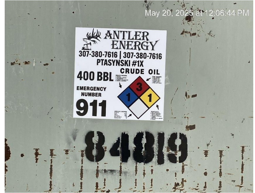
600 bbl tank berm capacity required