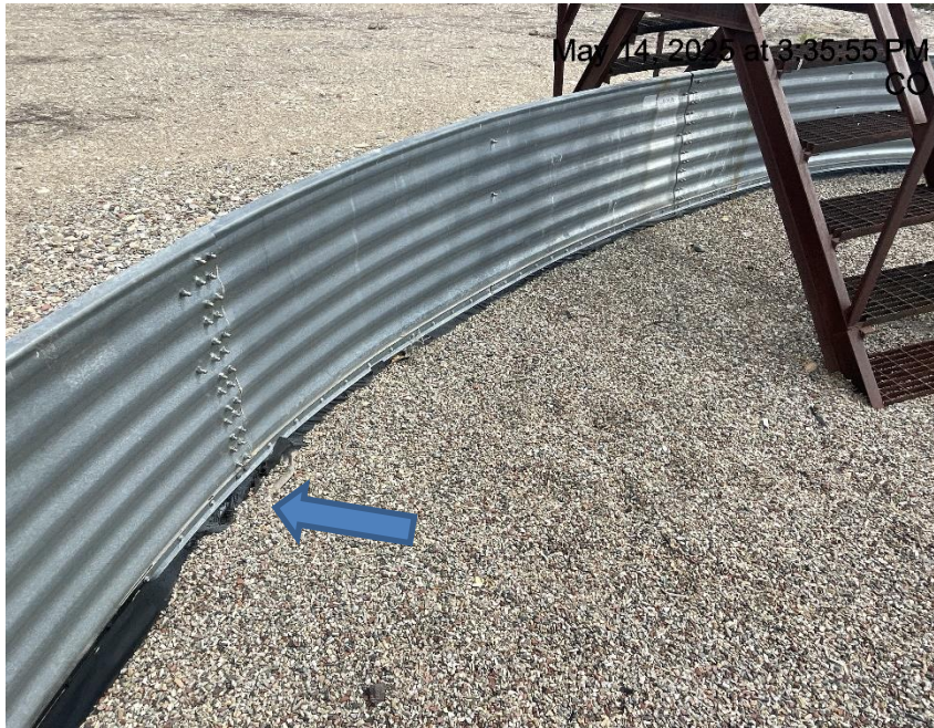
Photo # 1679 Holes in secondary containment liner/liner needs maintenance