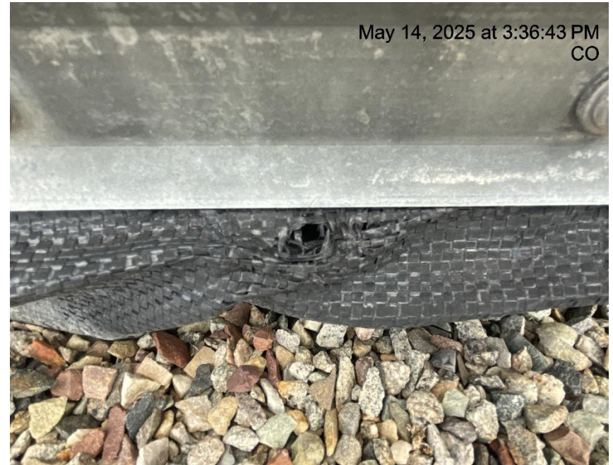
Photo # 1682 Hole in secondary containment liner/liner needs maintenance