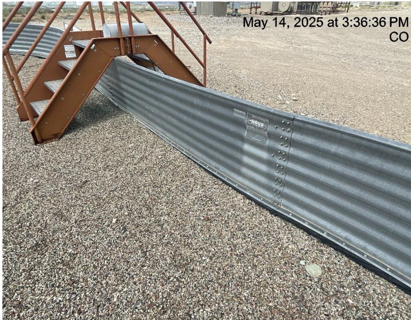
Photo # 1681 Hole in secondary containment liner/liner needs maintenance