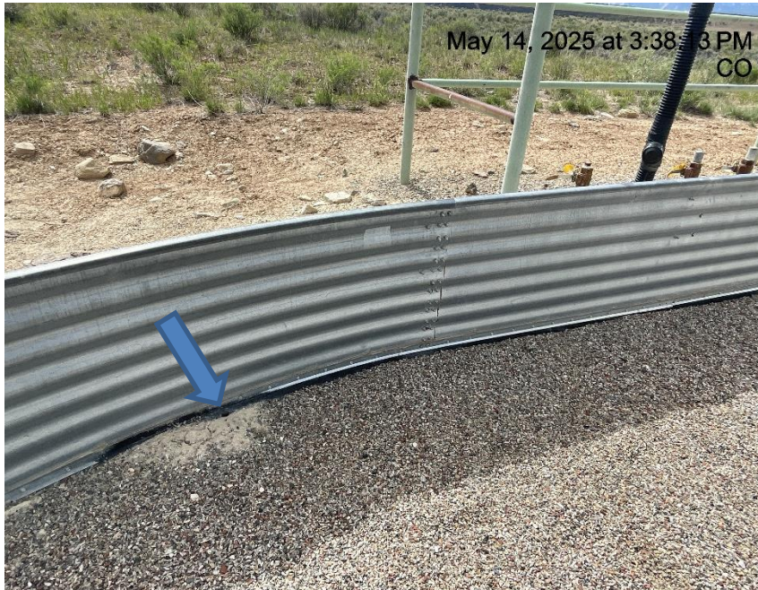
Photo # 1687 Hole in secondary containment liner/liner needs maintenance