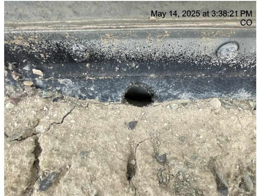
Photo # 1688 Hole in secondary containment liner/liner needs maintenance