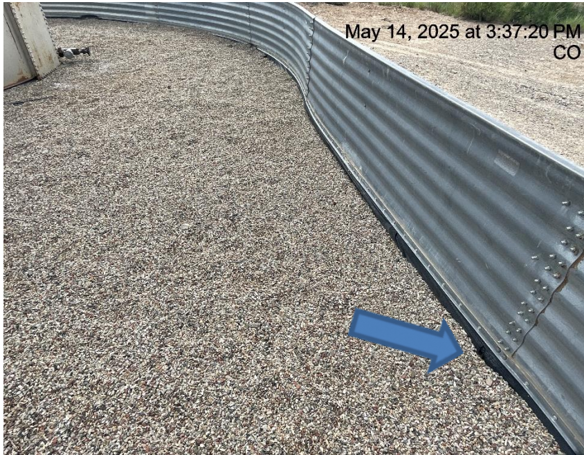
Photo # 1685 Hole in secondary containment liner/liner needs maintenance