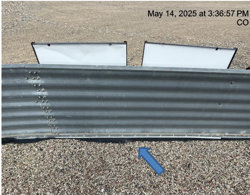
Photo # 1683 Hole in secondary containment liner/liner needs maintenance