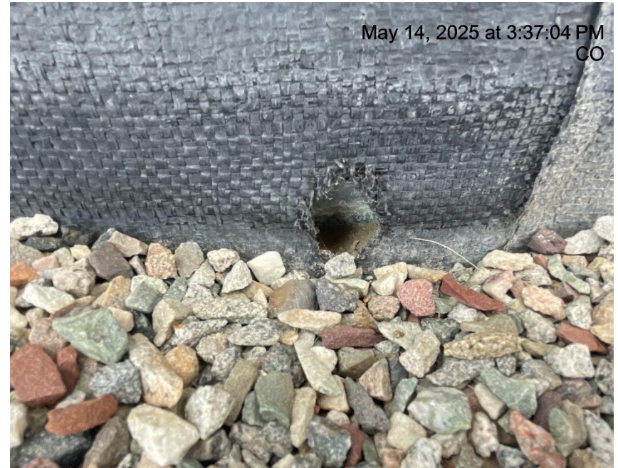
Photo # 1684 Hole in secondary containment liner/liner needs maintenance