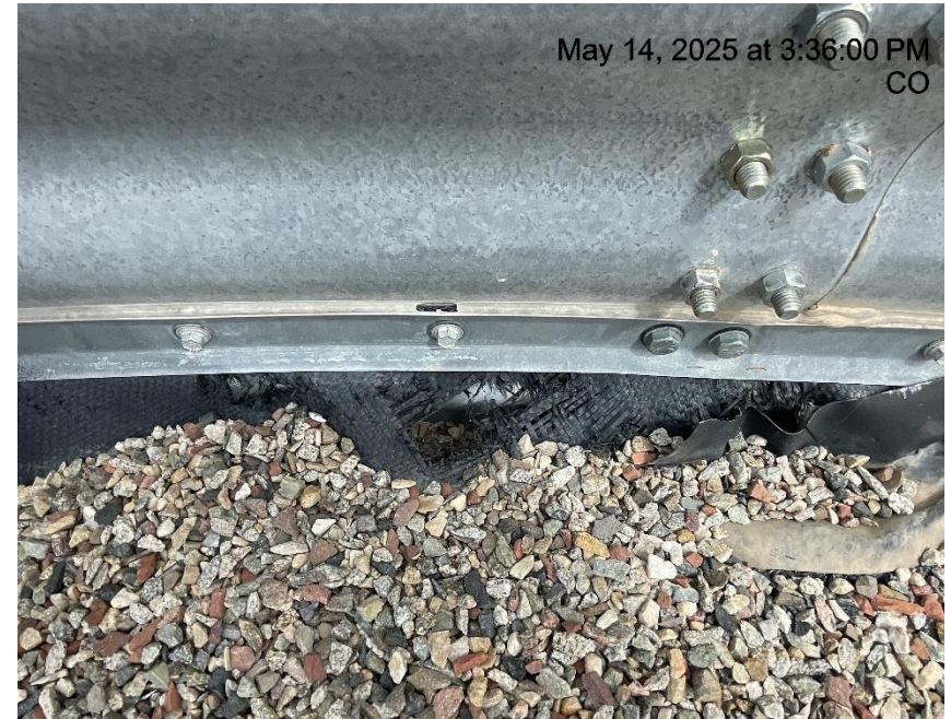
Photo # 1680 Holes in secondary containment liner/liner needs maintenance