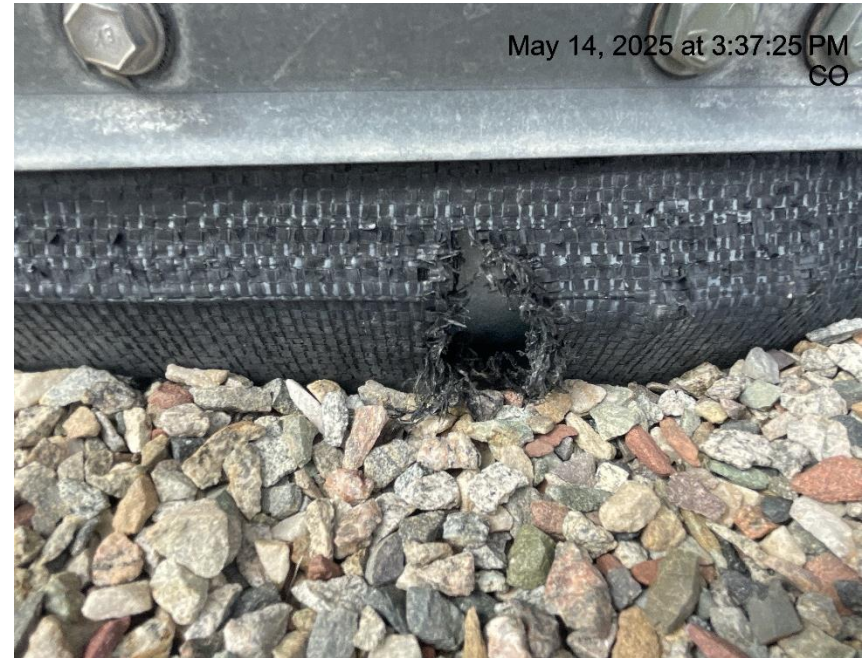
Photo # 1686 Hole in secondary containment liner/liner needs maintenance