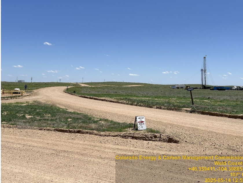
Colorado Energy & Carbon Management Commission Weld County +40.359411, -104.396851 107° E 2025-05-14 12:57