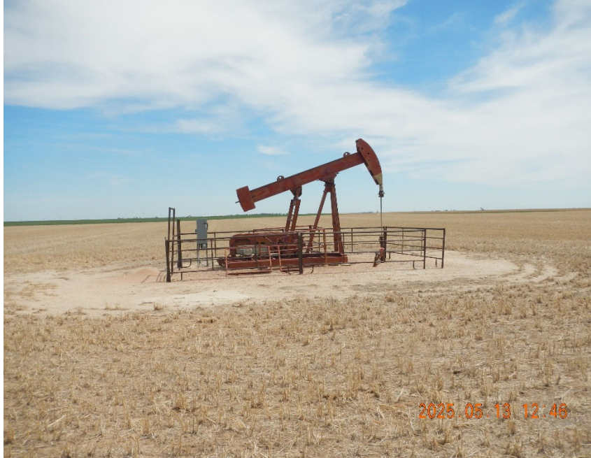
3. Well location overview.