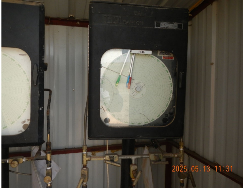
5. Gas meter inside meter shed.