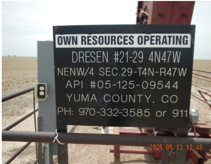
1. Lease sign at well location.