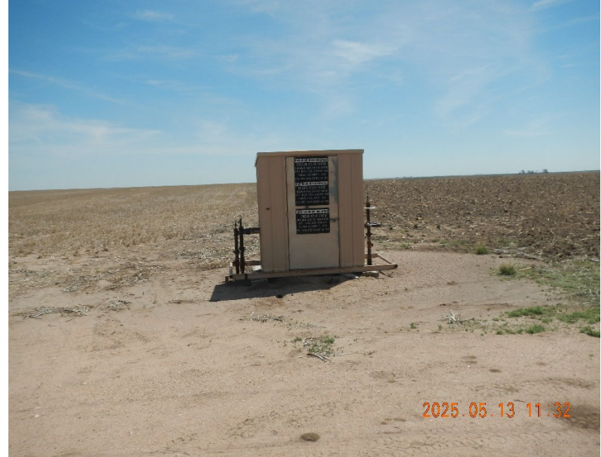
6. Gathering location overview.