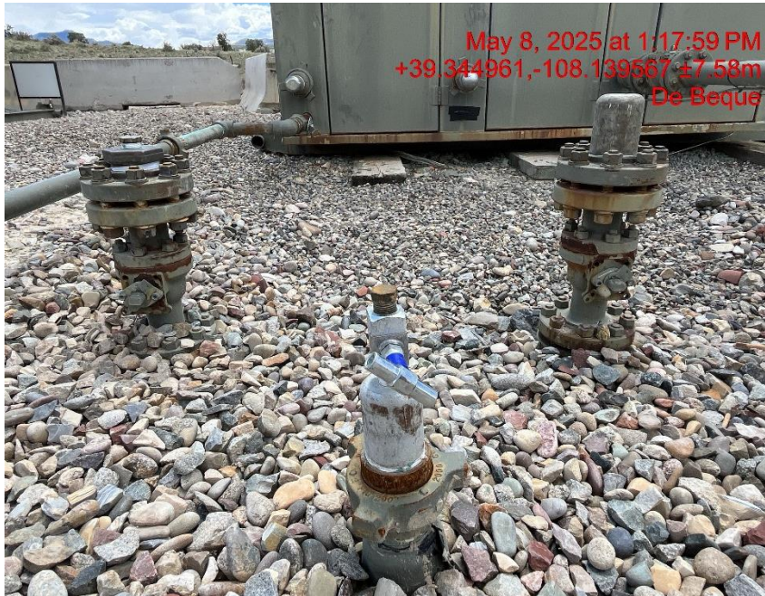
Photo # 7293 Multiple unused flowlines at separators lack lockout tagout (OOSLAT)