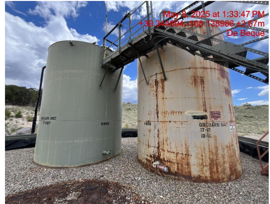
Photo # 7314 One condensate tank is rusting in some areas, paint is inadequate.