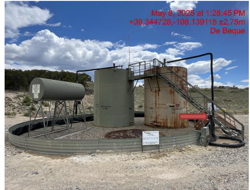
Photo # 7305 Location - 1 unused flowline at tank battery lacks lockout tagout (OOSLAT)