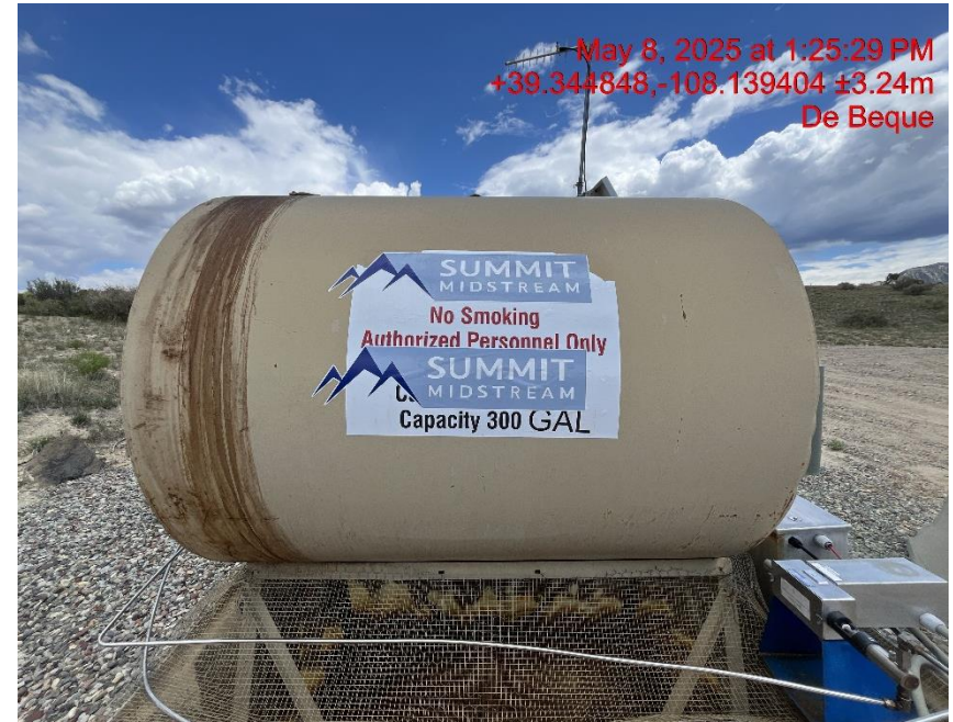
Photo # 7301 Methanol tank lacks required information. Additionally capacity is incorrect.