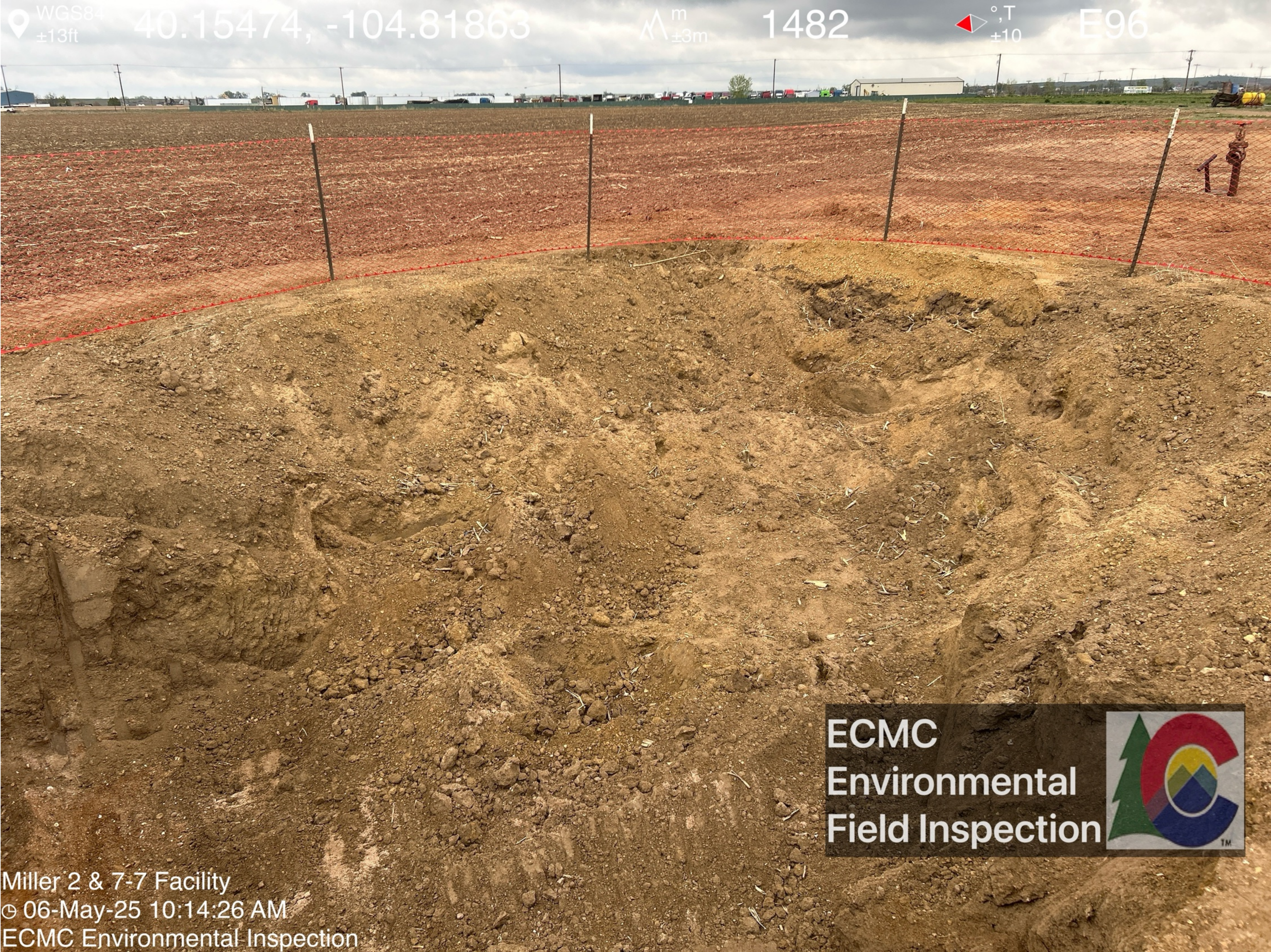
Approximate location of Spill ID 489966 (former produced water vault).