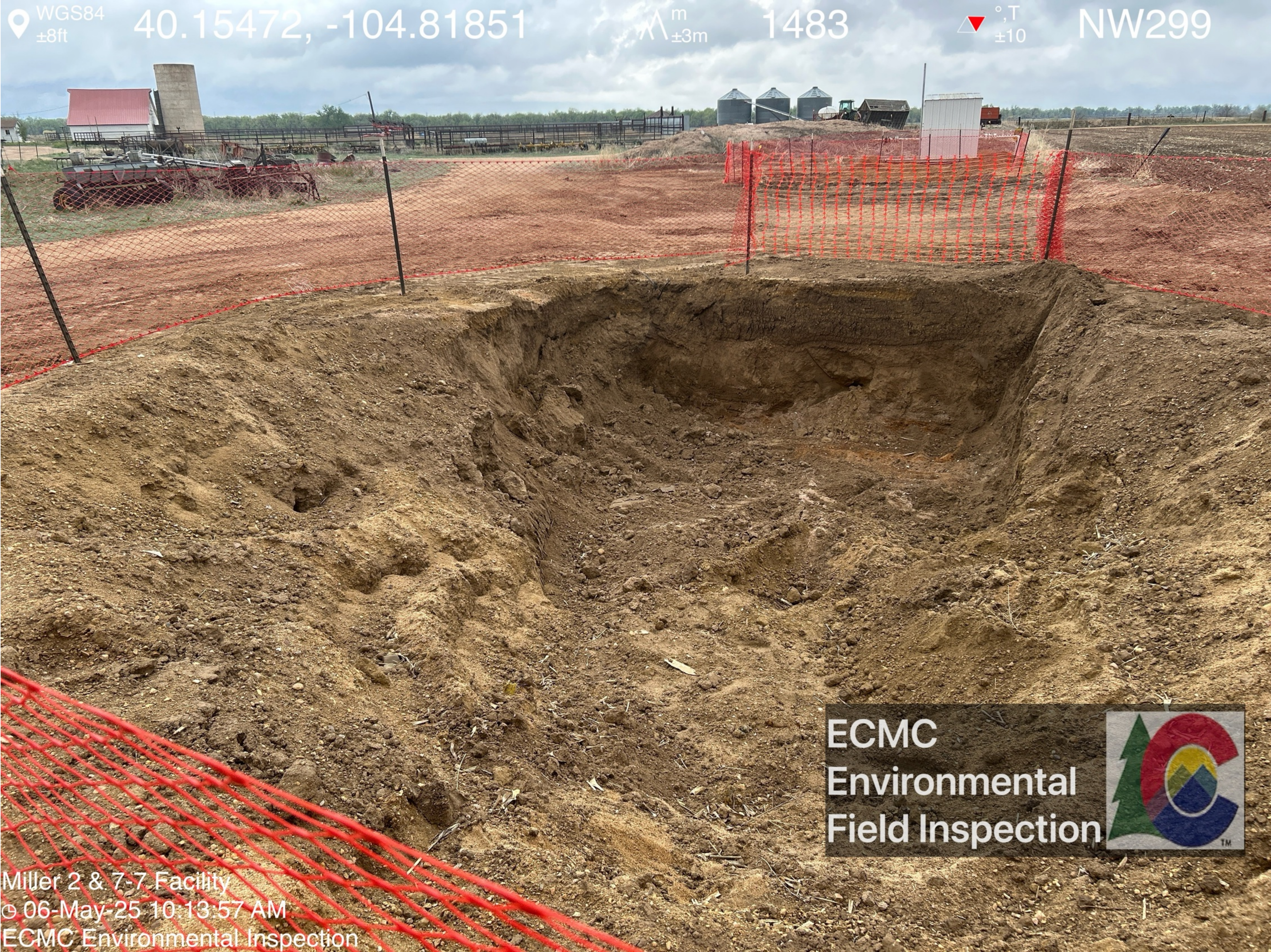
Approximate location of Spill ID 489966 (former produced water vault).