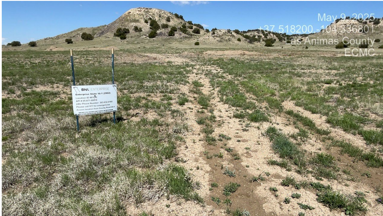
Photo 3. Facing west toward the location. Sign is posted at the location.