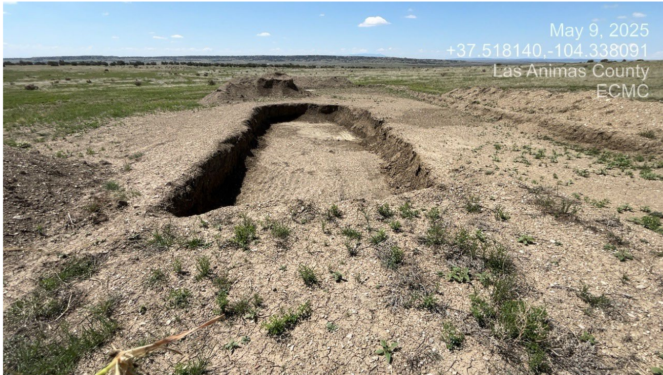
Photo 10. Facing toward the excavation at the southwest corner.