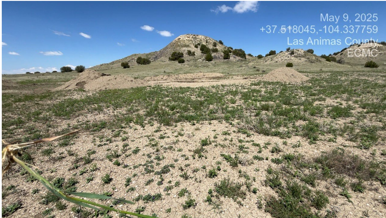
Photo 9. Facing west toward the southwest corner where remediation and excavated material remains.