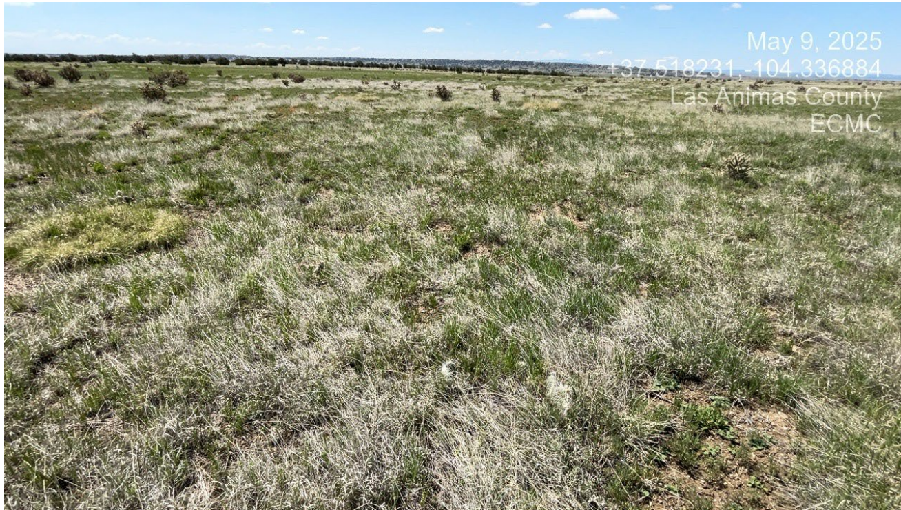
Photo 12. Facing south toward the surrounding undisturbed area which consists of native perennial vegetation.