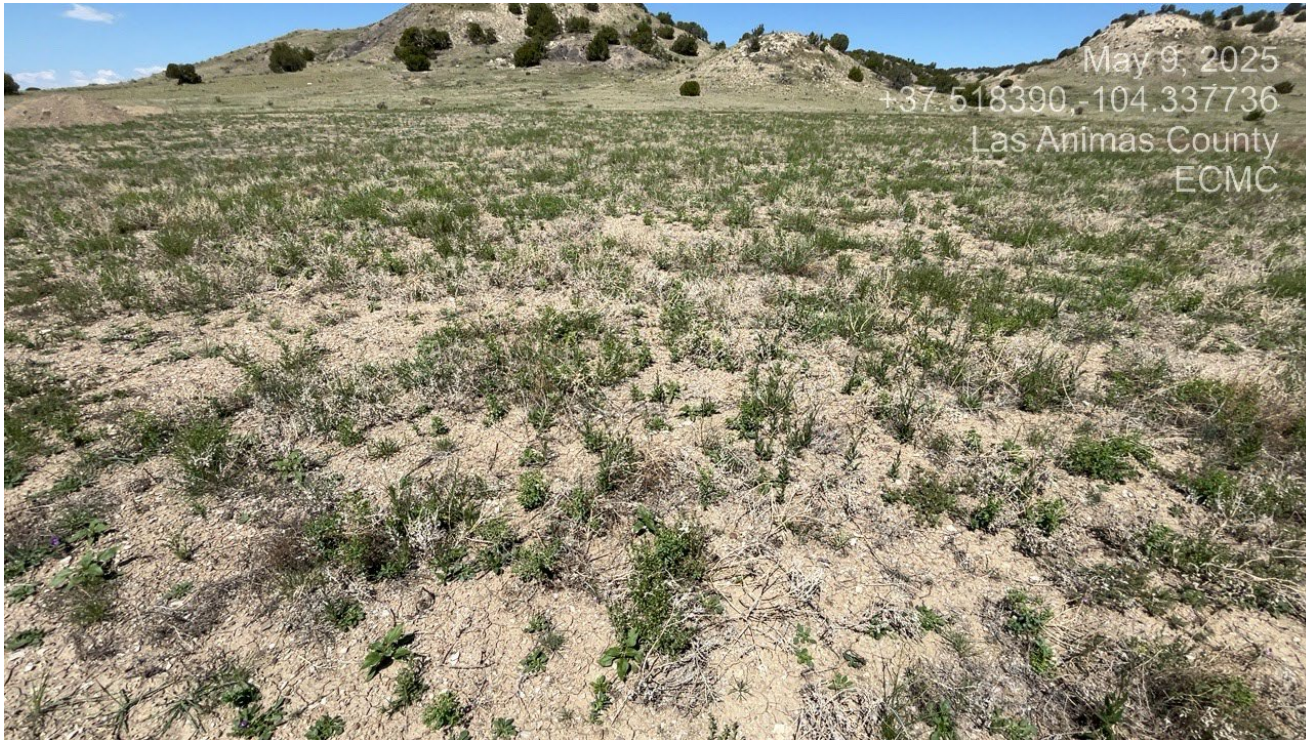
Photo 7. Center of the location facing west.