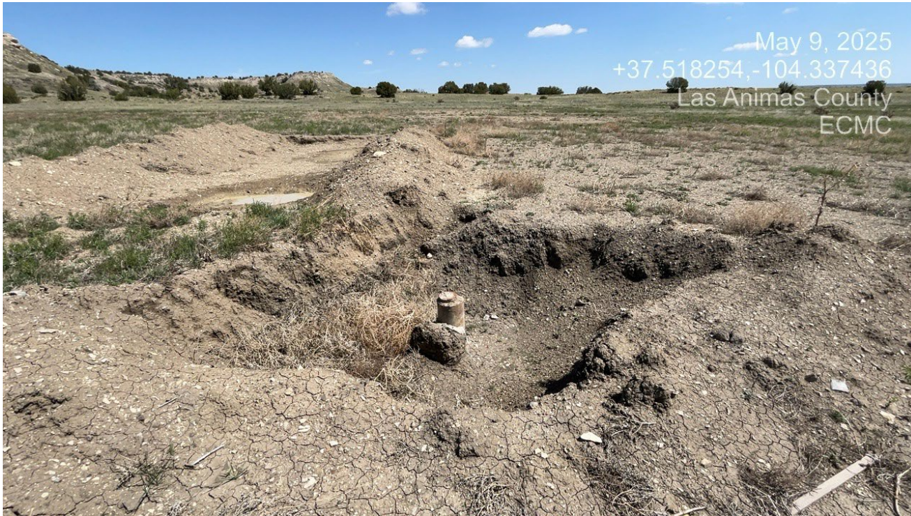
Photo 5. Facing north at the excavation around the wellhead. Remediation remains in process.