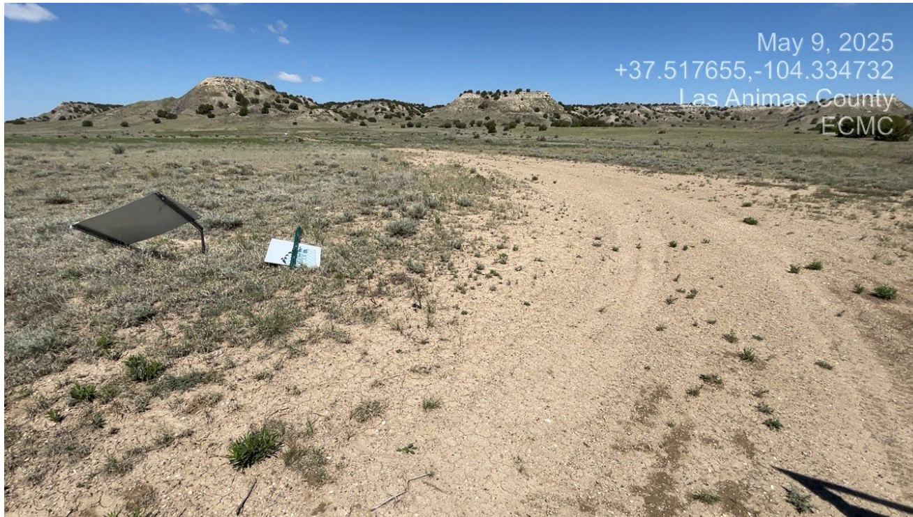
Photo 1. Facing northwest toward the beginning of the access road. The road has not been reclaimed. The sign has fallen over.