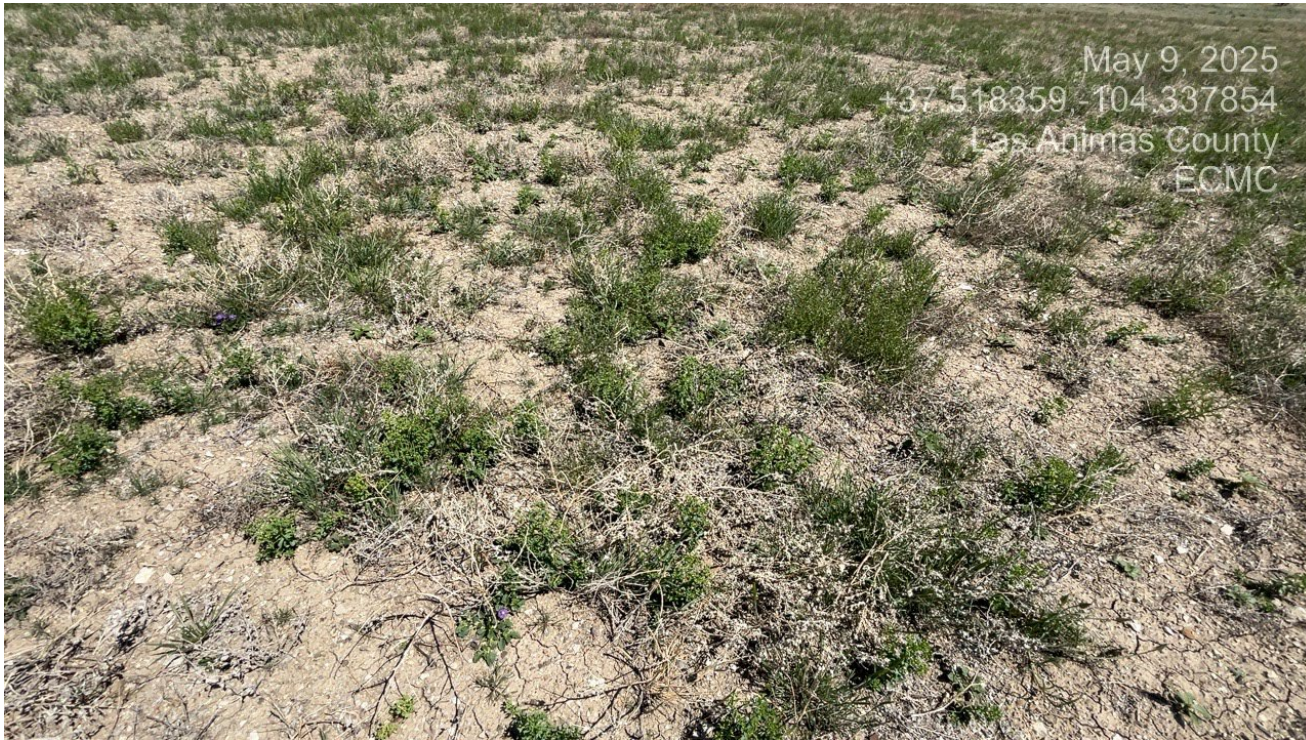
Photo 8. View of vegetation cover throughout the location consists of mostly weedy annuals such as Warty spurge, Little barley, Russian thistle, Sunflower among other.