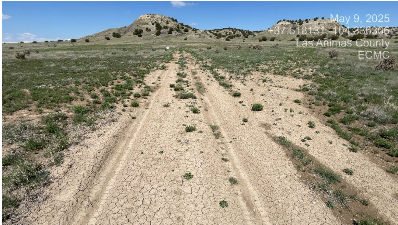
Photo 2. Facing west along the access road which is not establishing vegetation.