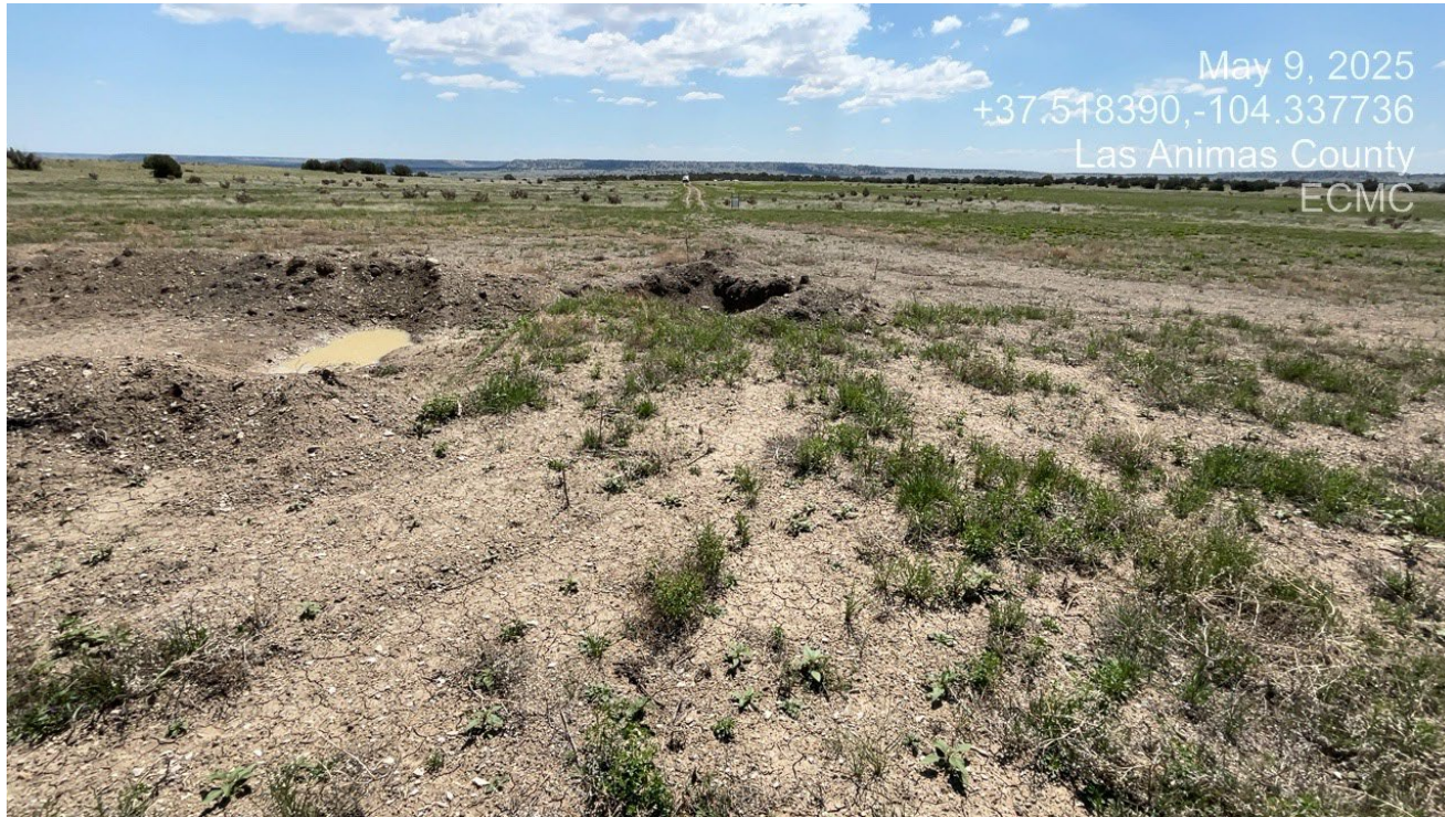
Photo 6. Center of the location facing east..