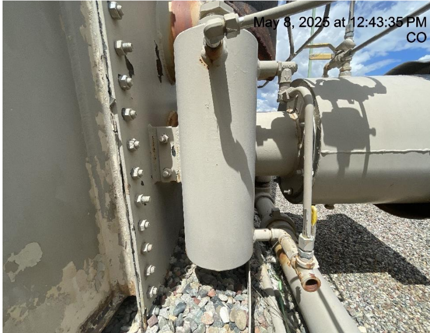
Photo # 9919 PRV vent line does not comply with CECMC pressure safety device rules or general safety rules