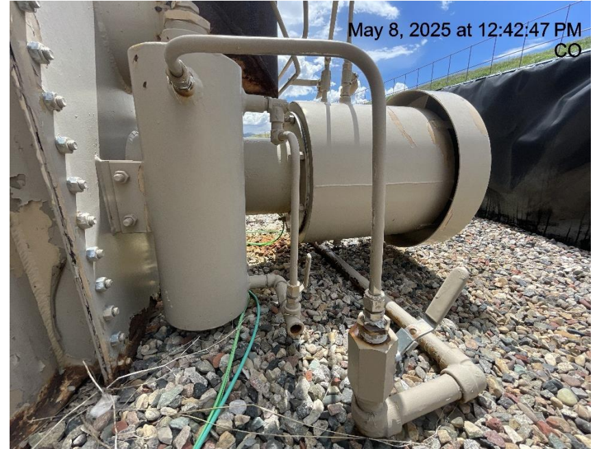
Photo # 9920 PRV vent line does not comply with CECMC pressure safety device rules or general safety rules