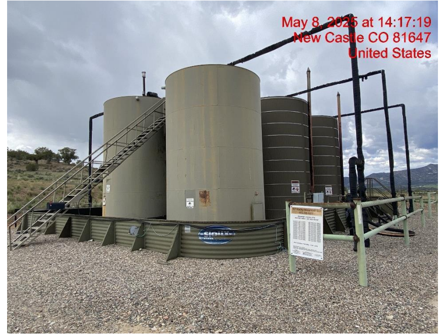
Location – Photo #08613