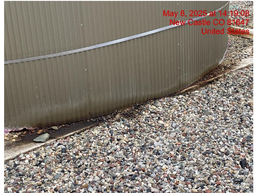
Staining – Photo #08617