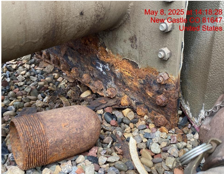
Corroded Tank Manway – Photo #08615