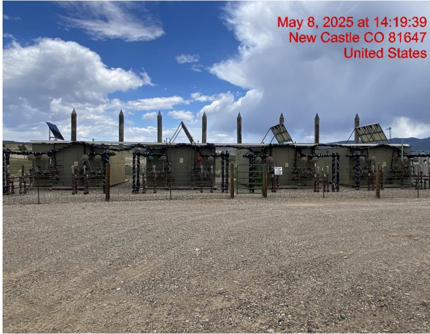
Location – Photo #08618