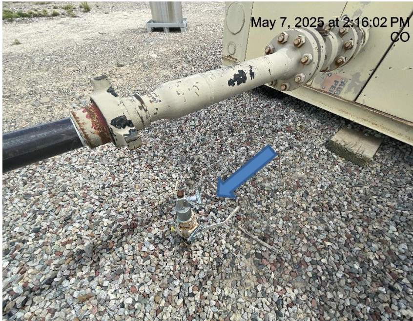
Photo # 9464 Unused flowline near separators lacks lockout tagout (OOSLAT)