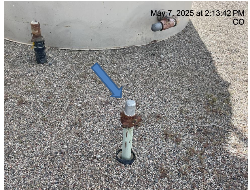
Photo # 9463 Unused flowline in secondary containment lacks lockout tagout (OOSLAT)