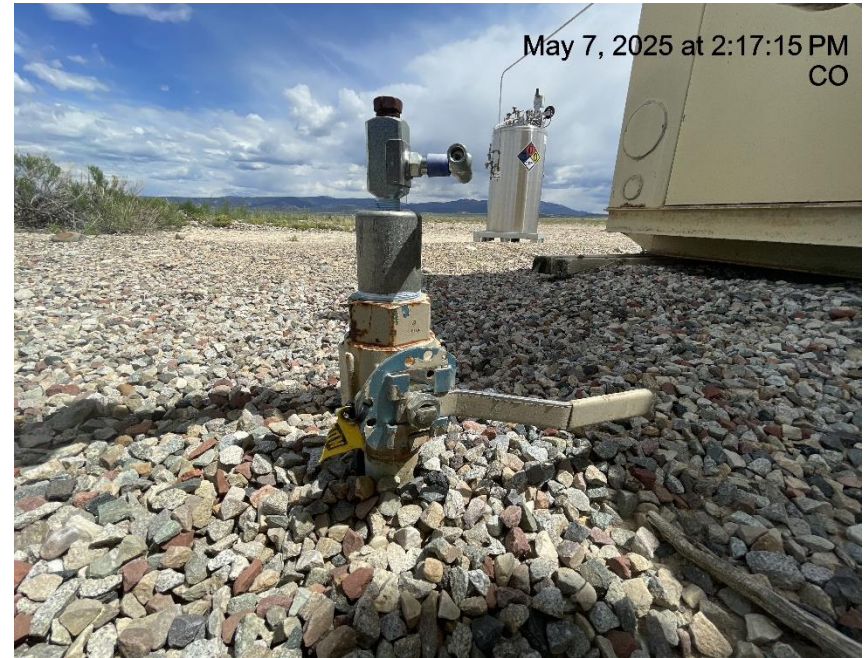
Photo # 9465 Unused flowline near separators lacks lockout tagout (OOSLAT)