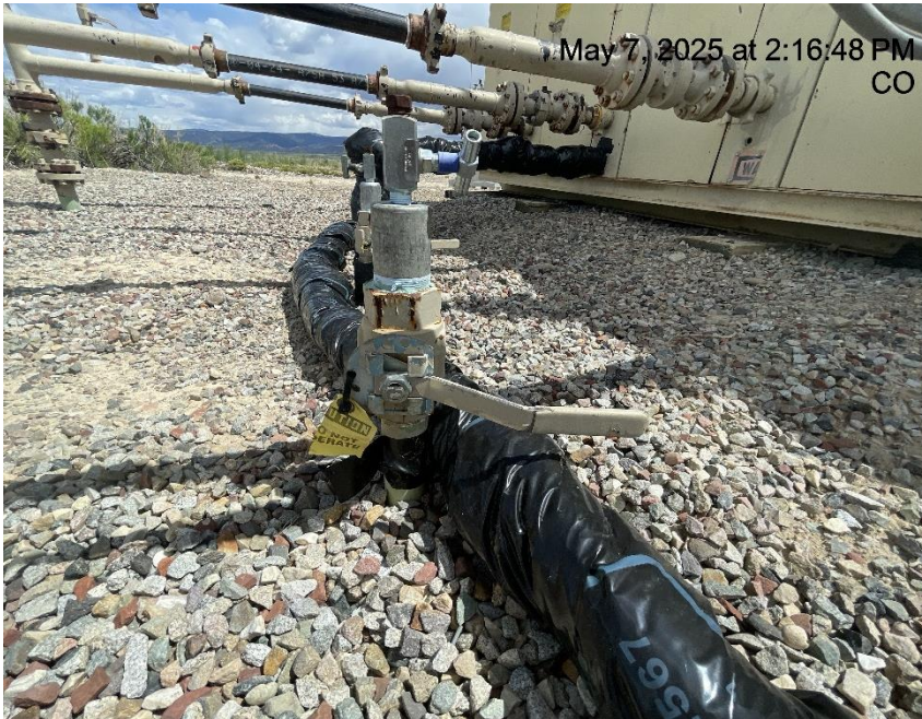
Photo # 9468 Unused flowline near separators does not comply with CECMC lockout tagout (OOSLAT) rules