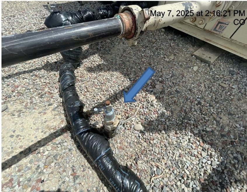
Photo # 9466 Unused flowline near separators lacks lockout tagout (OOSLAT)