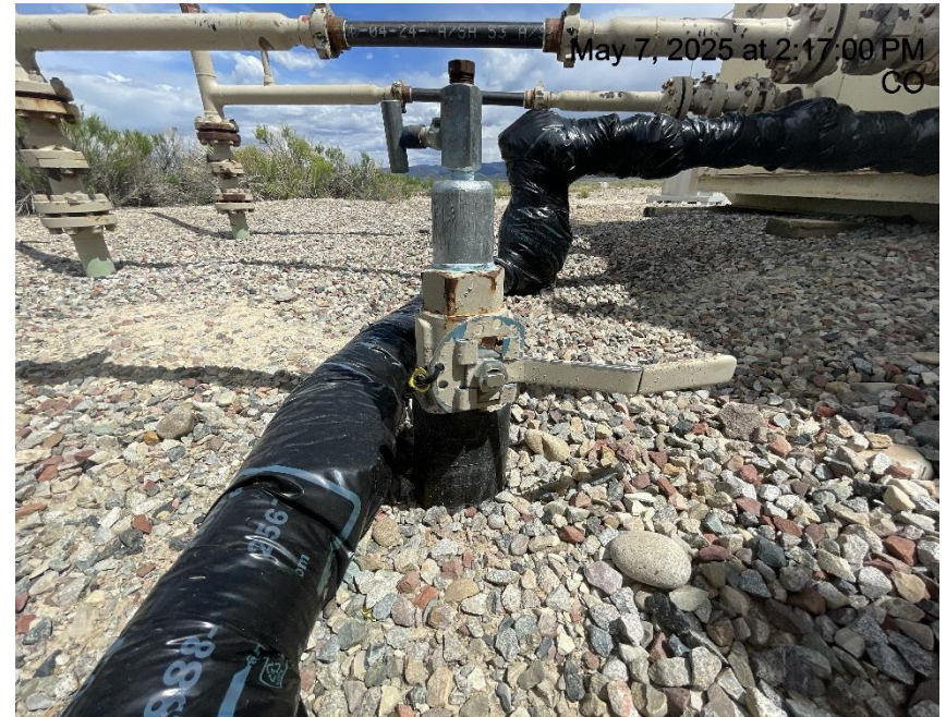
Photo # 9467 Unused flowline near separators lacks lockout tagout (OOSLAT)