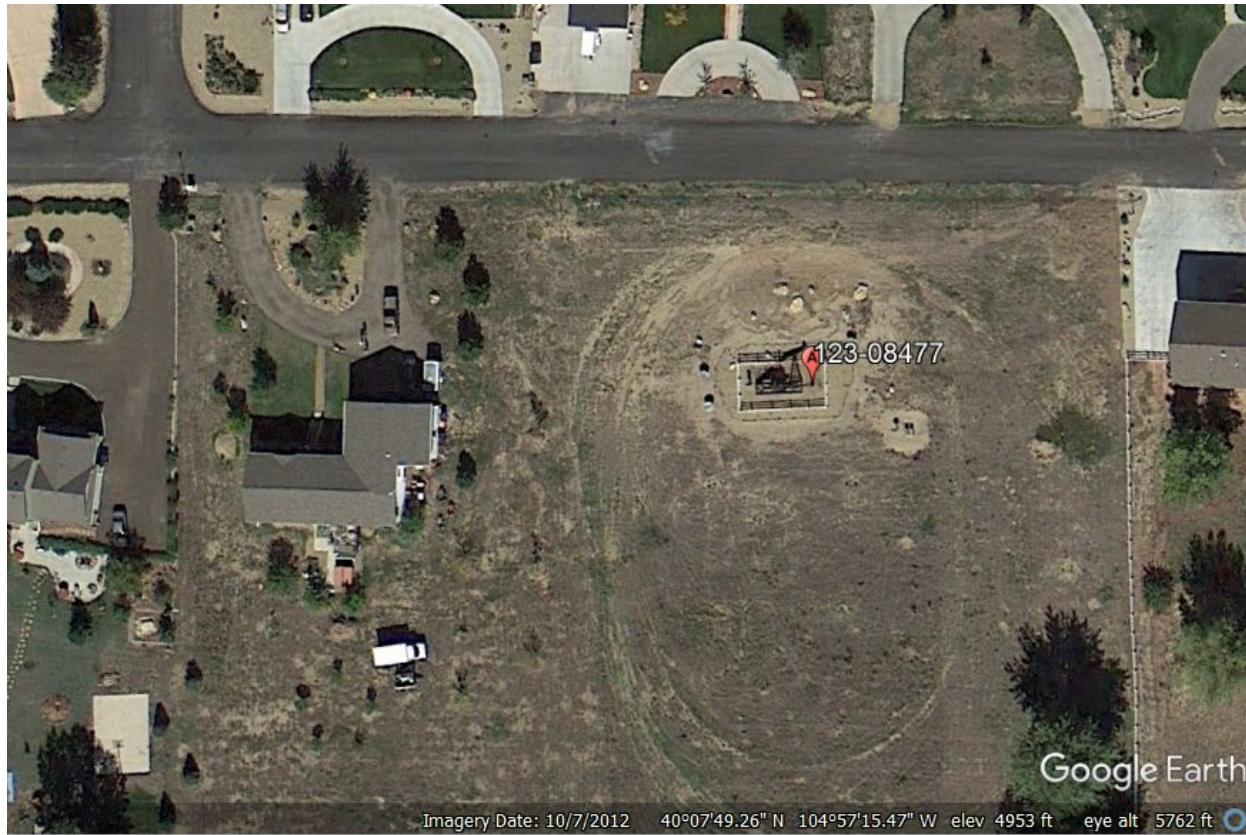
Photo 1. Google Earth aerial imagery from October 7, 2012. Photo illustrates the well location during active operations