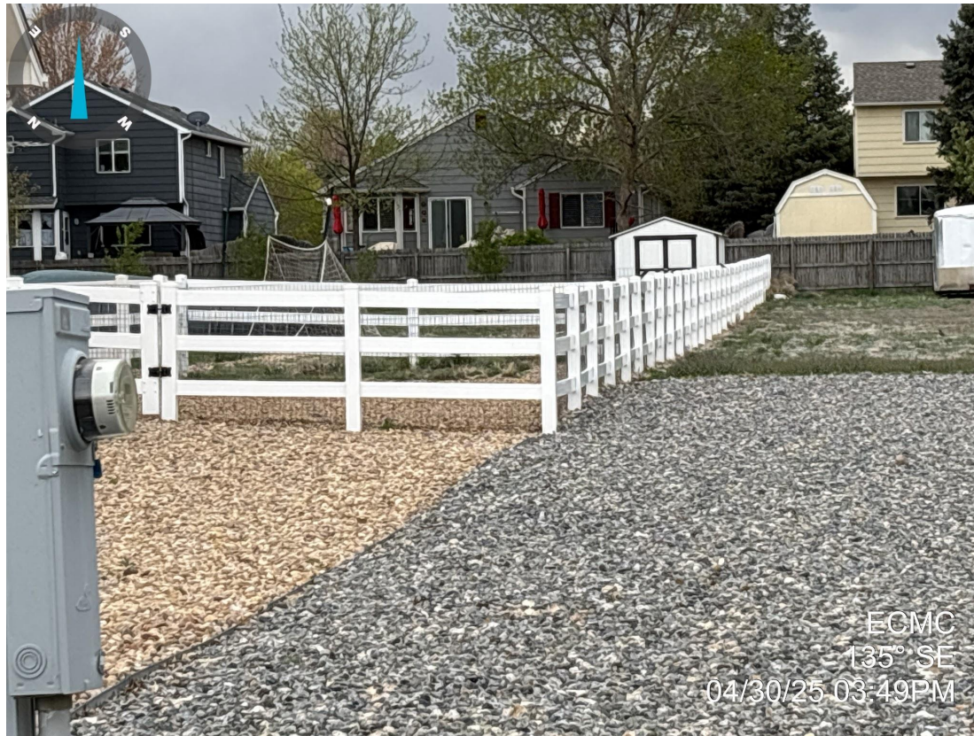
Photo 3. Photo taken of the well location, facing Southeast. Photo illustrates that the site is contained within a land use change to a residential area.