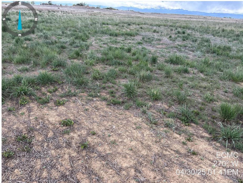
Photo 4. Photo taken from the well location, facing West. See comments under Photo 1.