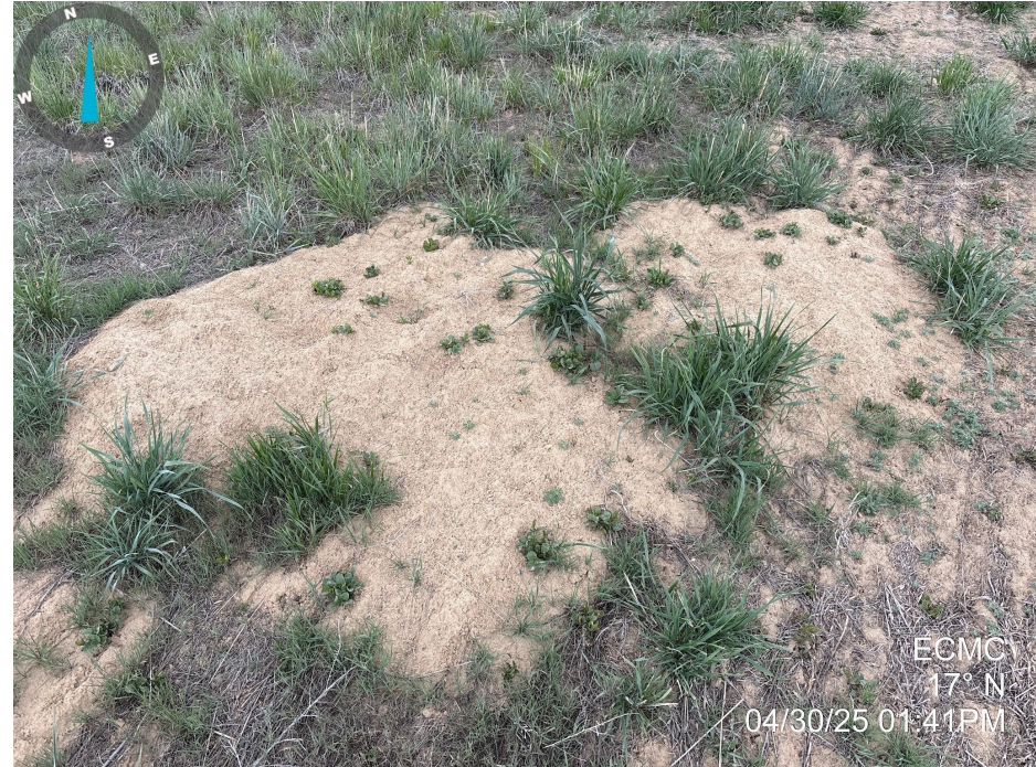
Photo 6. Photo taken of the well location. Photo illustrates some bare soil piles were observed at the location.