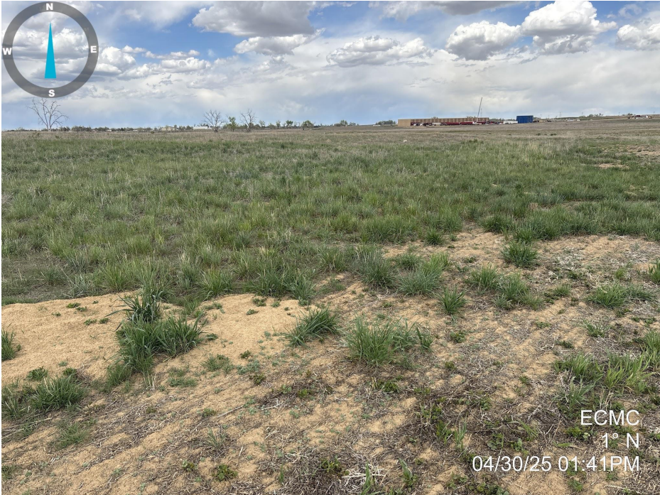
Photo 1. Photo taken from the well location, facing North. Photo illustrates that final reclamation activities have taken place, but vegetation establishment does not meet final reclamation standards.