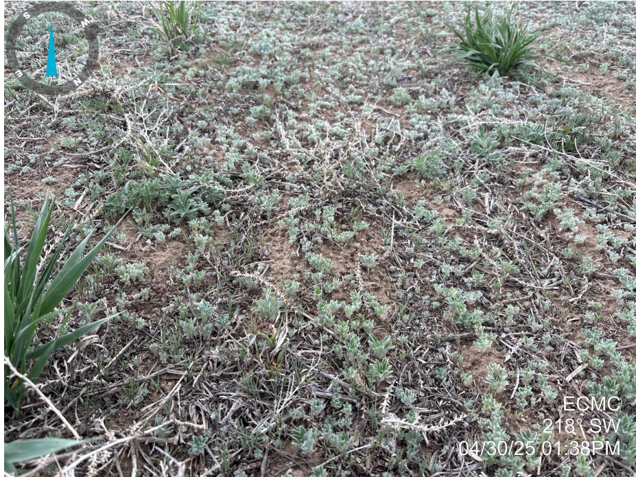
Photo 5. Photo taken of the well location. Photo illustrates weedy growth, dominated by kochia ( Bassia scoparia ) and russian thistle ( Salsola tragus ).