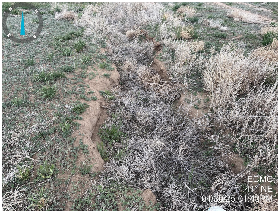
Photo 8. Photo taken of erosion north of the access road, directly east of the well site. A small gully, approximately one foot across and 8 feet in length has formed.