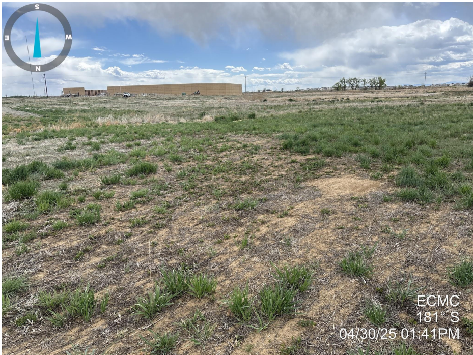
Photo 3. Photo taken from the well location, facing South. See comments under Photo 1.