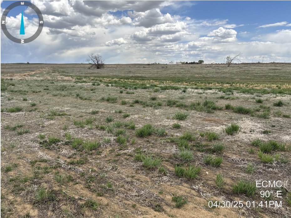
Photo 2. Photo taken from the well location, facing East. See comments under Photo 1.