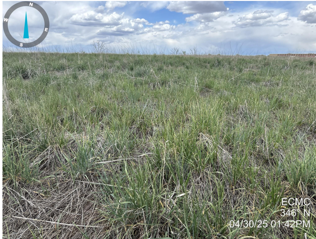
Photo 9. Photo taken of the reference area, north of the location, facing North. Photo illustrates perennial grass vegetation.