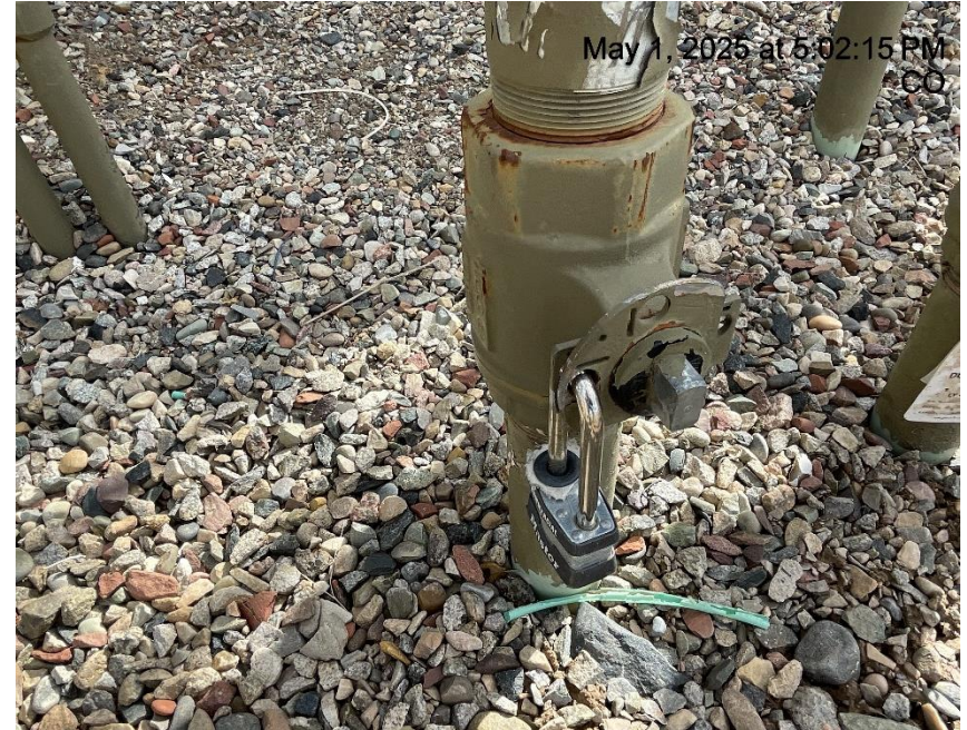
Photo # 8523 Unused flowline at separators does comply with general safety rules or lockout tagout rules (OOSLAT)