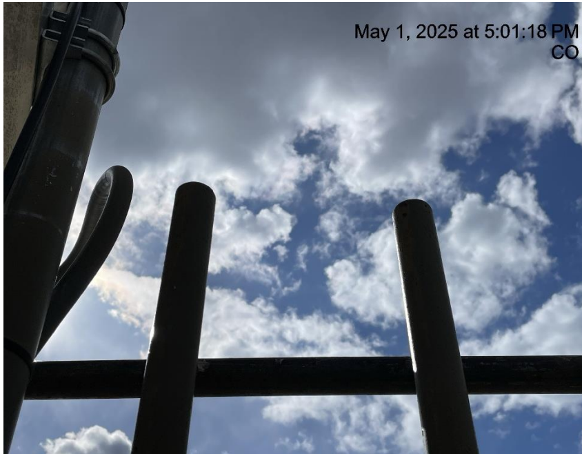
Photo # 8518 PRV & Rupture disc vent lines do not comply with CECMC pressure safety device rules