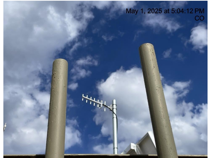
Photo # 8519 PRV & Rupture disc vent lines do not comply with CECMC pressure safety device rules