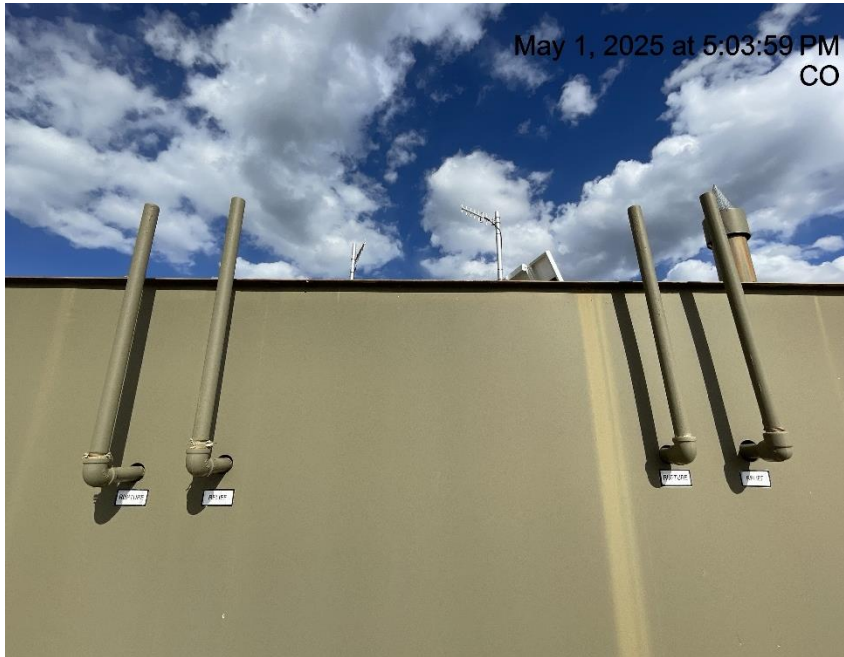
Photo # 8516 PRV & Rupture disc vent lines do not comply with CECMC pressure safety device rules