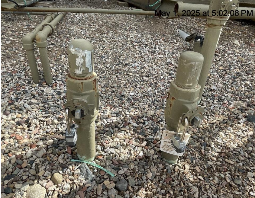
Photo # 8522 Unused flowlines at separators do not comply with general safety rules or lockout tagout rules (OOSLAT)