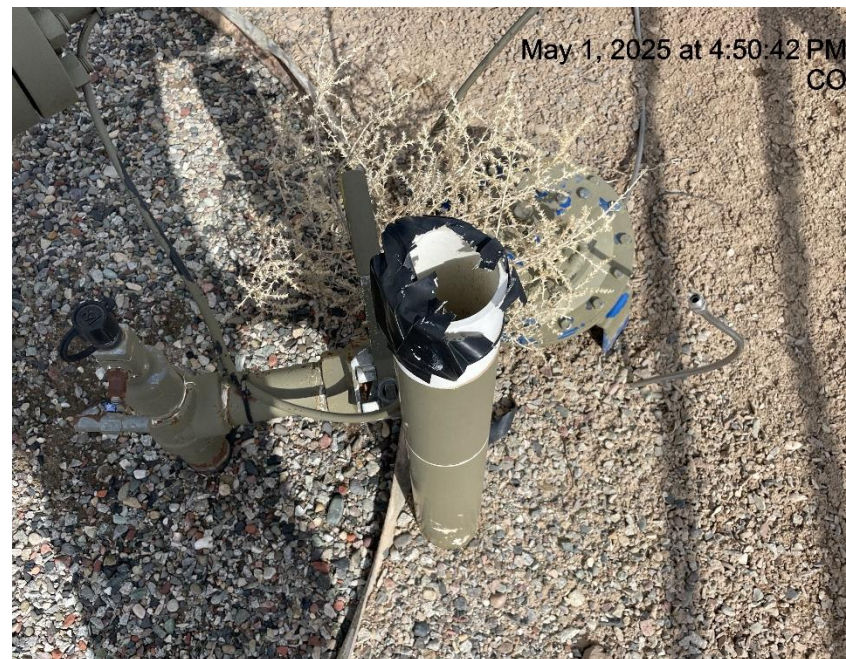
Photo # 8515 Open ended plastic piping/wildlife hazard /available for entry by wildlife