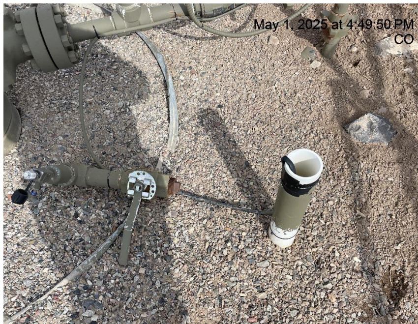
Photo # 8514 Open ended plastic piping/wildlife hazard /available for entry by wildlife