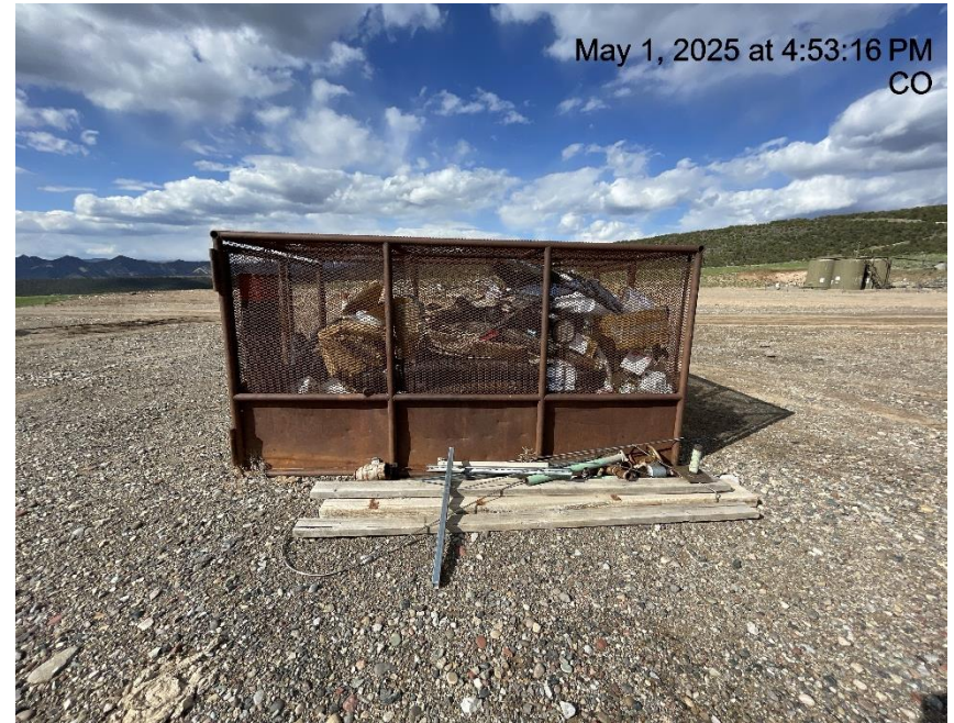
Photo # 8525 Debris laying on the ground near bear proof trash container