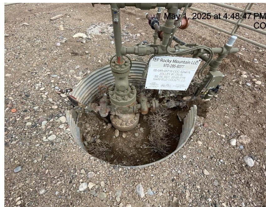
Photo # 8513 Wellhead cellar lacks wildlife egress - JOLLEY #1 (20-6)