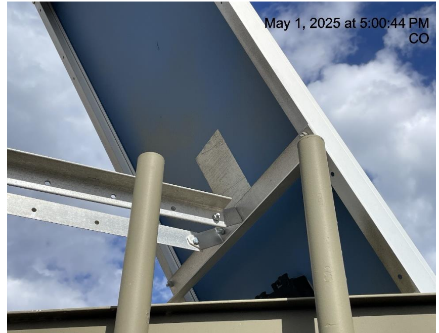
Photo # 8521 PRV & Rupture disc vent lines do not comply with CECMC pressure safety device rules