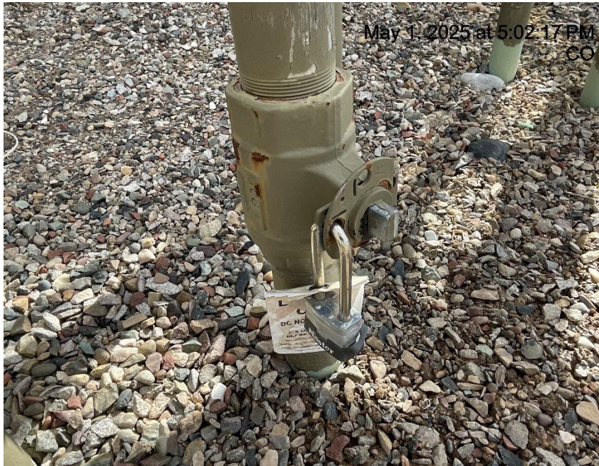
Photo # 8524 Unused flowline at separators does comply with general safety rules or lockout tagout rules (OOSLAT)