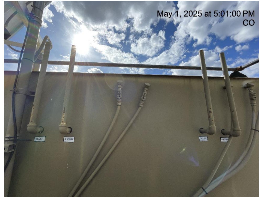
Photo # 8517 PRV & Rupture disc vent lines do not comply with CECMC pressure safety device rules