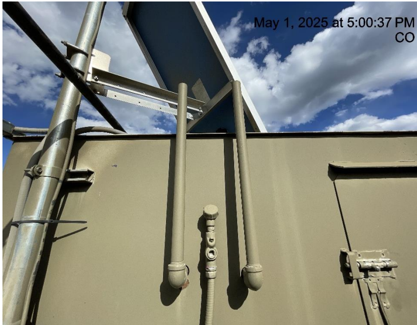
Photo # 8520 PRV & Rupture disc vent lines do not comply with CECMC pressure safety device rules