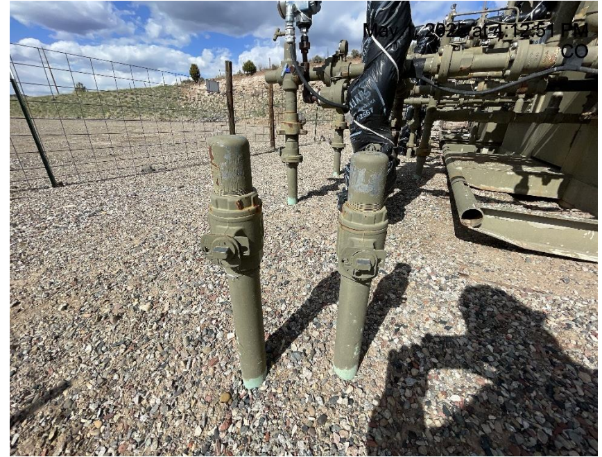
Photo # 8369 Unused flowlines at separators lack lockout tagout (OOSLAT)