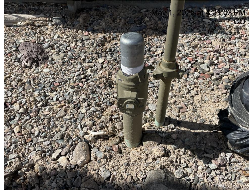
Photo # 8371 Unused flowline at tank battery lacks lockout tagout (OOSLAT)