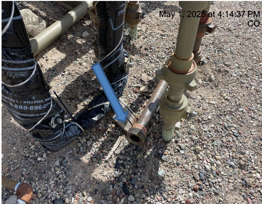
Photo # 8376 Open ended piping/wildlife hazard/available for entry by wildlife