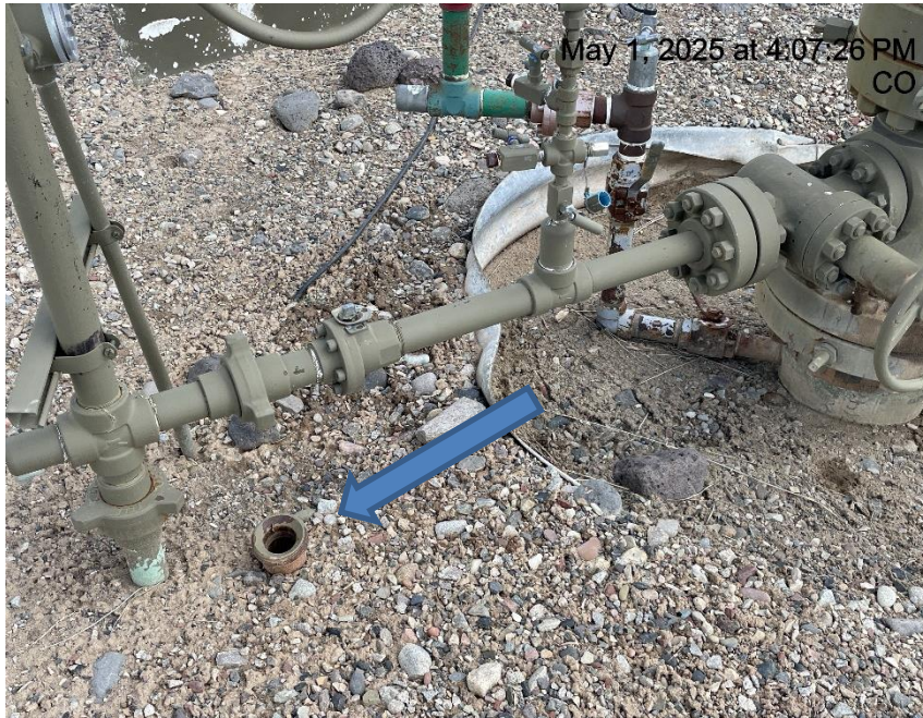
Photo # 8372 Unused flowline at wellhead lacks lockout tagout (OOSLAT) (Additionally the flowline is open ended & constitutes a wildlife hazard - JOLLEY 31A)