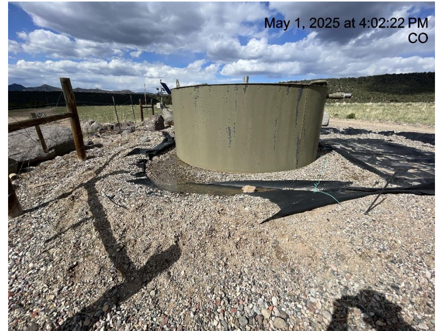
Photo # 8379 Secondary containment insufficient/does not comply with CECMC rules