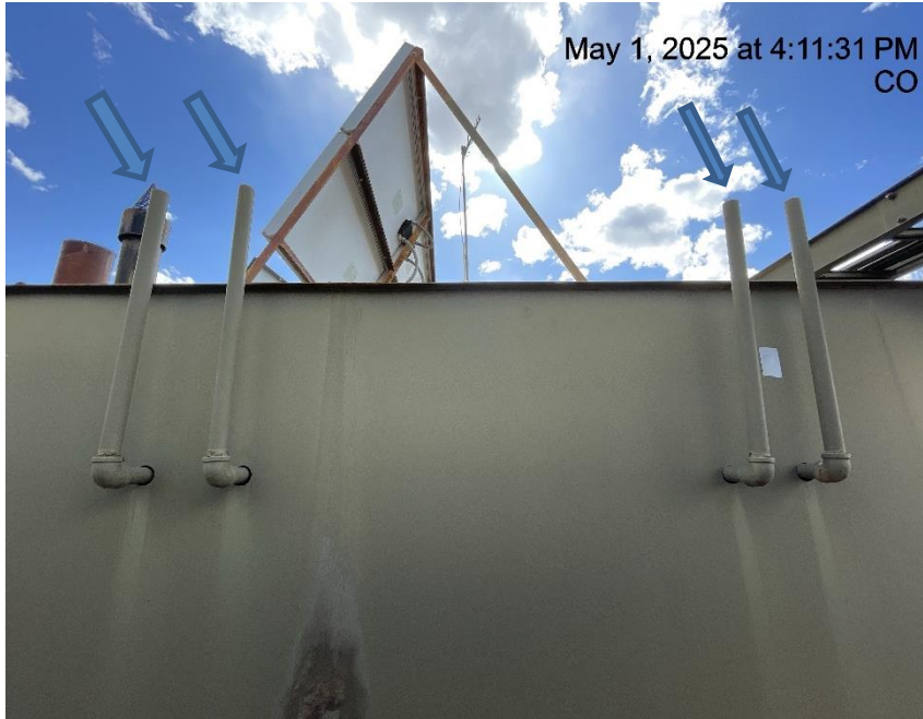
Photo # 8374 PRV & Rupture disc vent lines do not comply with CECMC pressure safety device rules