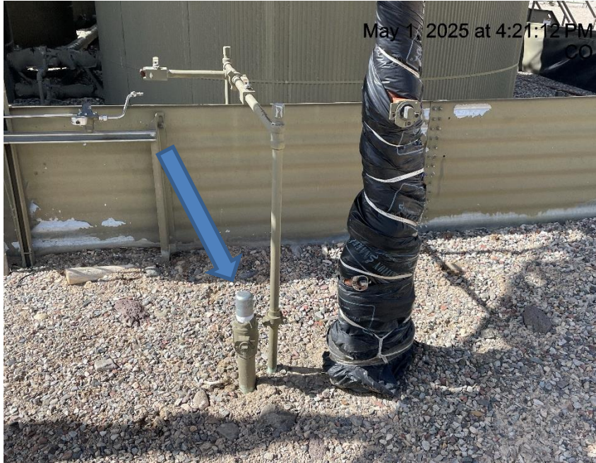
Photo # 8370 Unused flowline at tank battery lacks lockout tagout (OOSLAT)