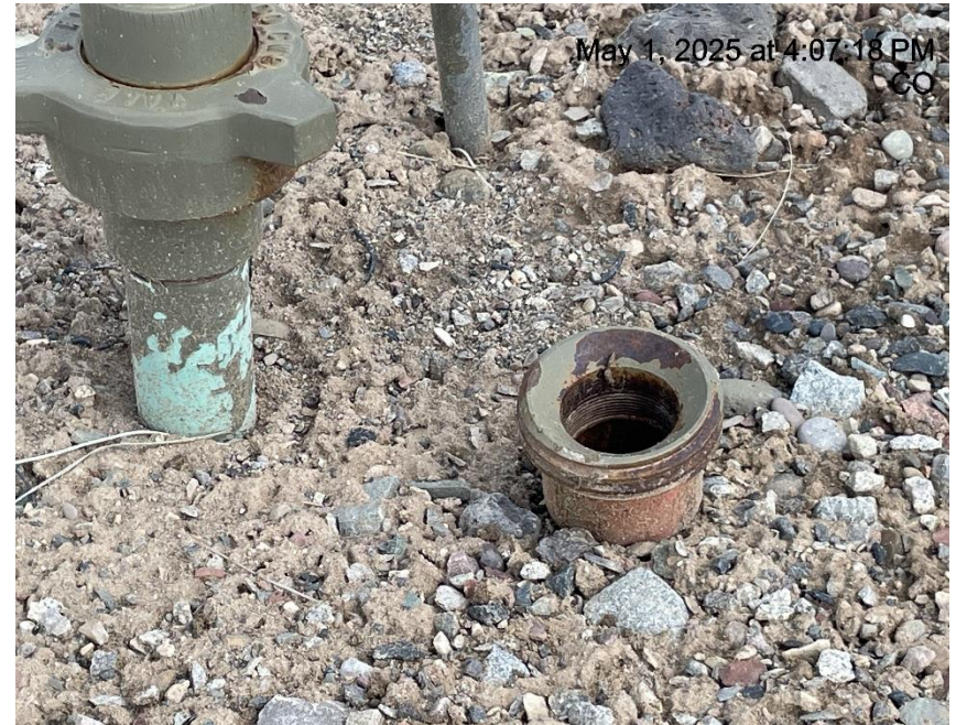
Photo # 8373 Unused flowline at wellhead lacks lockout tagout (OOSLAT) (Additionally the flowline is open ended & constitutes a wildlife hazard - JOLLEY 31A)