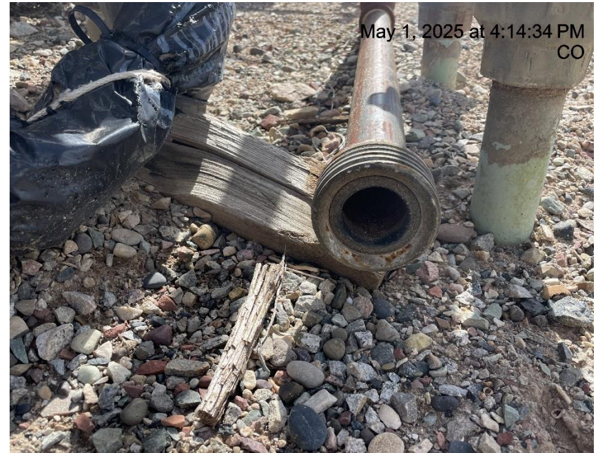
Photo # 8377 Open ended piping/wildlife hazard/available for entry by wildlife