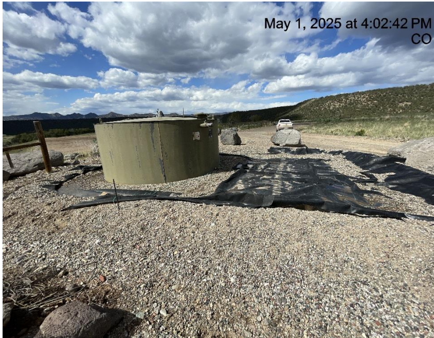
Photo # 8378 Secondary containment insufficient/does not comply with CECMC rules