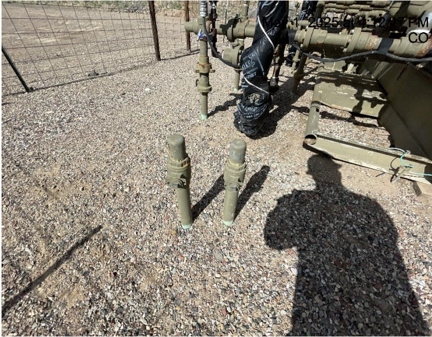
Photo # 8368 Unused flowlines at separators lack lockout tagout (OOSLAT)