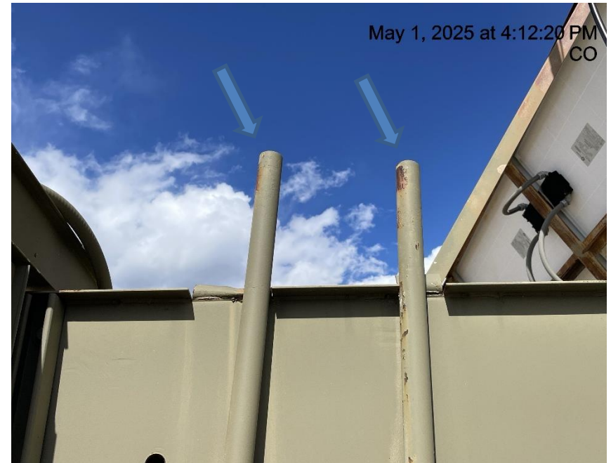
Photo # 8375 PRV & Rupture disc vent lines do not comply with CECMC pressure safety device rules