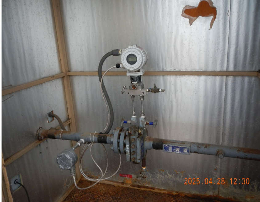
3. Gas Meter inside meter shed.