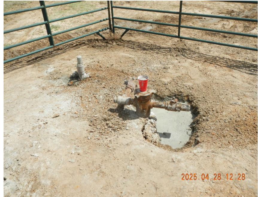
2. View of P&A'd wellhead.