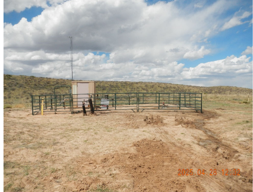
4. Well location overview.