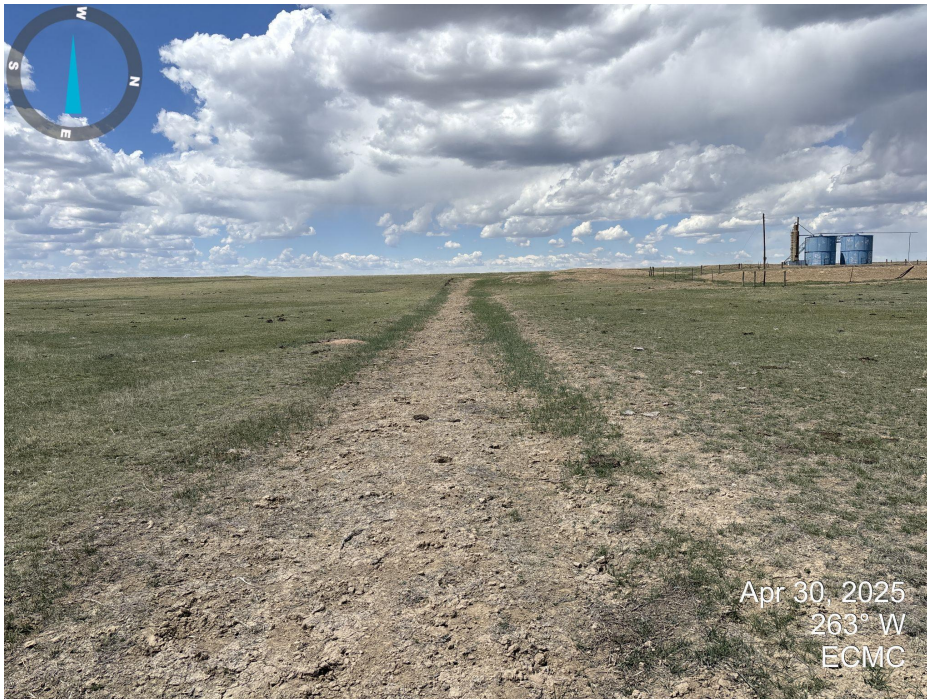
Photo 1. Looking west down access road to tank battery.