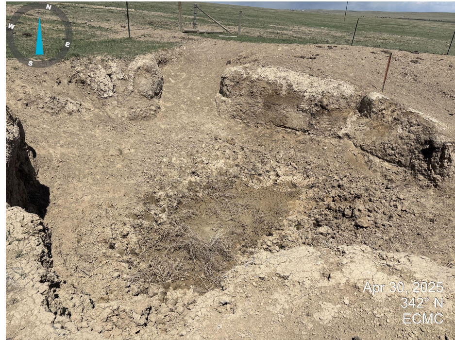
Photo 9. Looking north across skim pit on the west side of the pond.