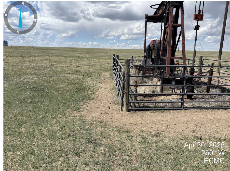
Photo 13. Looking west across the well location. Location size has been reduced and desirable perennial vegetation has established around the location. Undesirable weeds such as Kochia are present inside the fence.