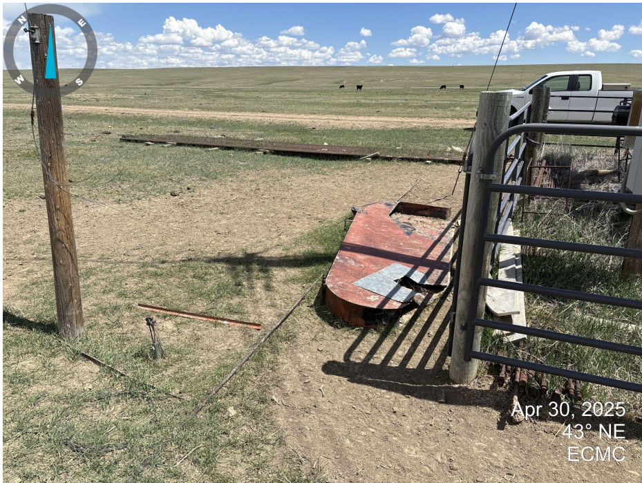
Photo 14. Looking east down the north side of the well location. Debris and unused equipment is present (belt cover, posts, barbed wire, sucker rod, pipe)