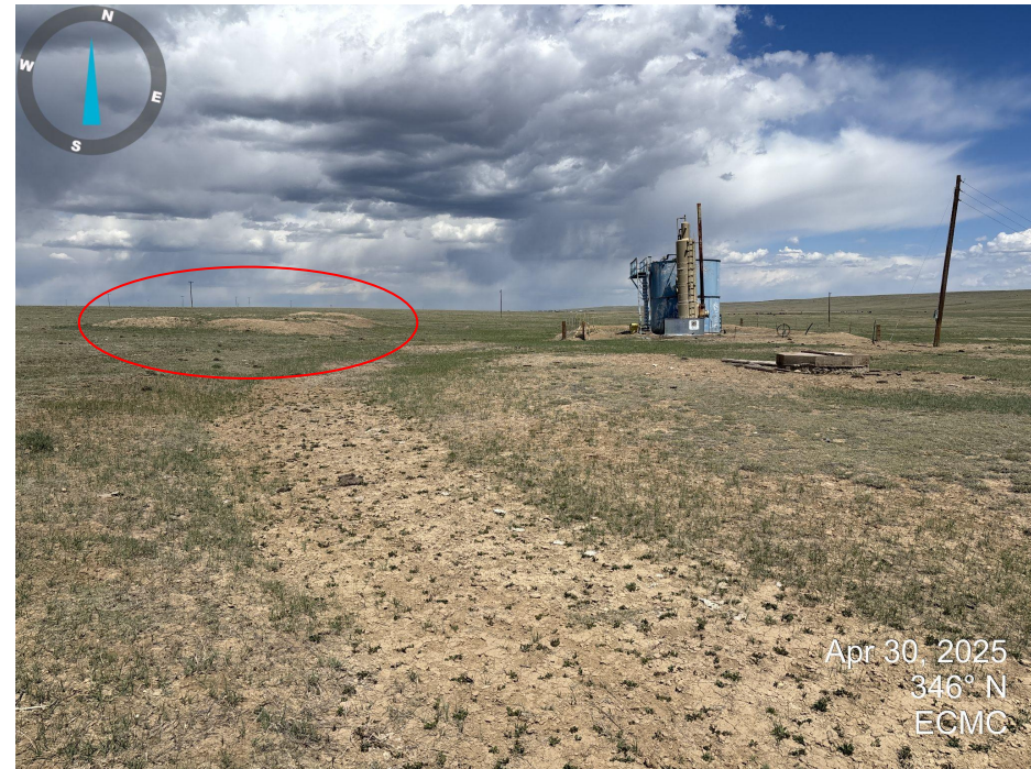
Photo 2. Looking North across the tank battery location. Soil pile on west side of location (red circle). Soil pile has some vegetation growing on it but is largely bare soil.