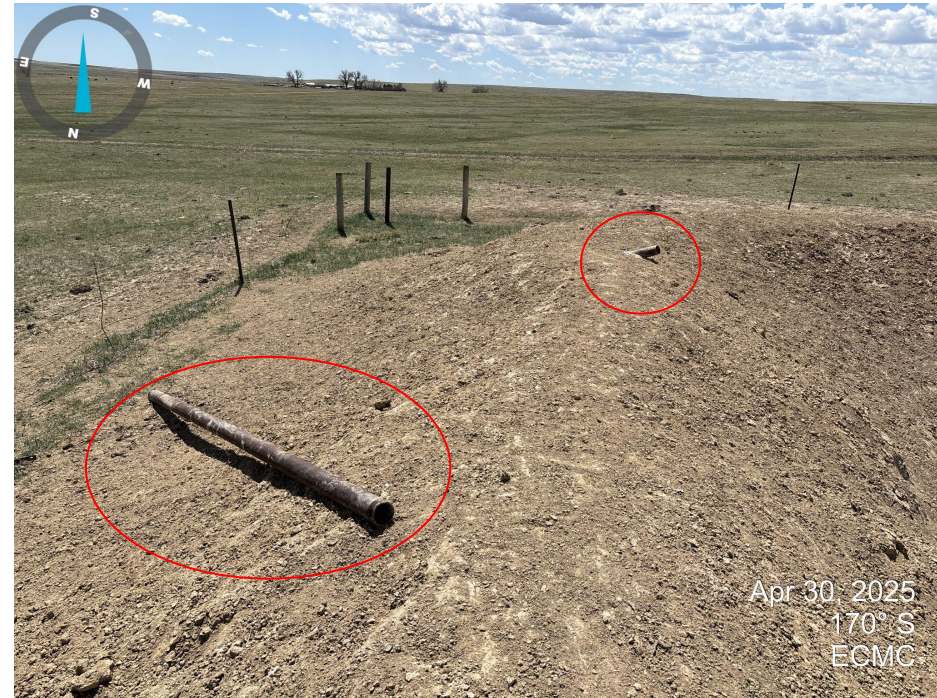
Photo 11. Picture taken on the east side of the evaporation pond looking south. Pipe remains in and around the berm (red circles).