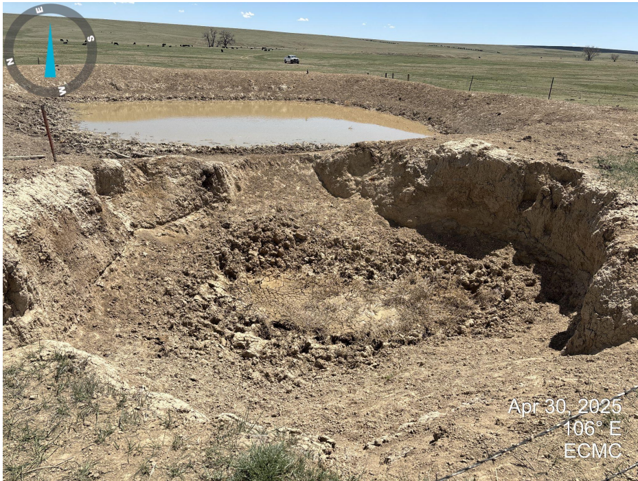
Photo 8. Skim pit on the west side of pond. Cattle prints are present in the mud at bottom.