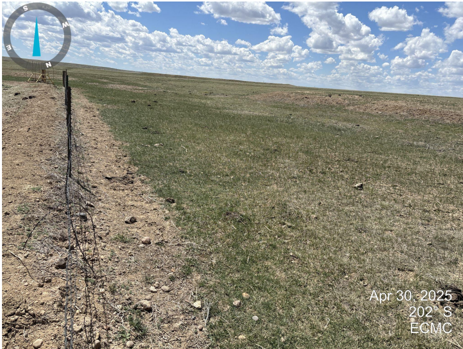
Photo 5. Looking south down the west side of the tank battery. The interim area outside of the tank battery appears to be desirable perennial vegetation.