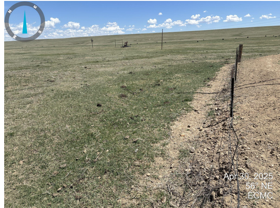
Photo 6. Looking east down the north side of the tank battery. see photo 5 comments.