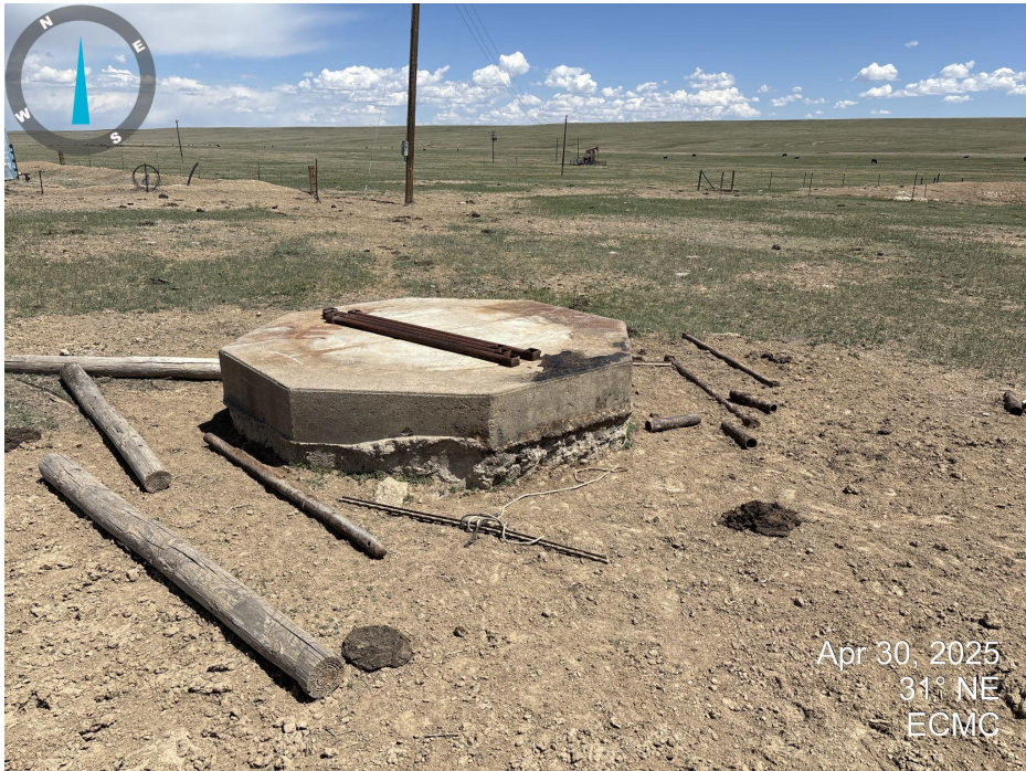
Photo 3. Former separator base to the south of the tank battery. Debris is present around base.