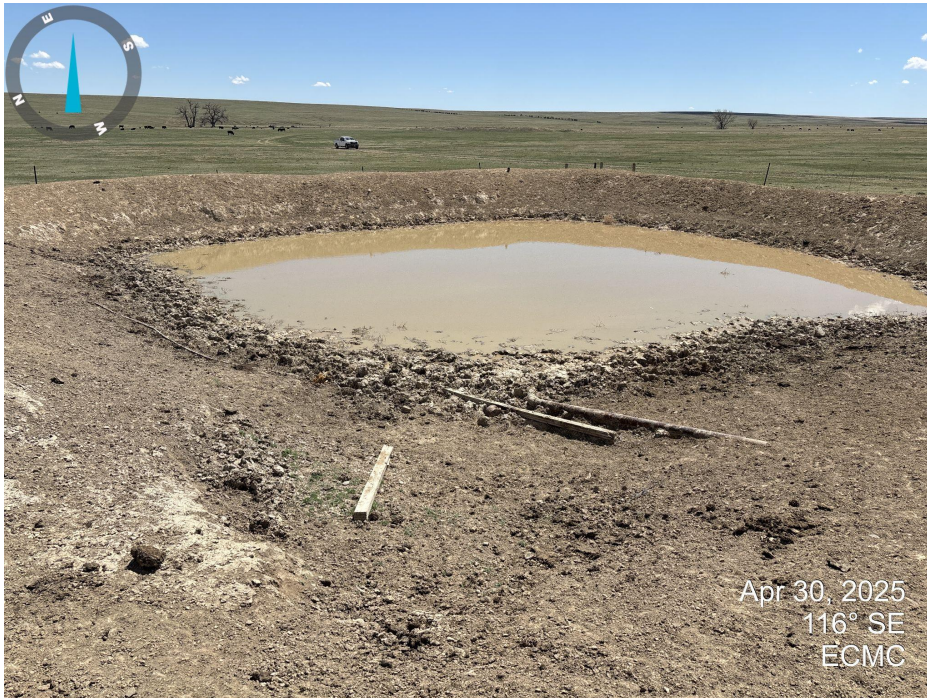
Photo 10. Looking east across the evaporation pond. Debris remains in the pond. Standing water is present in the pond at the time of inspection. Cattle tracks are present at the water's edge.