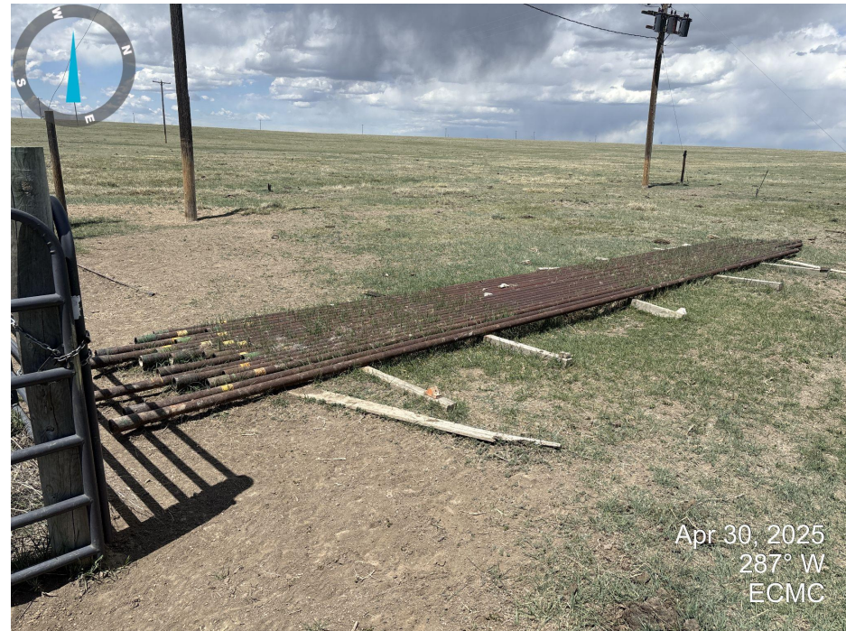
Photo 15. Pipe stored on the north side of location.