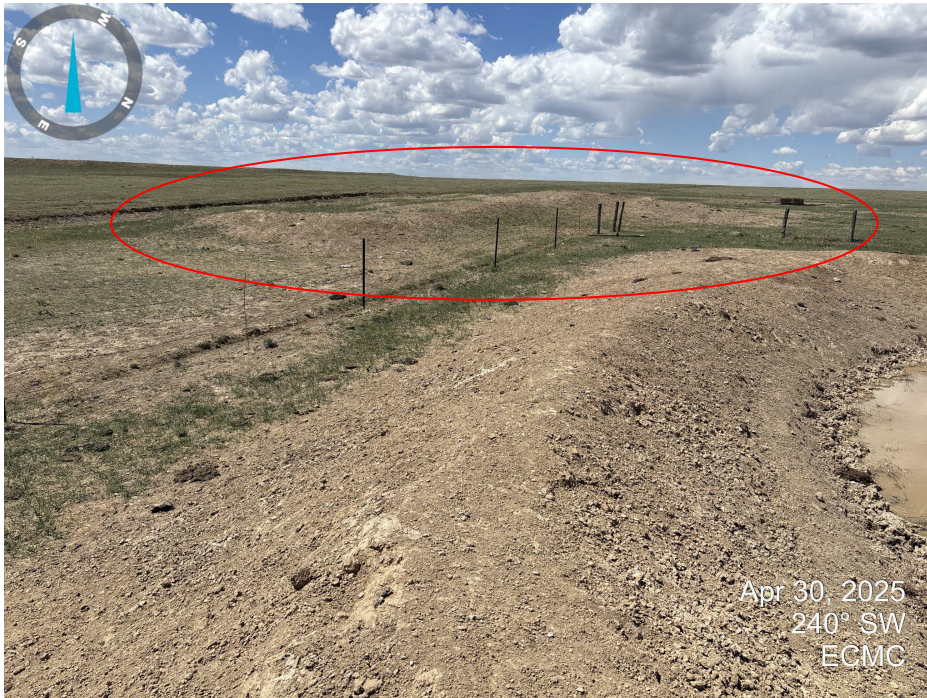
Photo 12. Looking west along the southern edge of the evaporation pond. Soil pile is present on the south side of tank battery (red circle). Soil pile is primarily bare soil with little vegetation coverage.