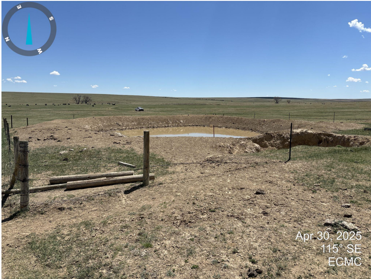
Photo 7. Looking east across the skim pit located to the east of the tank battery. The barbed wire fence around the pit is down and livestock appears to be entering the pit and drinking from standing water in the pit/ evaporation pond.