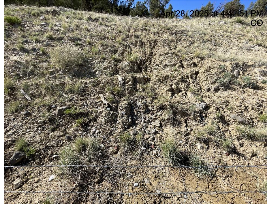
Photo # 7023 Erosion & transport of sediment on cutslope /sediment migrating onto location/insufficient BMP's