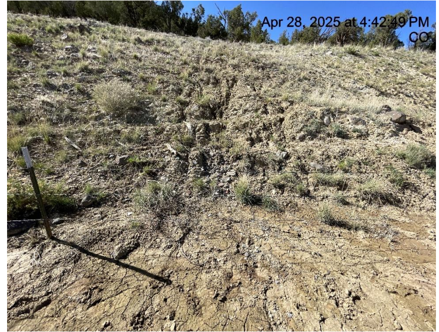
Photo # 7021 Erosion & transport of sediment on cutslope /sediment migrating onto location/insufficient BMP's