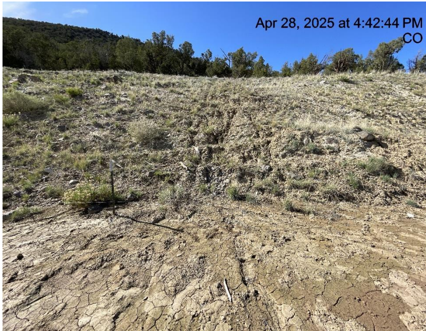
Photo # 7019 Erosion & transport of sediment on cutslope /sediment migrating onto location/insufficient BMP's