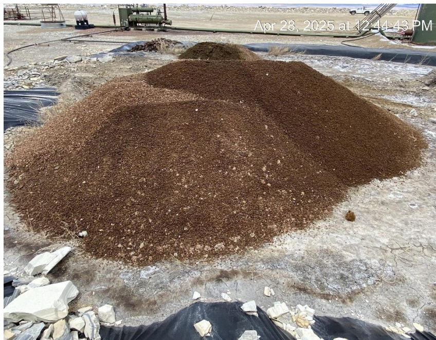
Oil contaminated material from tank battery in drilling pit