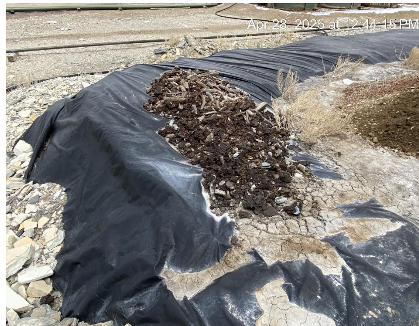
Oily waste material in drilling pit from previous inspections