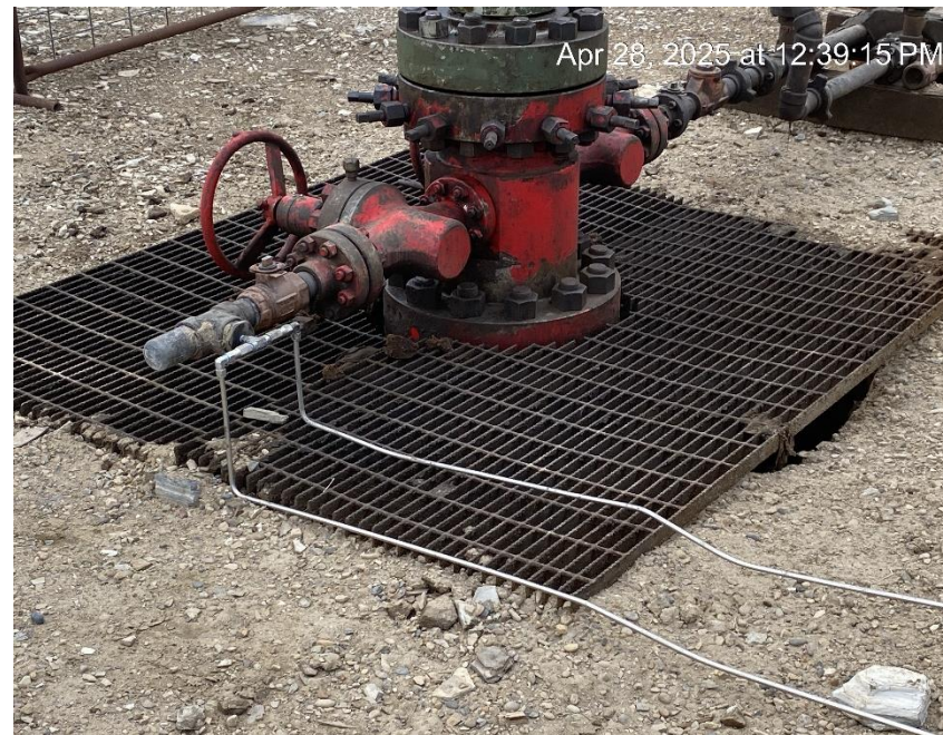
No Bradenhead access