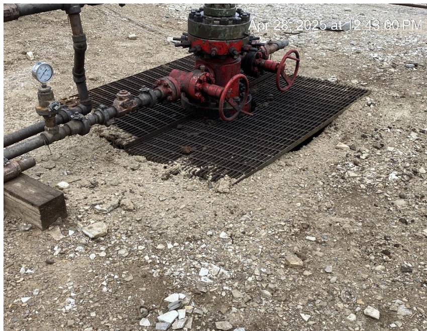
New soil over stained soil