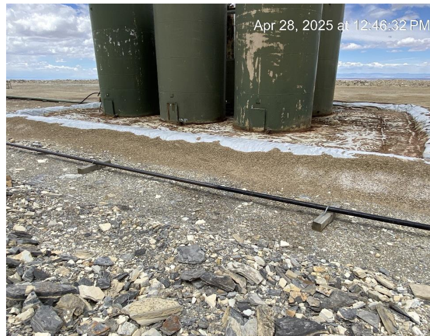
Oil contaminated material removed from tank battery