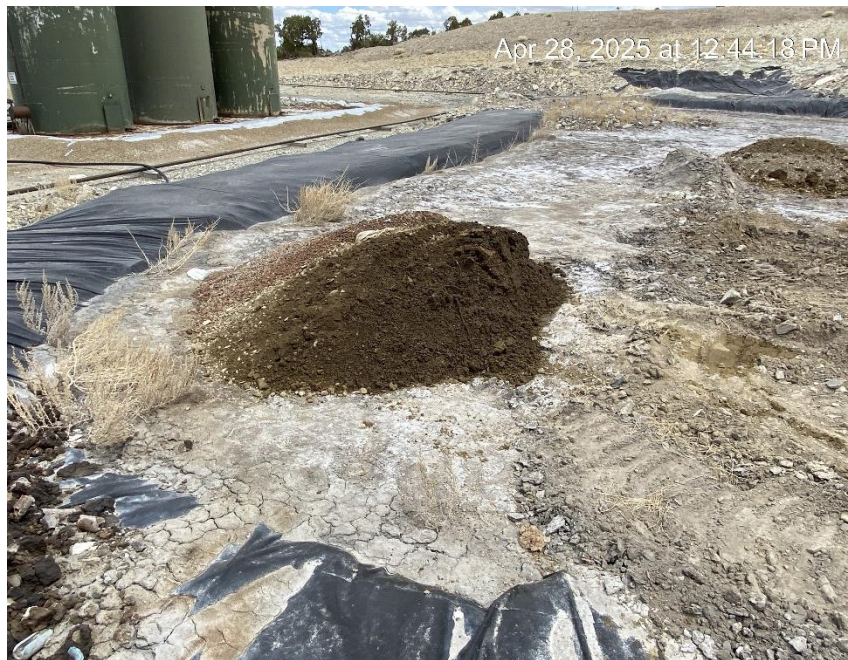
Oil contaminated material from tank battery in drilling pit