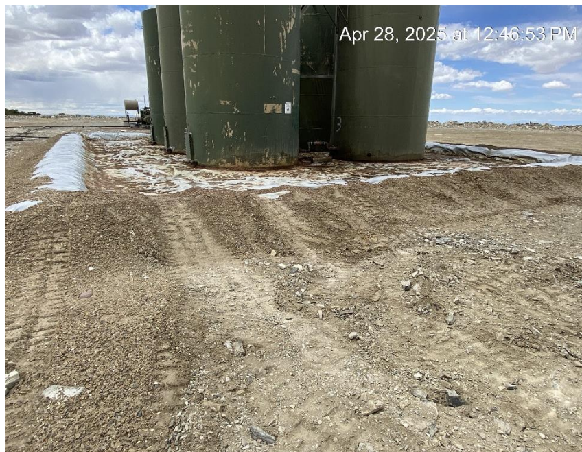
Oil contaminated material removed from tank battery