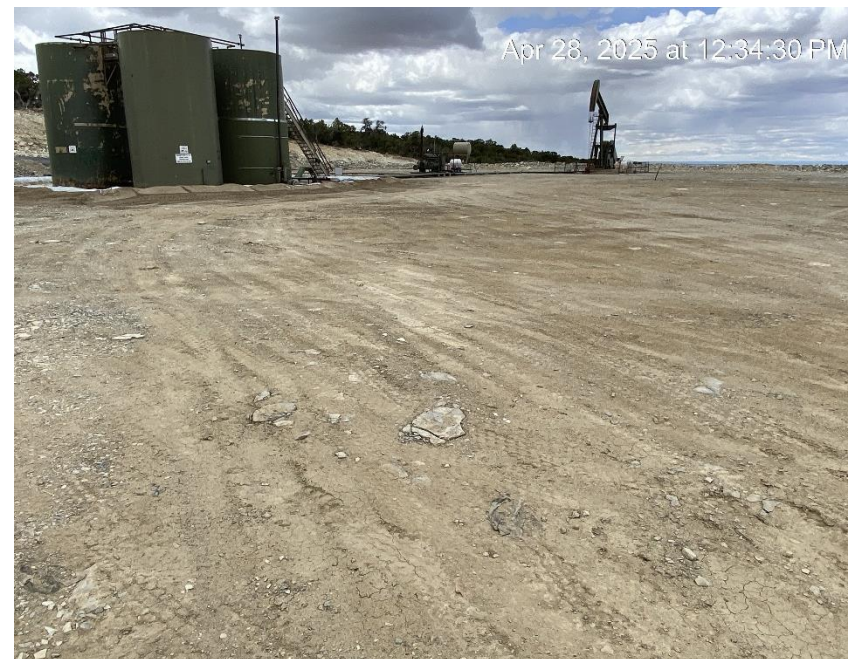
Location from Northeast entrance