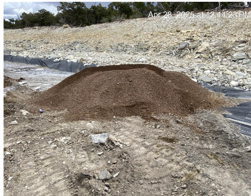
Oil contaminated material from tank battery in drilling pit