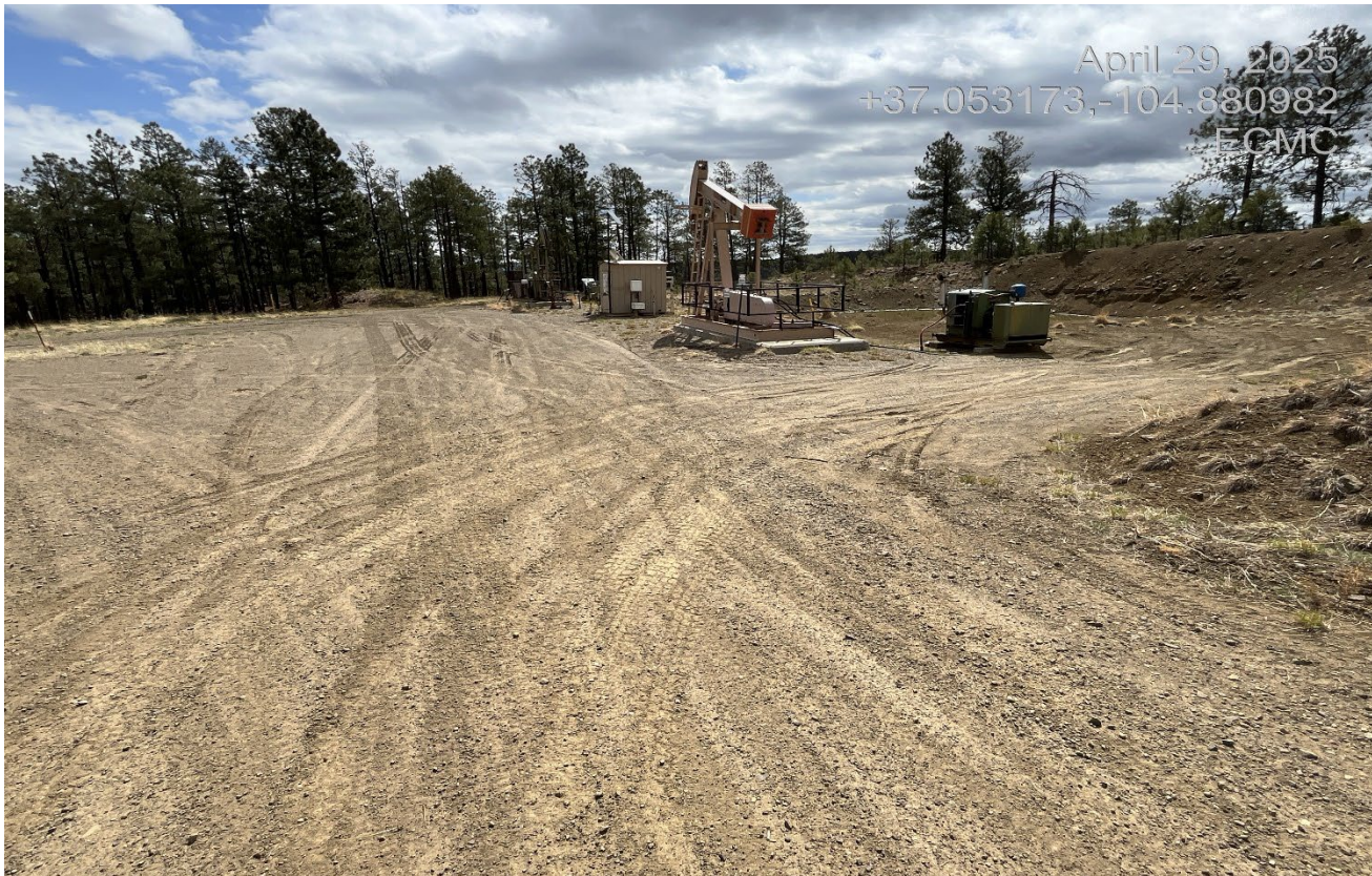
Photo 1. Facing east toward the wellsite.