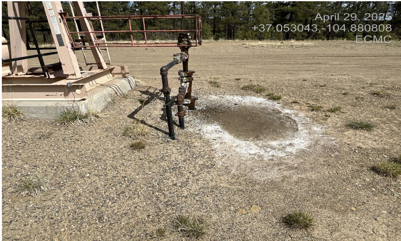
Photo 3. There is a dripping water leak at the wellhead. Stained soils need to be cleaned up.