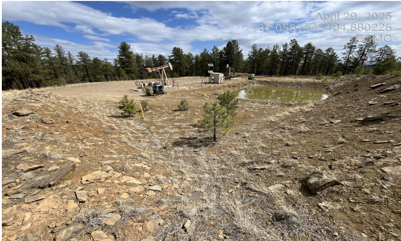
Photo 4. Facing northeast overlooking the location.