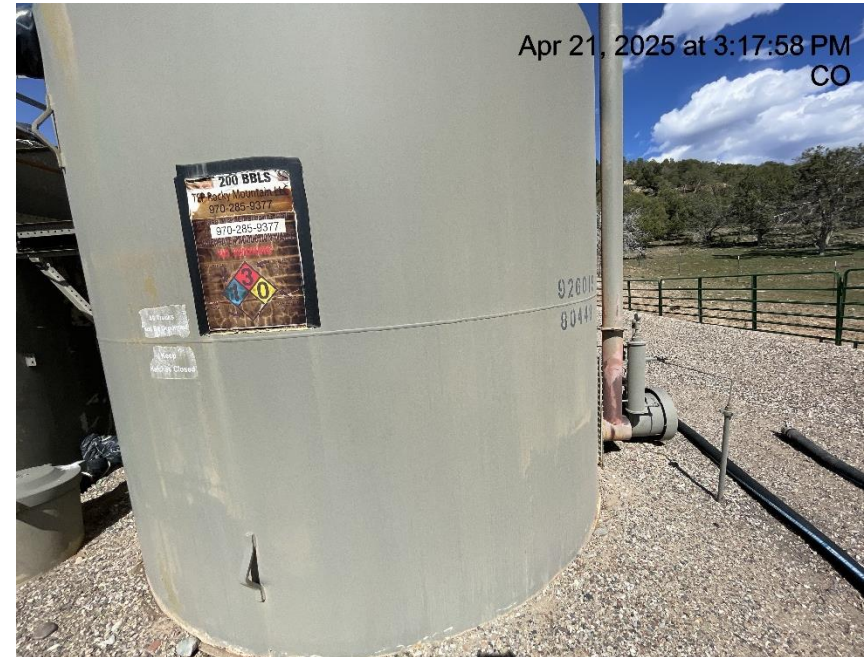
Photo # 4749 Tank label weathered & some required information is illegible/not in compliance with CECMC rules