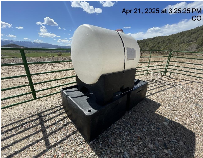
Photo # 4746 Chemical tank disconnected & not in use/ unused equipment