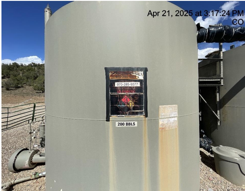
Photo # 4748 Tank label weathered & some required information is illegible/not in compliance with CECMC rules