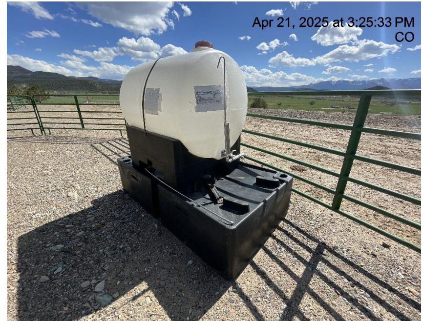
Photo # 4747 Chemical tank disconnected & not in use/ unused equipment