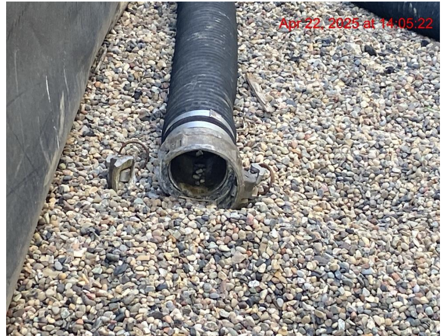
Stored Supplies/Wildlife Entry Hazard – Photo #08340