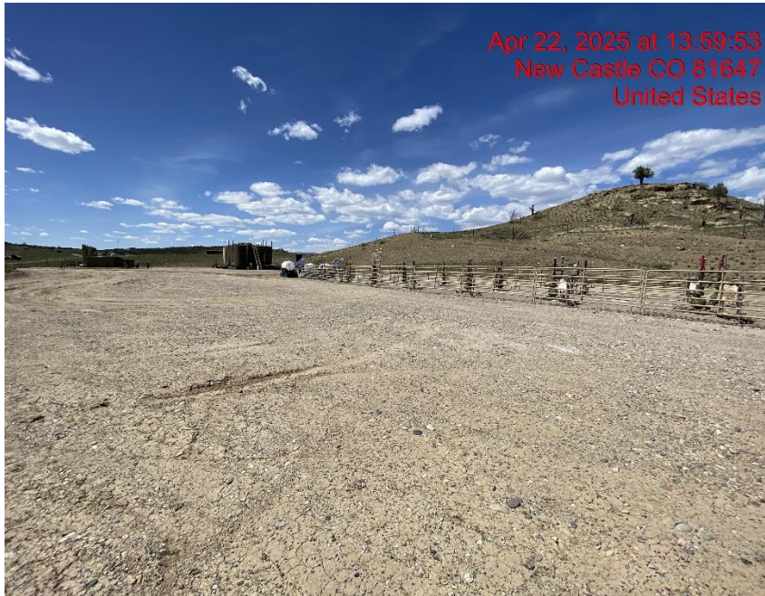
Location Overview – Photo #08322