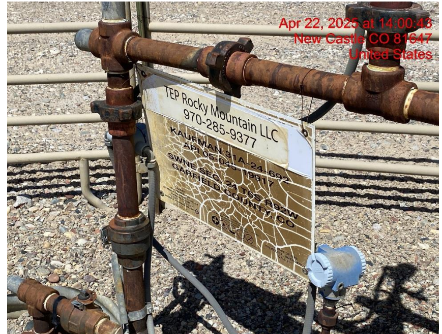
Illegible Wellhead Sign – Photo #08323