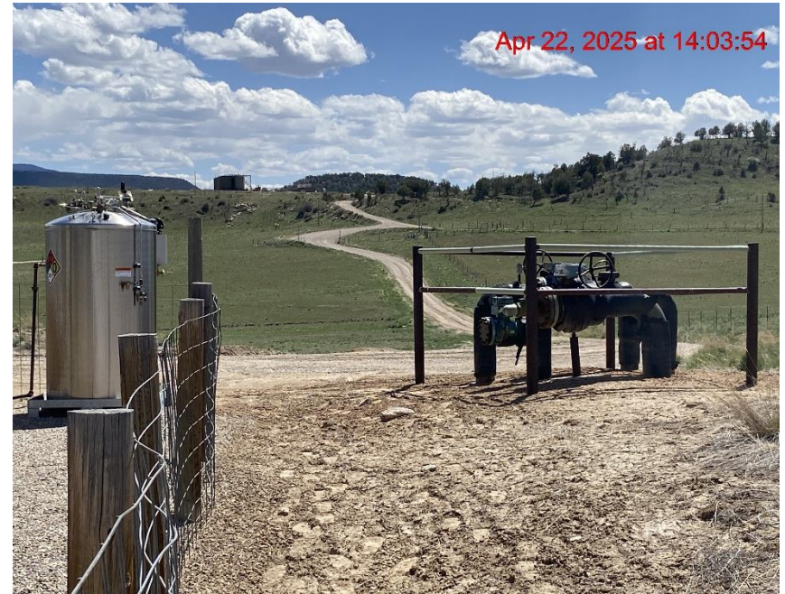
Location – Photo #08333