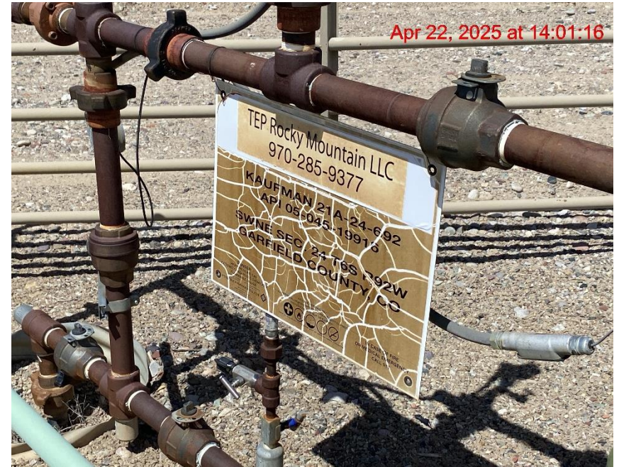
Illegible Wellhead Sign – Photo #08325