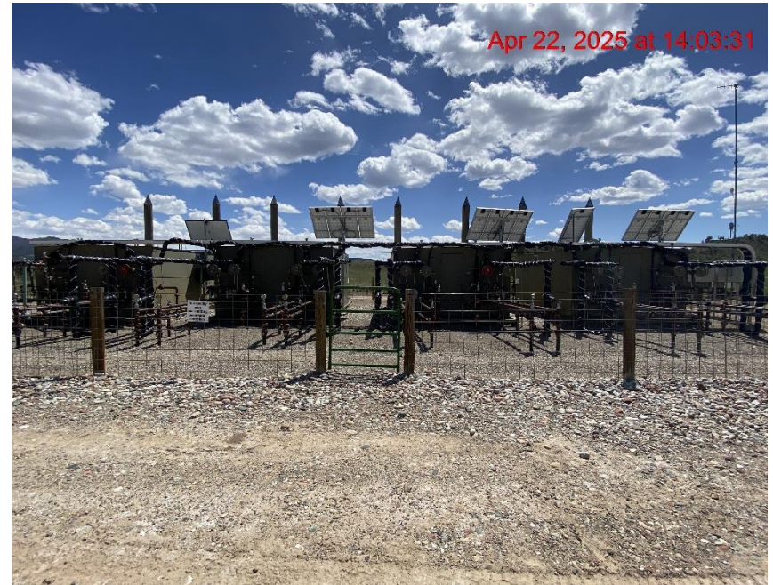
Location – Photo #08332