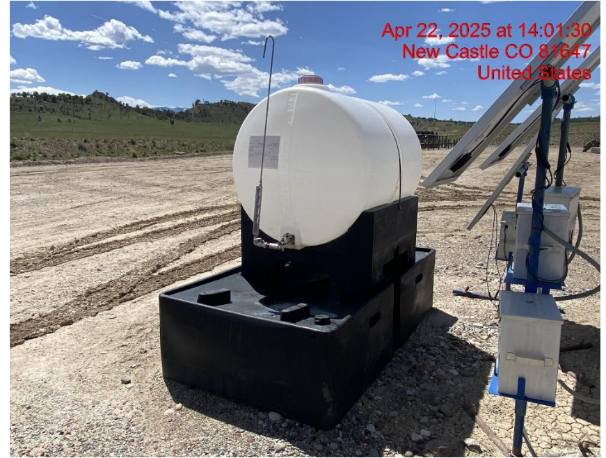
Stored Equipment – Photo #08328