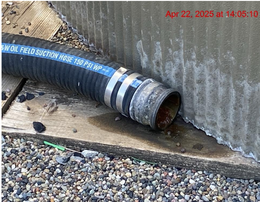
Stored Supplies/Wildlife Entry Hazard – Photo #08339