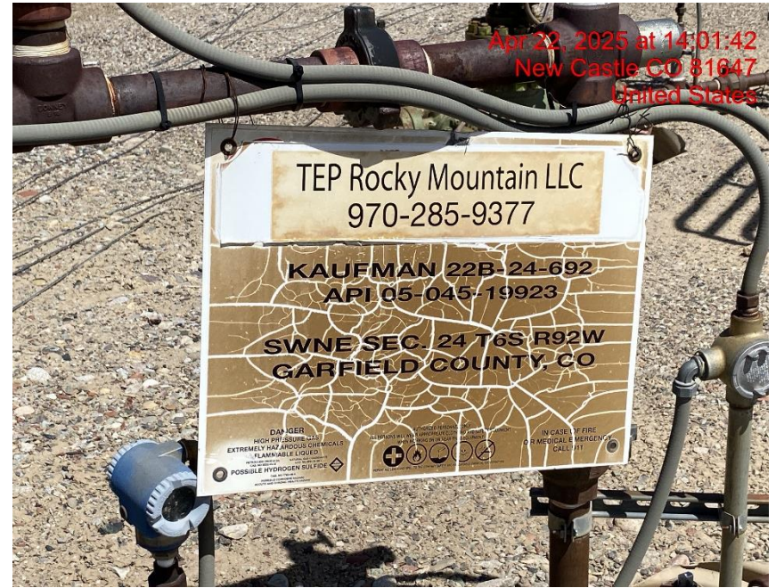
Illegible Wellhead Sign – Photo #08327