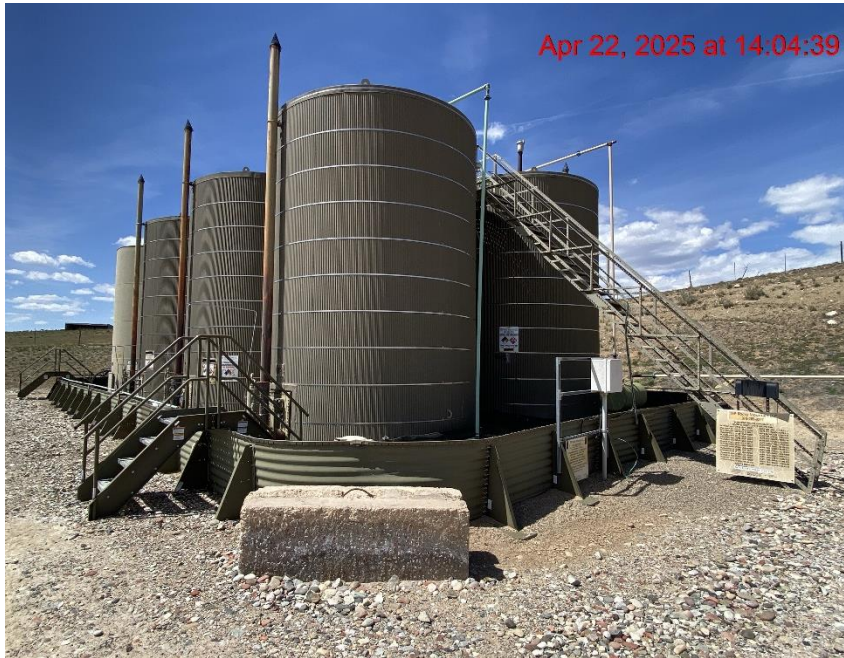
Location – Photo #08336