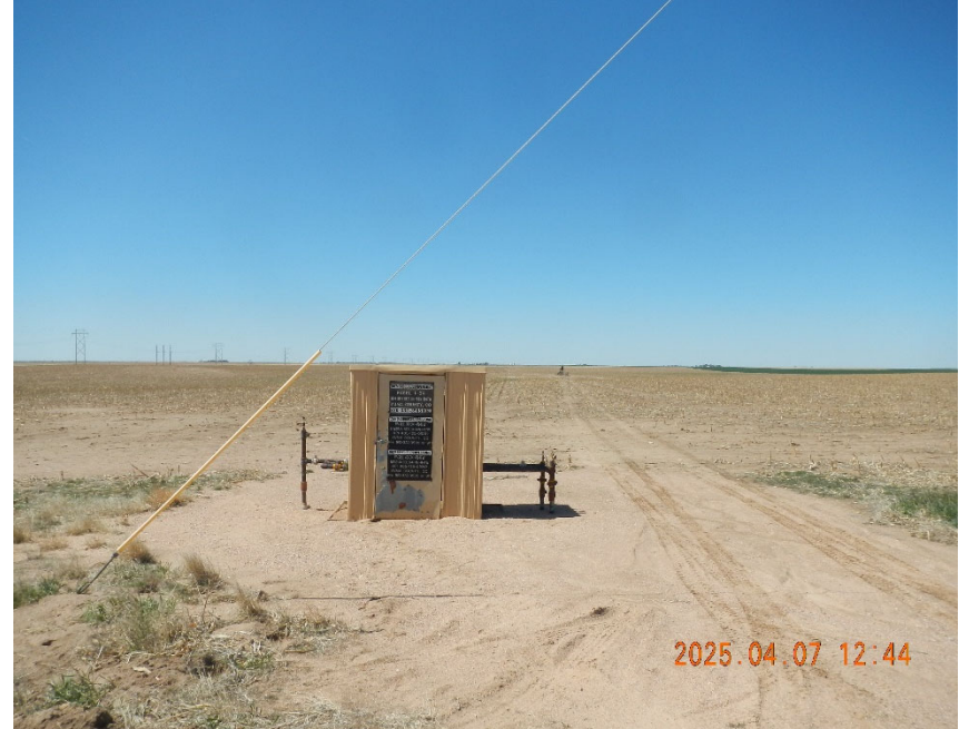
6. Gathering location overview.