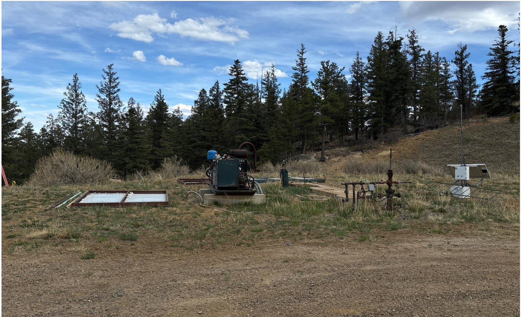
PHOTO 5: UNUSED EQUIPMENT STORED ON LOCATION (SOUND WALL PANELS & PROMOVER SKID). REMOVE UNUSED EQUIPMENT PER RULE 606. THIS IS SECOND NOTICE IMMEDIATE ACTION IS REQUIRED.