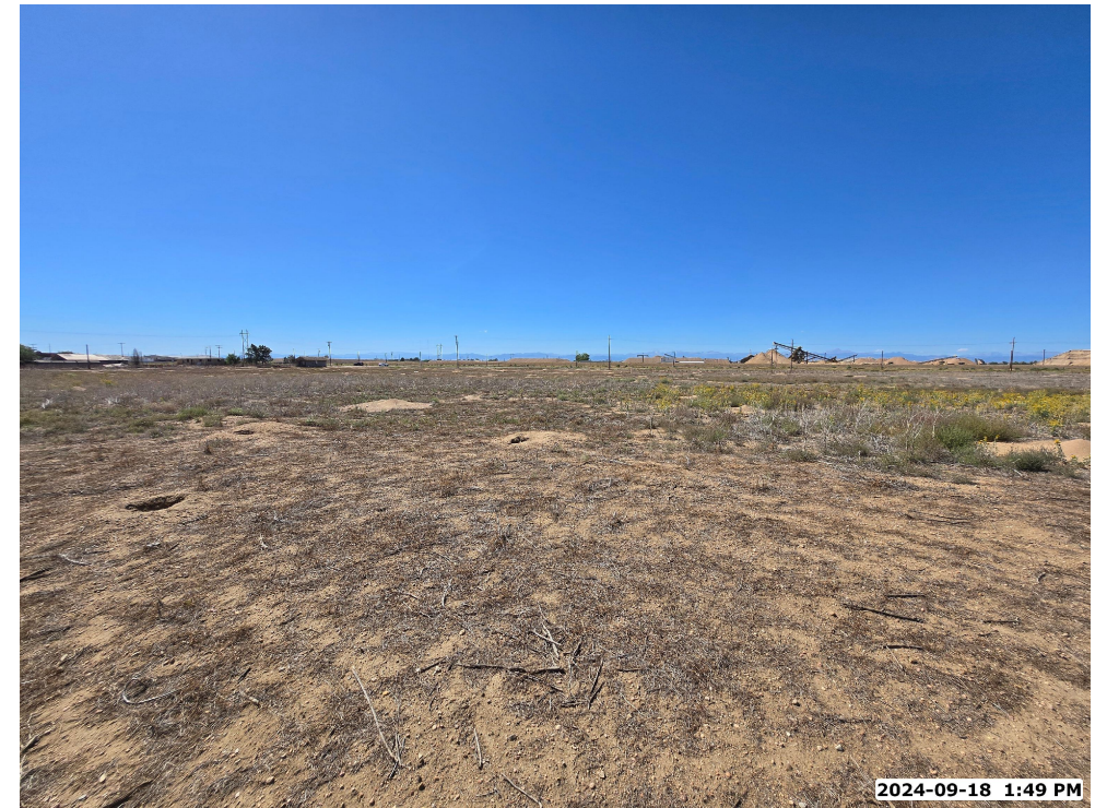
LOCATION PICTURE OF PARSNIP FED HZ WELL PAD - CAMERA VIEW WEST

K:\AMDRK\2023\174_PARSNIP_T1N_R66W_SEC_20.DWG\PARSNIP_T1N_R66W_SEC_20.dwg, 10/25/2024 5:55:51 PM, sunberg