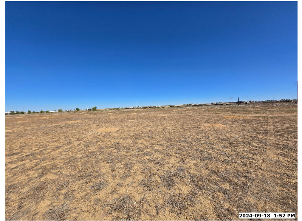
LOCATION PICTURE OF PARSNIP FED HZ WELL PAD - CAMERA VIEW EAST