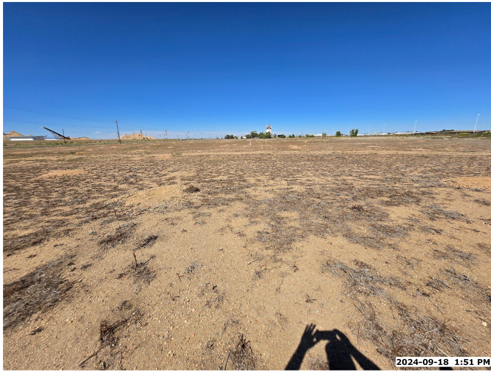
LOCATION PICTURE OF PARSNIP FED HZ WELL PAD - CAMERA VIEW NORTH

NW1/4 SW1/4 SECTION 20, TOWNSHIP 1 NORTH, RANGE 66 WEST, 6TH P.M., WELD COUNTY, COLORADO