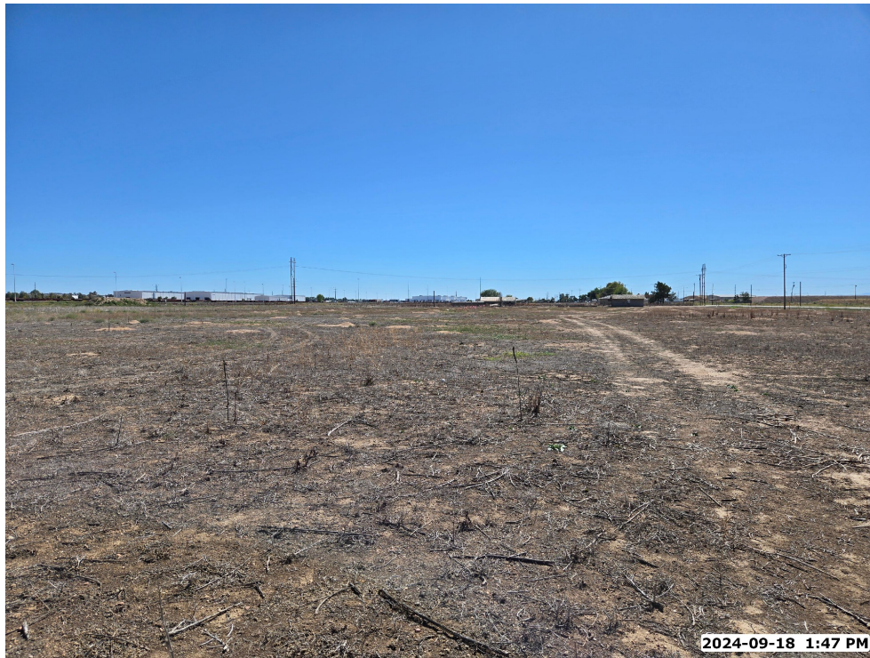
LOCATION PICTURE OF PARSNIP FED HZ WELL PAD - CAMERA VIEW SOUTH