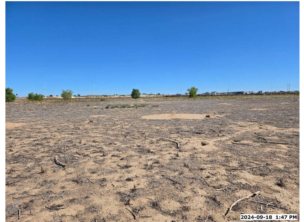
LOCATION PICTURE OF PARSNIP FED HZ FACILITY PAD - CAMERA VIEW EAST