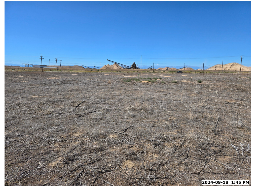
LOCATION PICTURE OF PARSNIP FED HZ FACILITY PAD - CAMERA VIEW WEST

K:\ANADARKO\2023_174_PARSNIP_T1N_R66W_SEC_20\DWG\PARSNIP_T1N_R66W_SEC_20.dwg, 10/25/2024 5:58:01 PM, sunberg