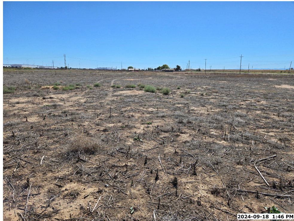
LOCATION PICTURE OF PARSNIP FED HZ FACILITY PAD - CAMERA VIEW SOUTH