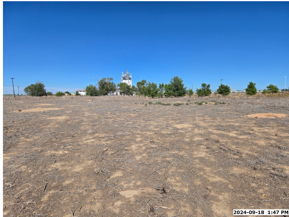
LOCATION PICTURE OF PARSNIP FED HZ FACILITY PAD - CAMERA VIEW NORTH

NW1/4 SW1/4 SECTION 20, TOWNSHIP 1 NORTH, RANGE 66 WEST, 6TH P.M., WELD COUNTY, COLORADO