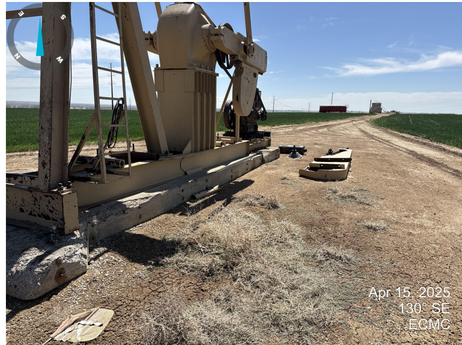
Photo 6. Looking at the west side of the location. Some undesirable weeds such as Kochia are present. Well is partially dismantled and equipment remains on location.