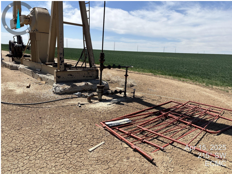
Photo 5. Looking south at the wellhead.