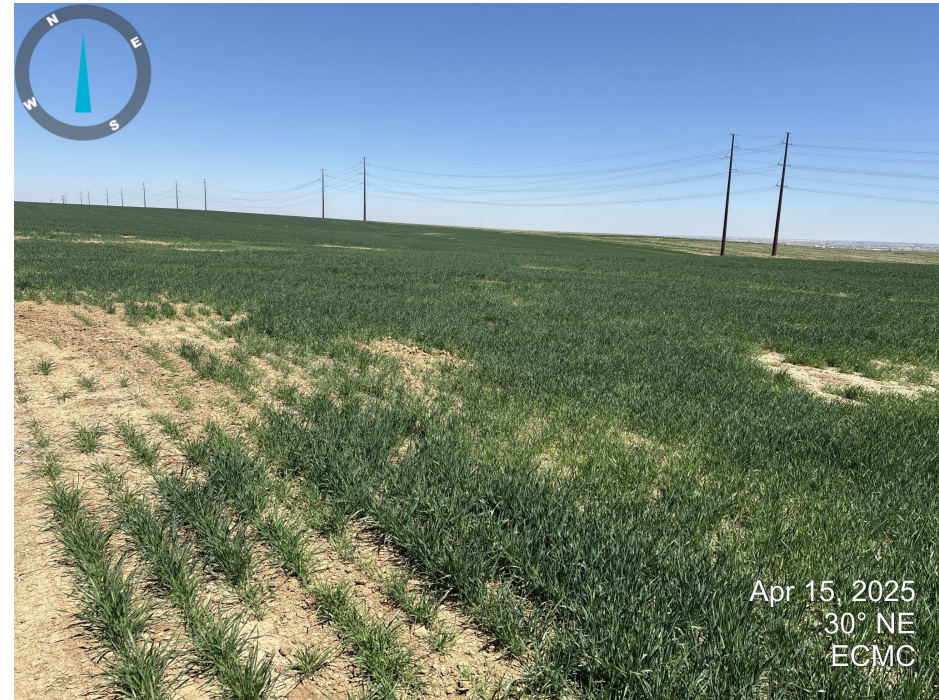
Photo 2. Looking at the east side of the location. Crop growth is patchy within the disturbance area.