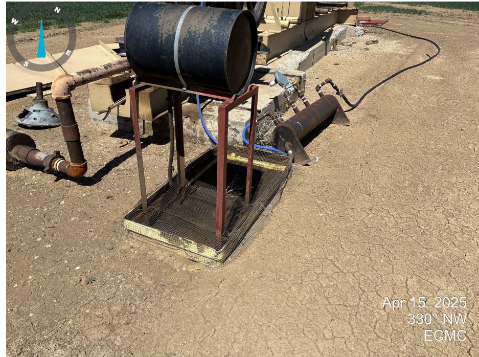
Photo 4. Unlabeled tank on the east side of the well.