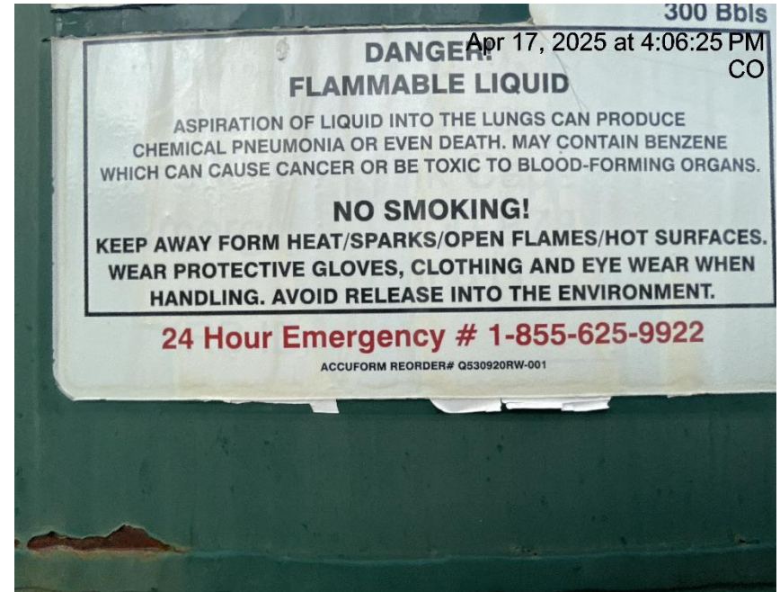
Photo # 3330 All 4 production tanks have TEP emergency # however 2 tanks also have labels with an emergency # that is disconnected & not in service