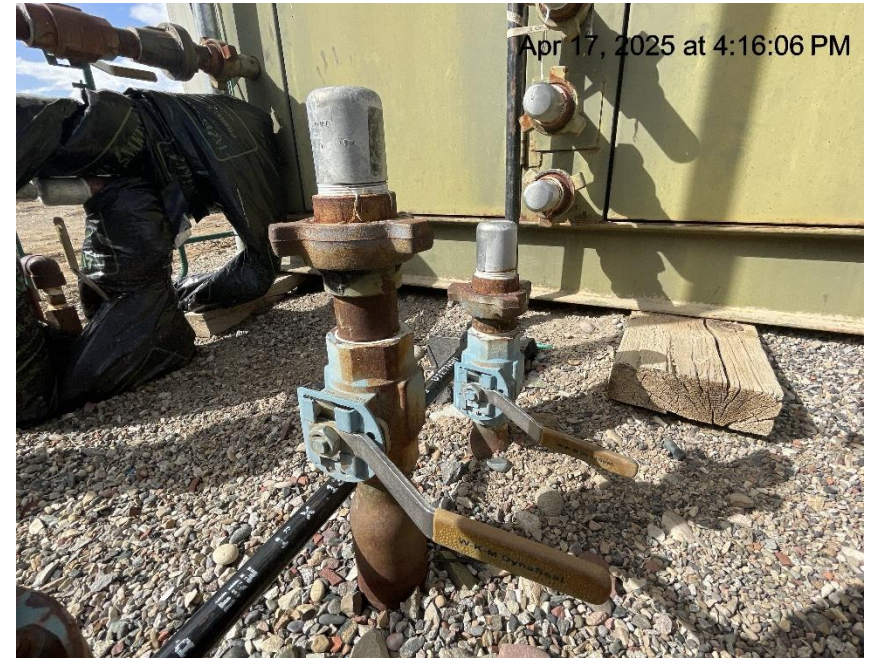
Photo # 3326 Multiple unused flowlines near separator lack lockout tagout (OOSLAT)