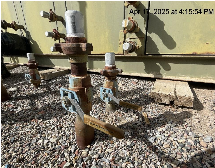
Photo # 3327 Multiple unused flowlines near separator lack lockout tagout (OOSLAT)