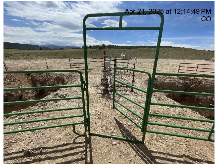
Photo # 3565 Gate for panels around wellhead excavation areas open/wildlife hazard/available for entry by wildlife