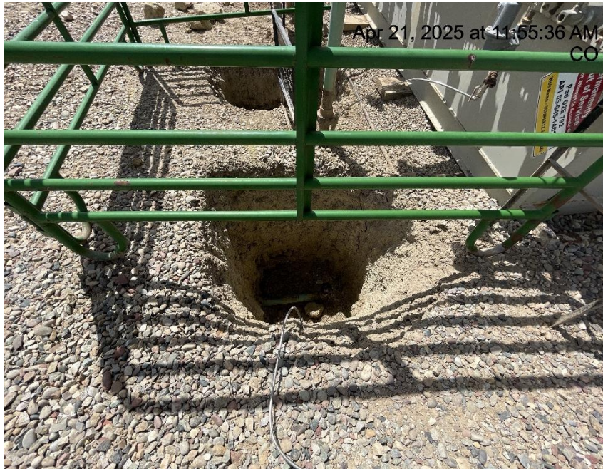
Photo # 3564 Excavated area in front of separators not fully enclosed by cattle panels/wildlife hazard & personnel hazard