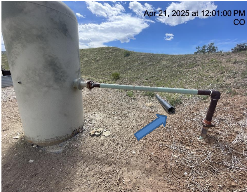
Photo # 3568 Poly pipe open ended/wildlife hazard /available for entry by wildlife