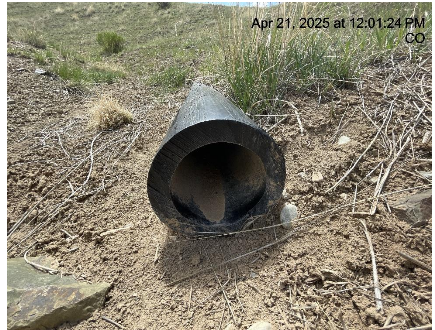
Photo # 3569 Poly pipe open ended/wildlife hazard /available for entry by wildlife