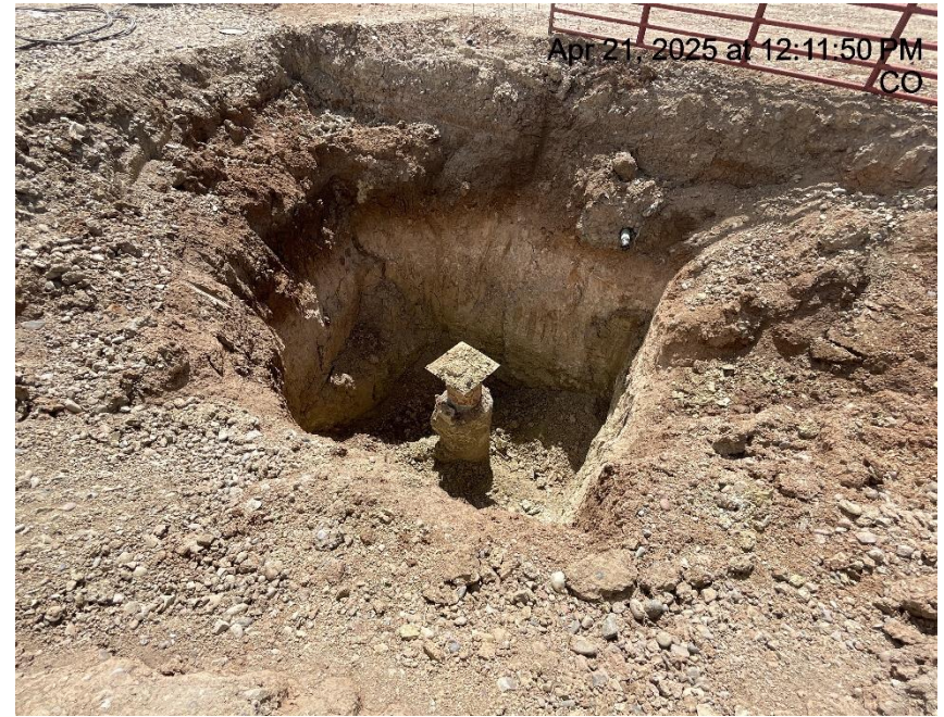
Photo # 3566 Excavated area around wellhead lacks wildlife egress/wildlife hazard