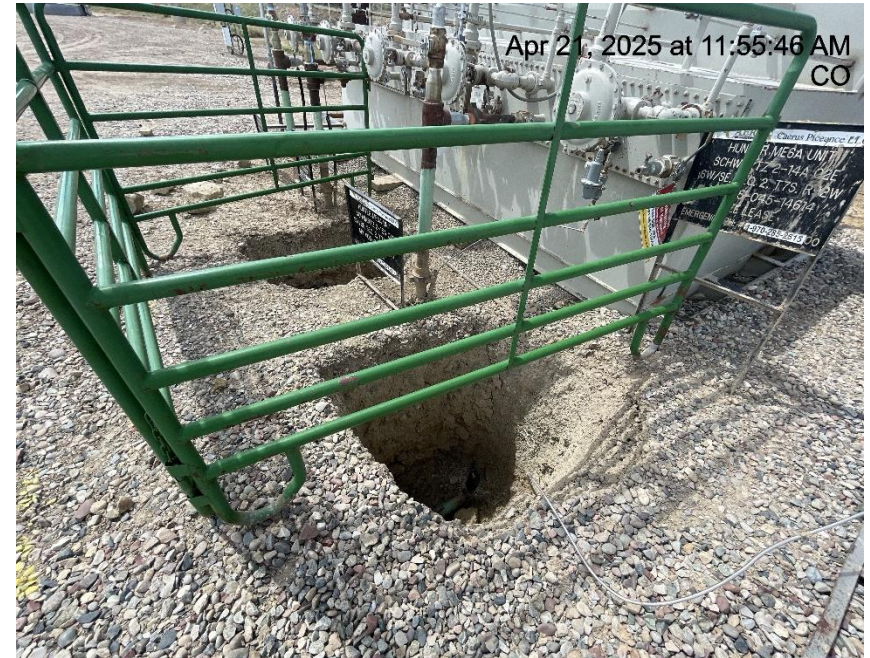
Photo # 3562 Excavated areas in front of separators lack wildlife egress/wildlife hazard