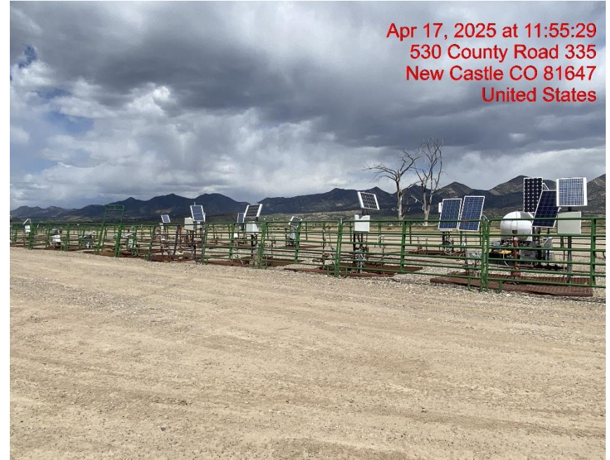
Location – Photo #08229