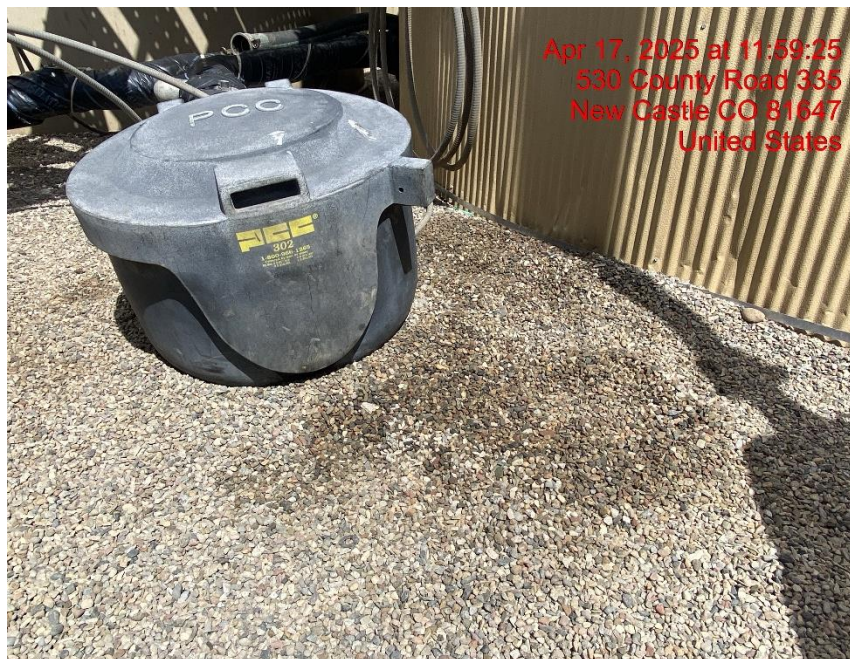
Staining in Tank Containment – Photo #08243