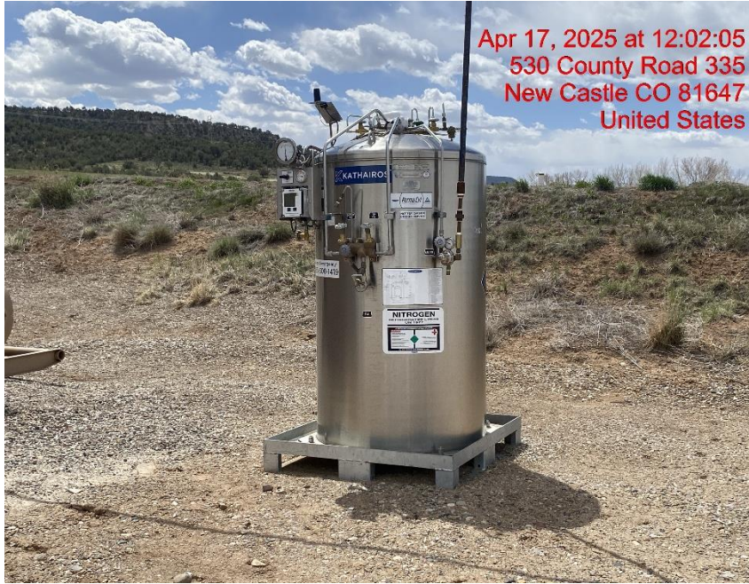
Location – Photo #08248