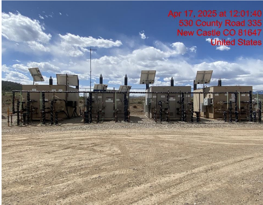
Location – Photo #08247