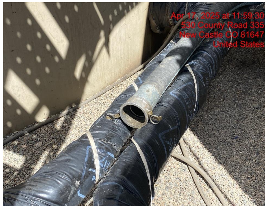
Stored Supplies/Wildlife Entry Hazard – Photo #08244