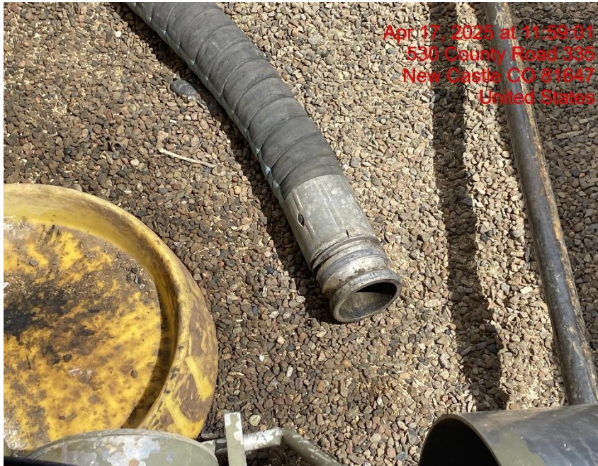
Stored Supplies/Wildlife Entry Hazard – Photo #08241