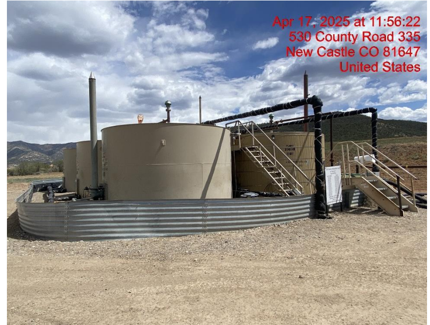
Location – Photo #08230