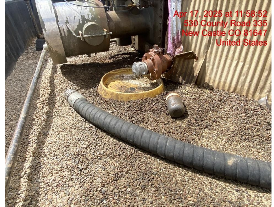
Staining in Tank Containment – Photo #08239