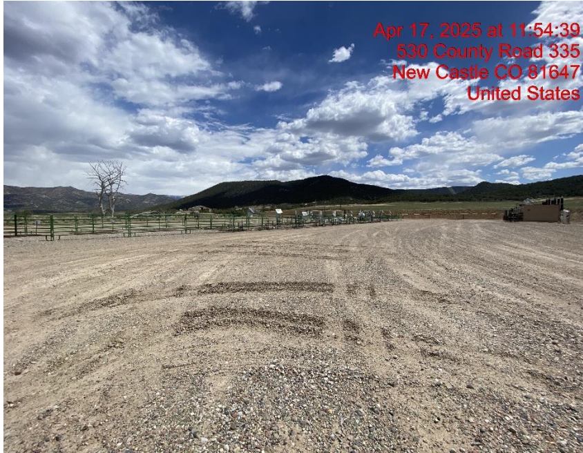
Location Overview – Photo #08228