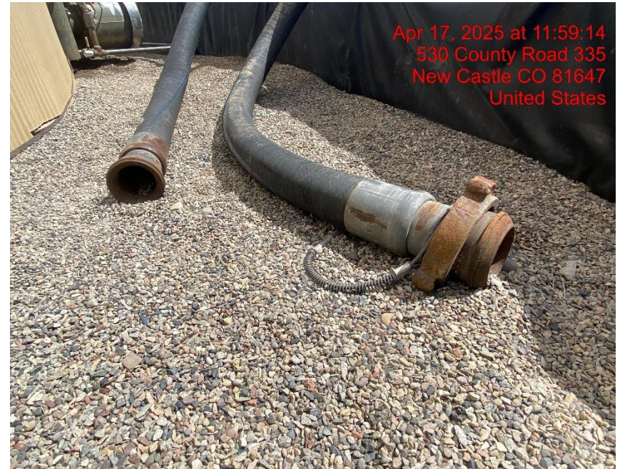
Stored Supplies/Wildlife Entry Hazard – Photo #08242