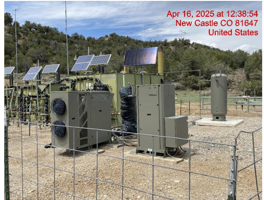
Location – Photo #08225