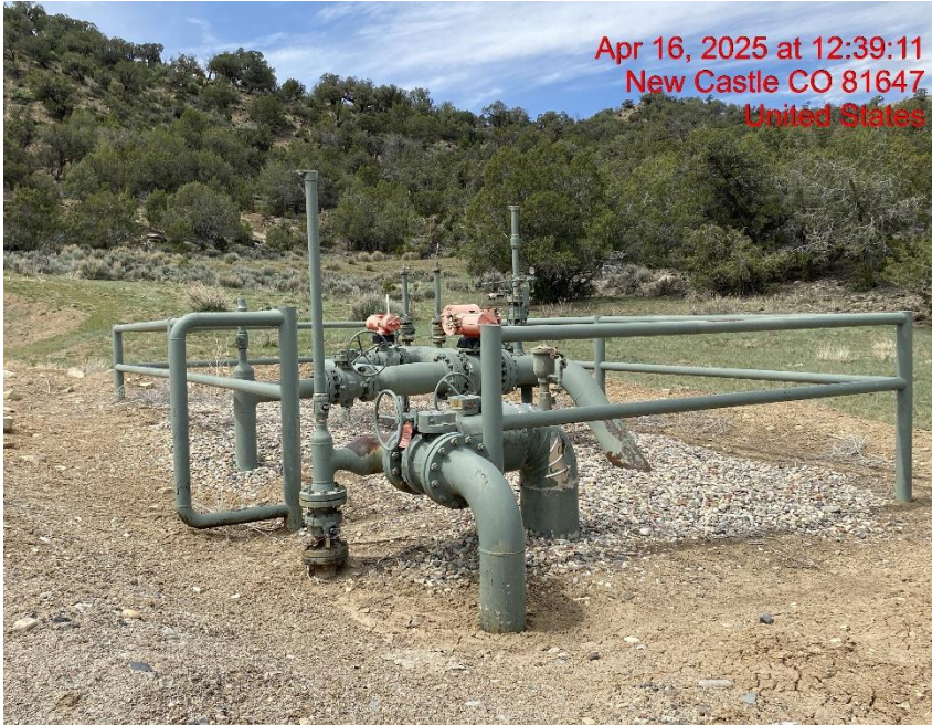
Location – Photo #08226