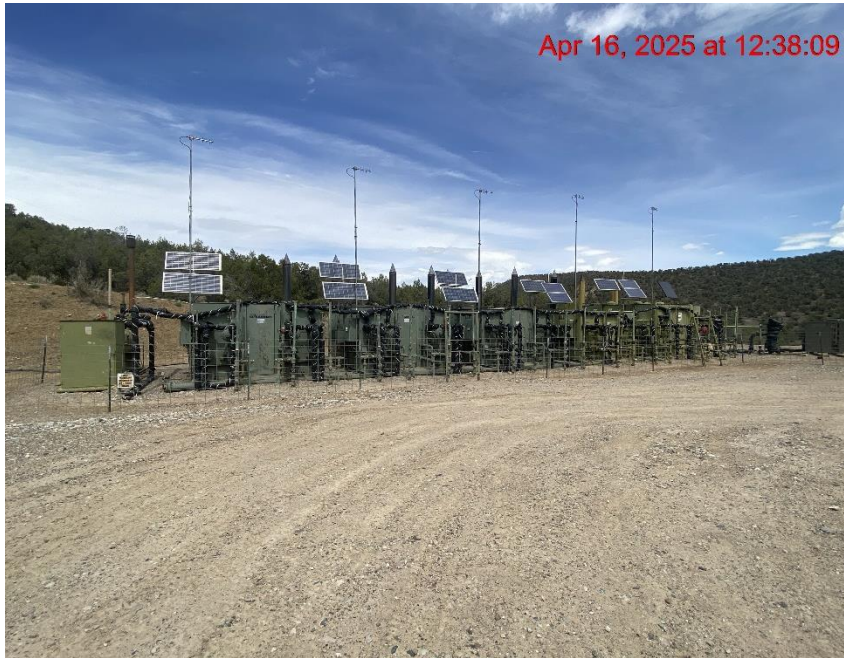
Location – Photo #08224