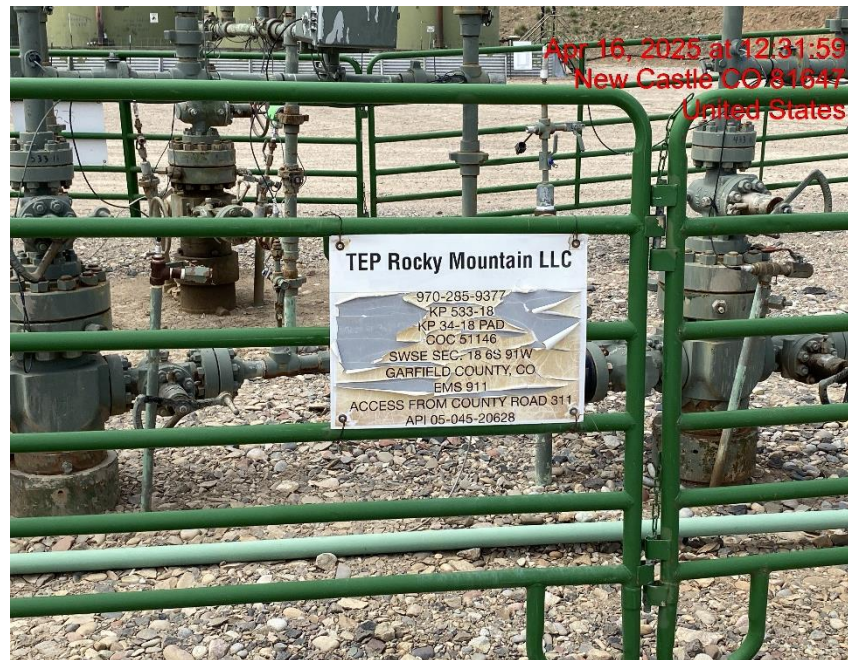
Illegible Wellhead Sign – Photo #08207