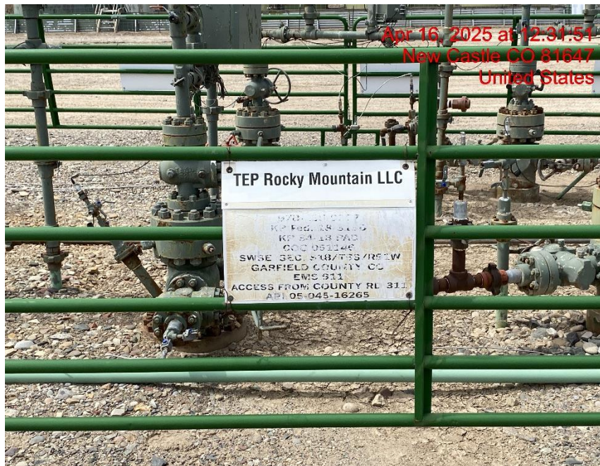
Illegible Wellhead Sign – Photo #08206