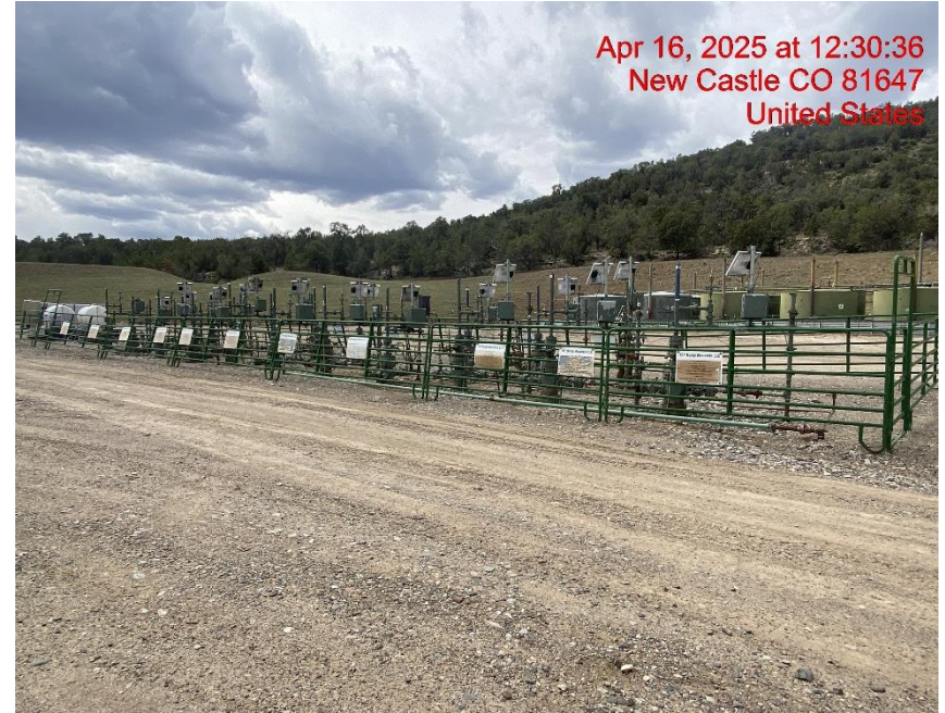
Location – Photo #08204