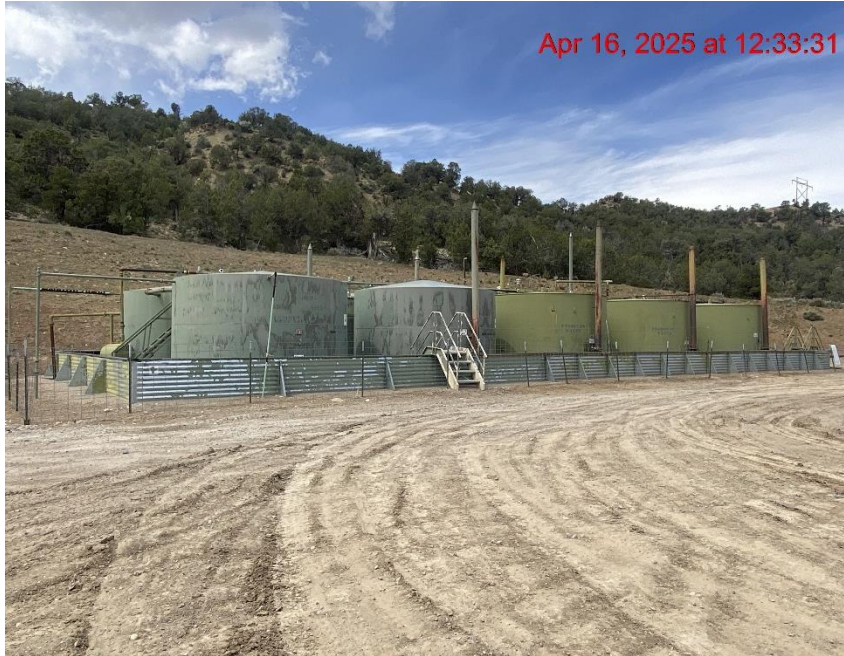
Location – Photo #08209