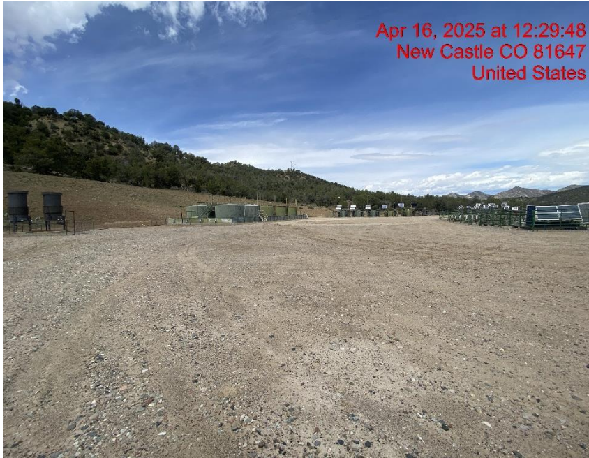
Location Overview – Photo #08203