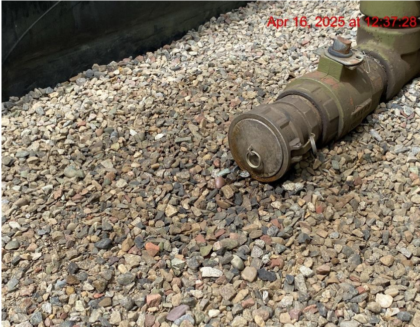
Staining in Tank Containment – Photo #08223