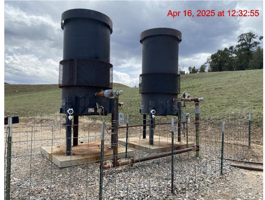
Location – Photo #08208