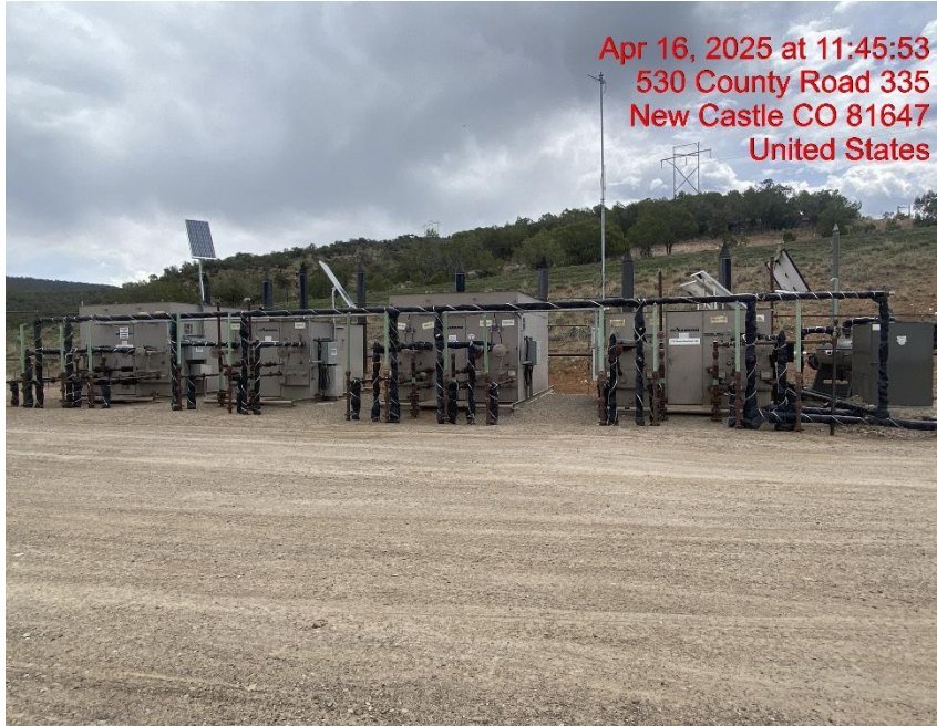
Location – Photo #08133