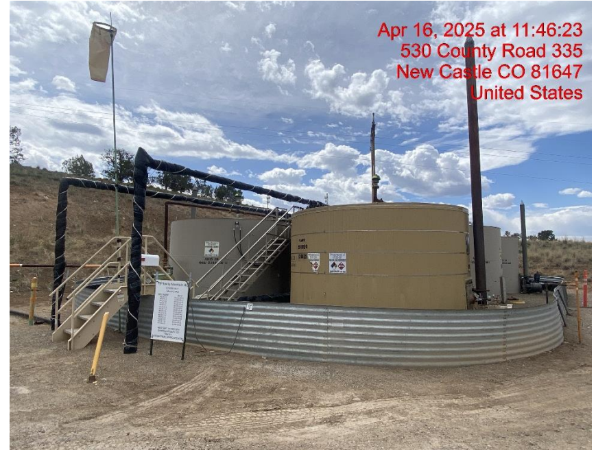
Location – Photo #08134