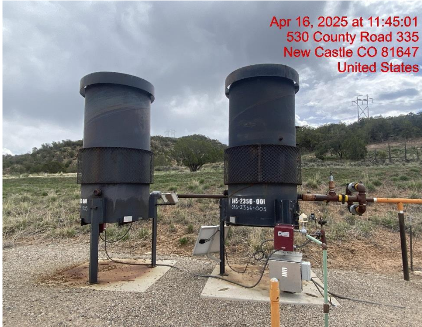
Location – Photo #08131