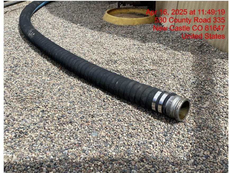
Stored Supplies/Wildlife Entry Hazard – Photo #08144