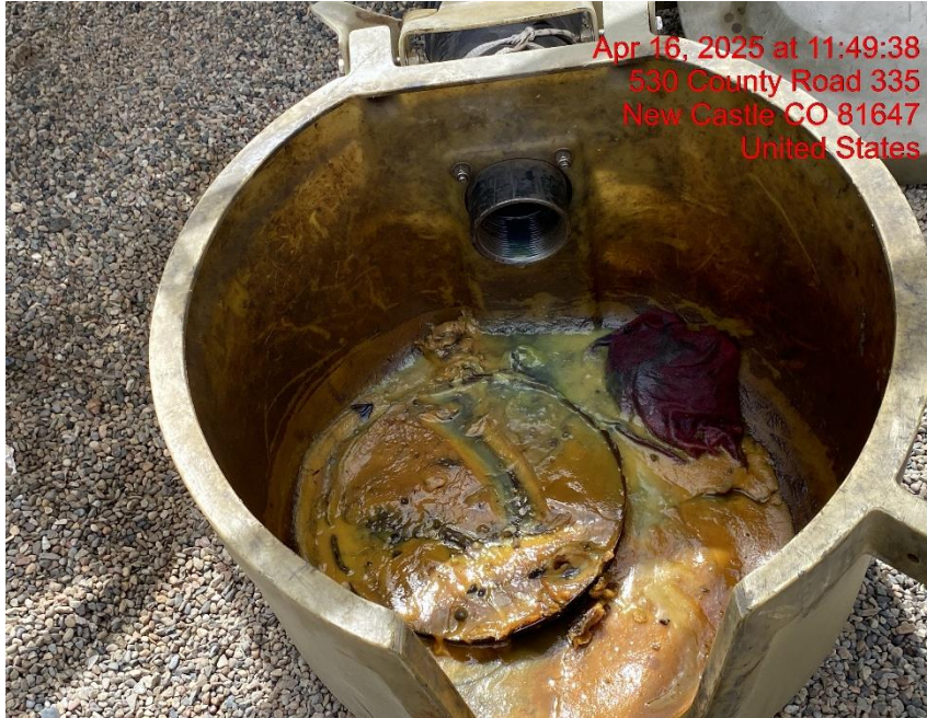
Open-Ended Load Line – Photo #08145