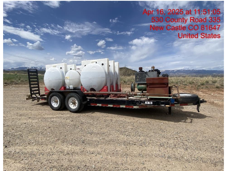
Stored Supplies/Wildlife Entry Hazard – Photo #08146

Apr 16, 2025 at 11:51:05 530 County Road 335 New Castle CO 81647 United States