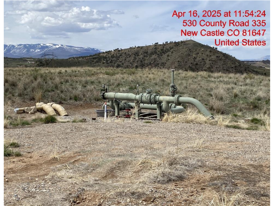
Location – Photo #08152