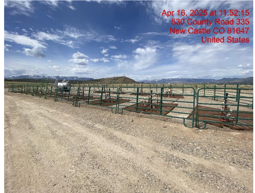
Location – Photo #08149