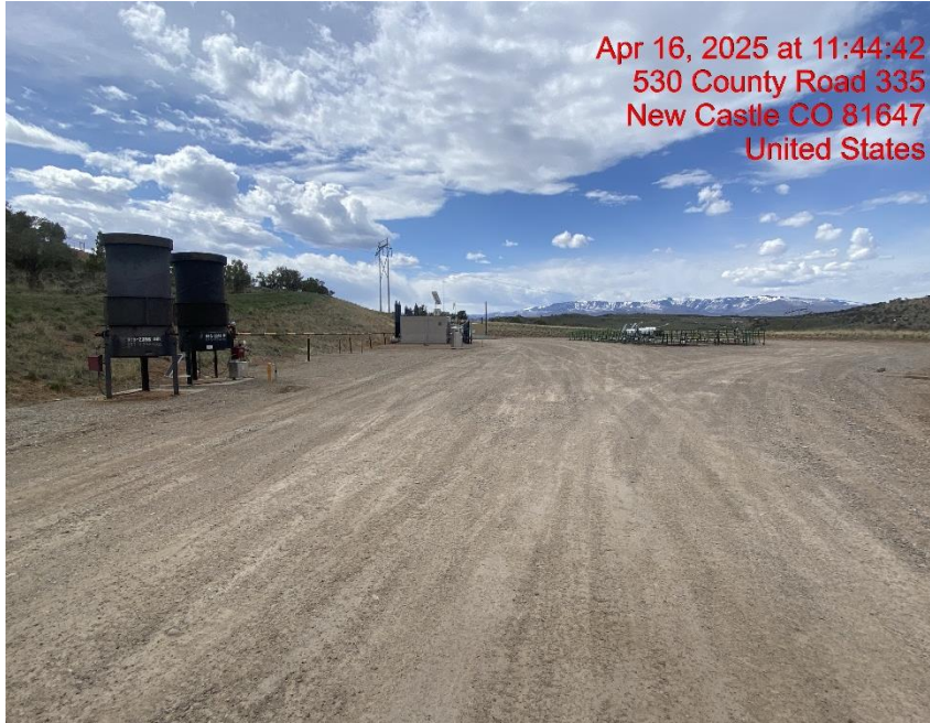
Location Overview – Photo #08130