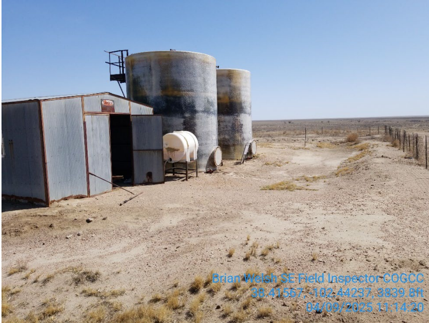
Southwest corner of the tank battery looking northeast