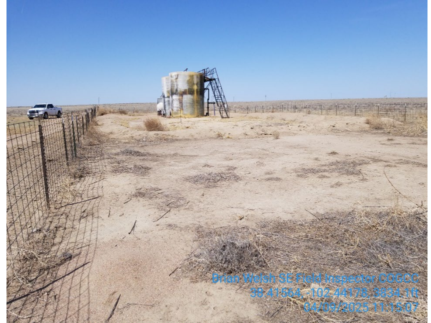
Southeast corner of the tank battery looking northwest