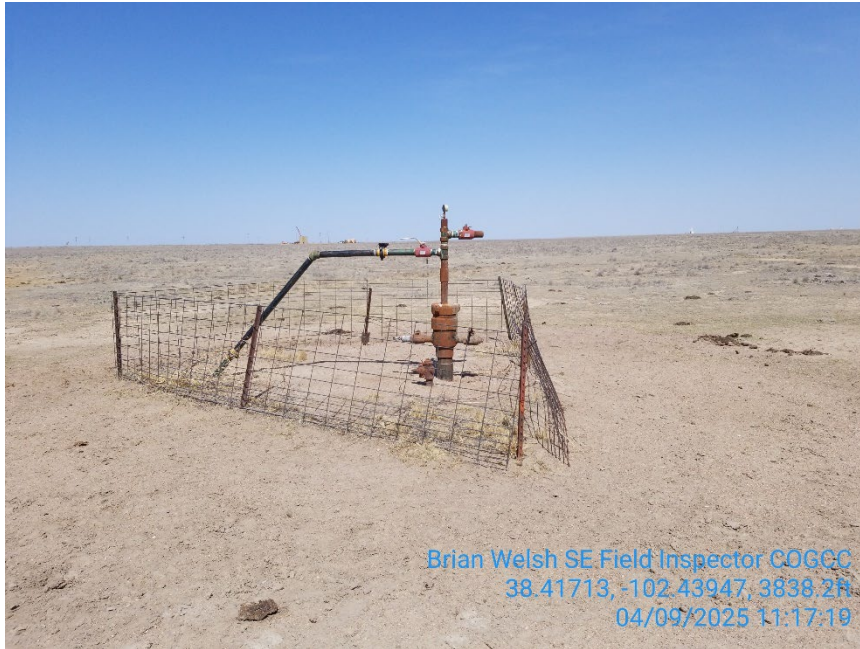
Wellhead is fenced with wire panels