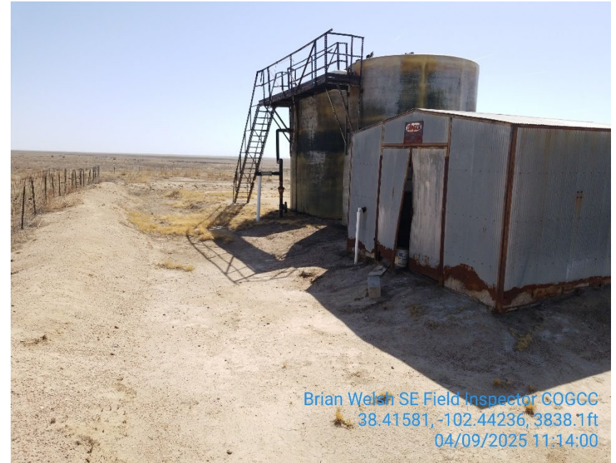
Northwest corner of the tank battery looking southeast