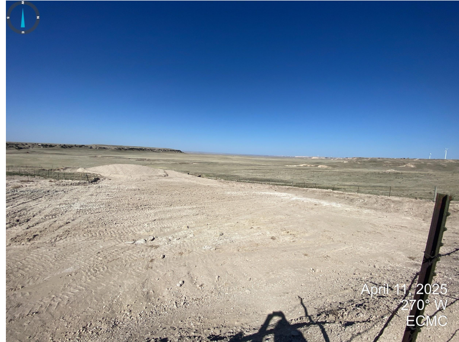
Photos 16 & 17. Overview of pit/salt kill excavation.