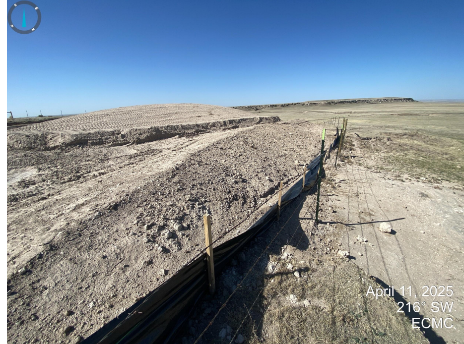
Photos 12 & 13. Taken near the northern portion of the salk kill excavation. Silt fence does not appear to be properly maintained.