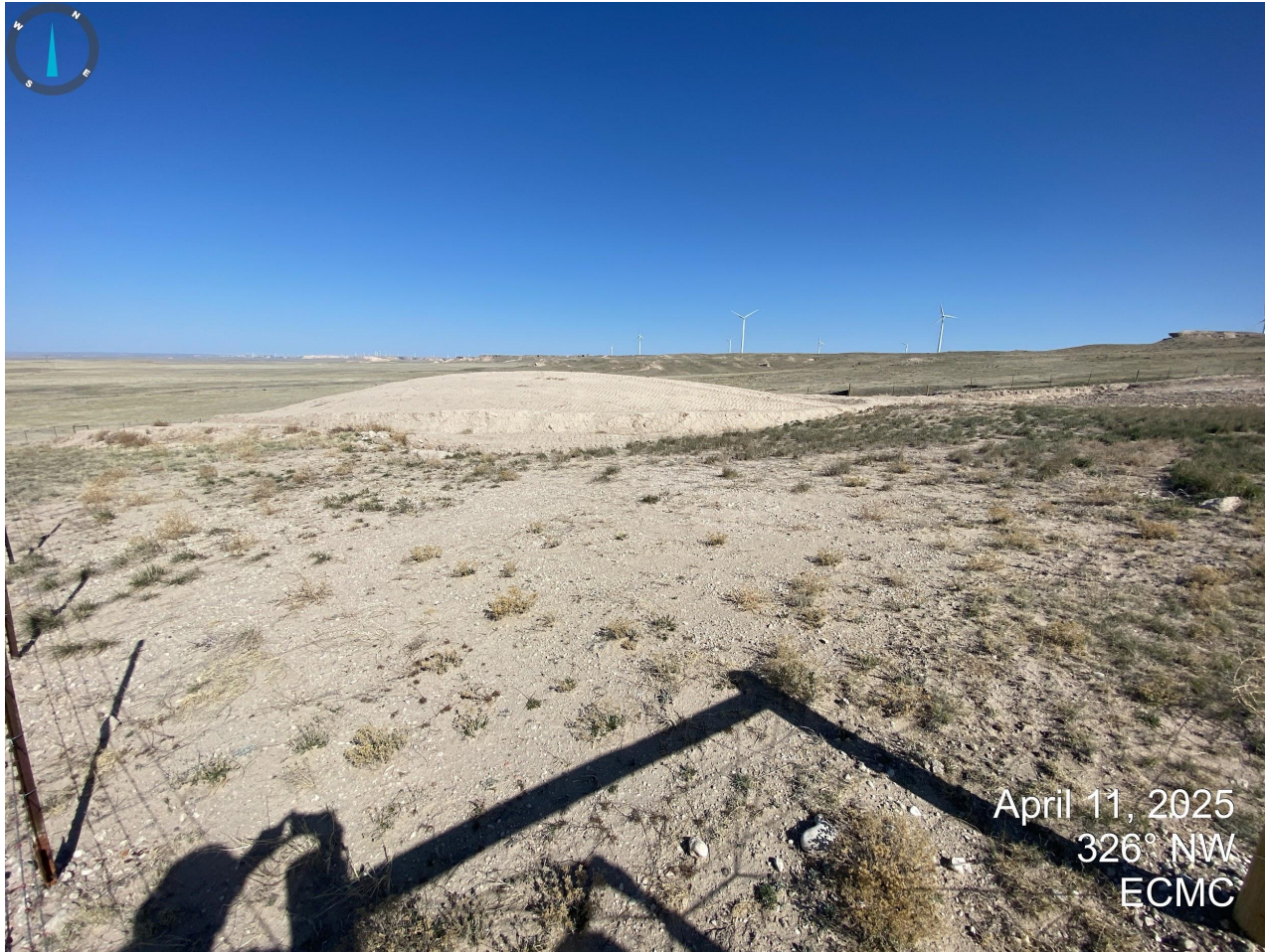
Photo 7. Southern extent of the western salt kill excavation. Additional reclamation activities are required to stabilize areas experiencing bare soil and/or non-uniform vegetation cover.