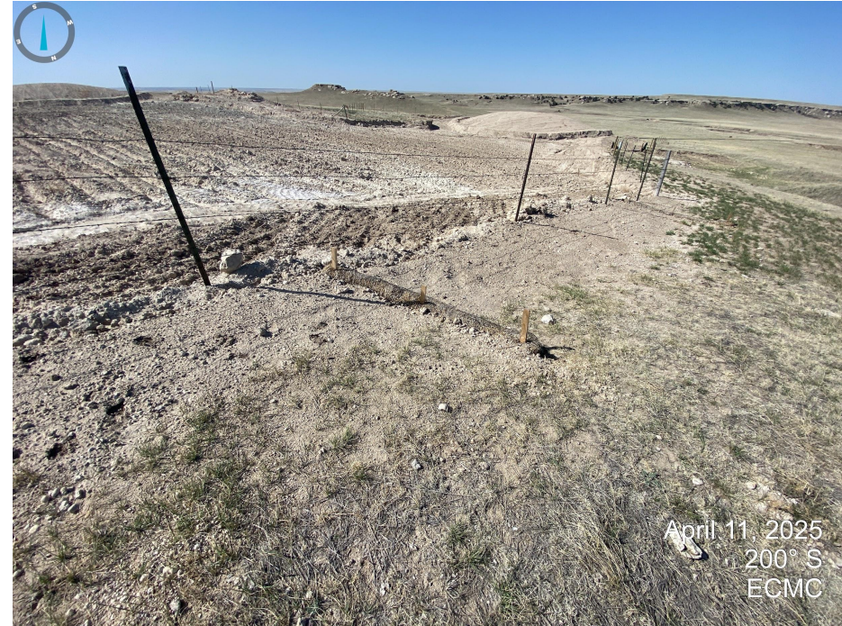
Photos 14 & 15. Northeastern corner of pit. Additional reclamation activities are required to stabilize areas experiencing bare soil and/or non-uniform vegetation cover.