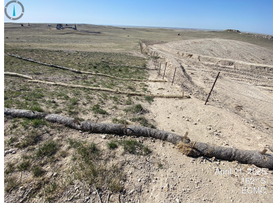
Photos 3 & 4. Eastern side of pit. Additional reclamation activities are required to stabilize areas experiencing bare soil and/or non-uniform vegetation cover.