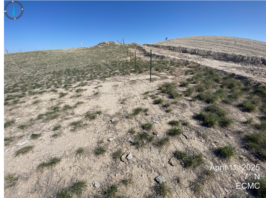
Photos 5 & 6. Southern extent of the eastern salt kill excavation (Photo 5; left) and western side of eastern salt kill area excavation (Photo 6; right). Additional reclamation activities are required to stabilize areas experiencing bare soil and/or non-uniform vegetation cover.