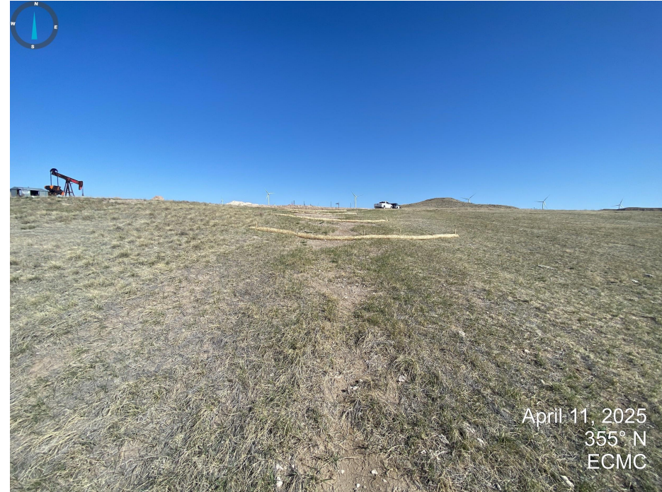
Photos 1 & 2. South of former heater treater. Additional reclamation activities are required to stabilize areas experiencing bare soil and/or non-uniform vegetation cover