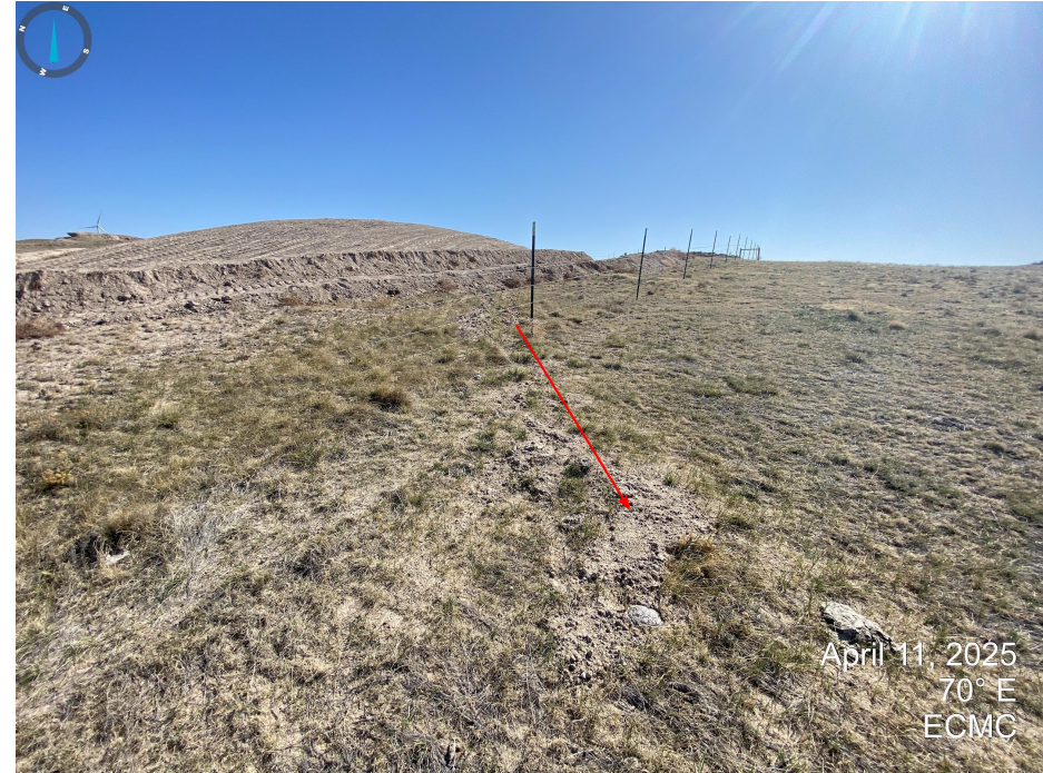
Photos 8 & 9. Southern portion of the western excavation/stockpile. Evidence of sediment discharge into the adjacent lands. Stormwater control measures do not appear to be adequate around the perimeter of the excavation.