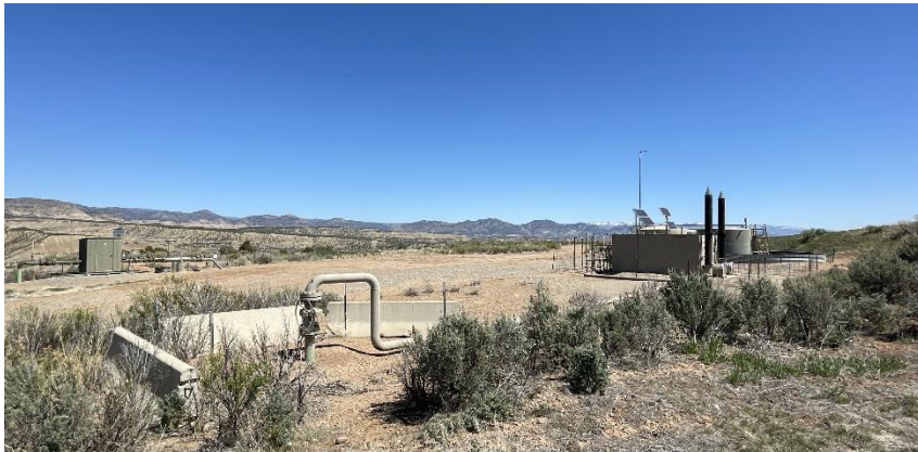
South West corner of location.