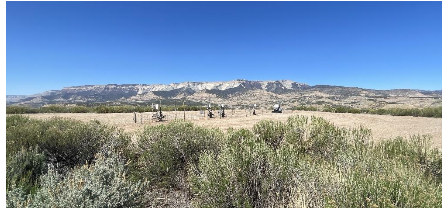
South East corner of location.