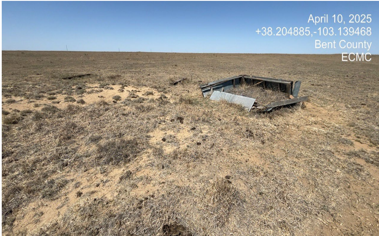
Photo 6. Facing north at the location. There are two wood railroad ties and a partial shed that remain.