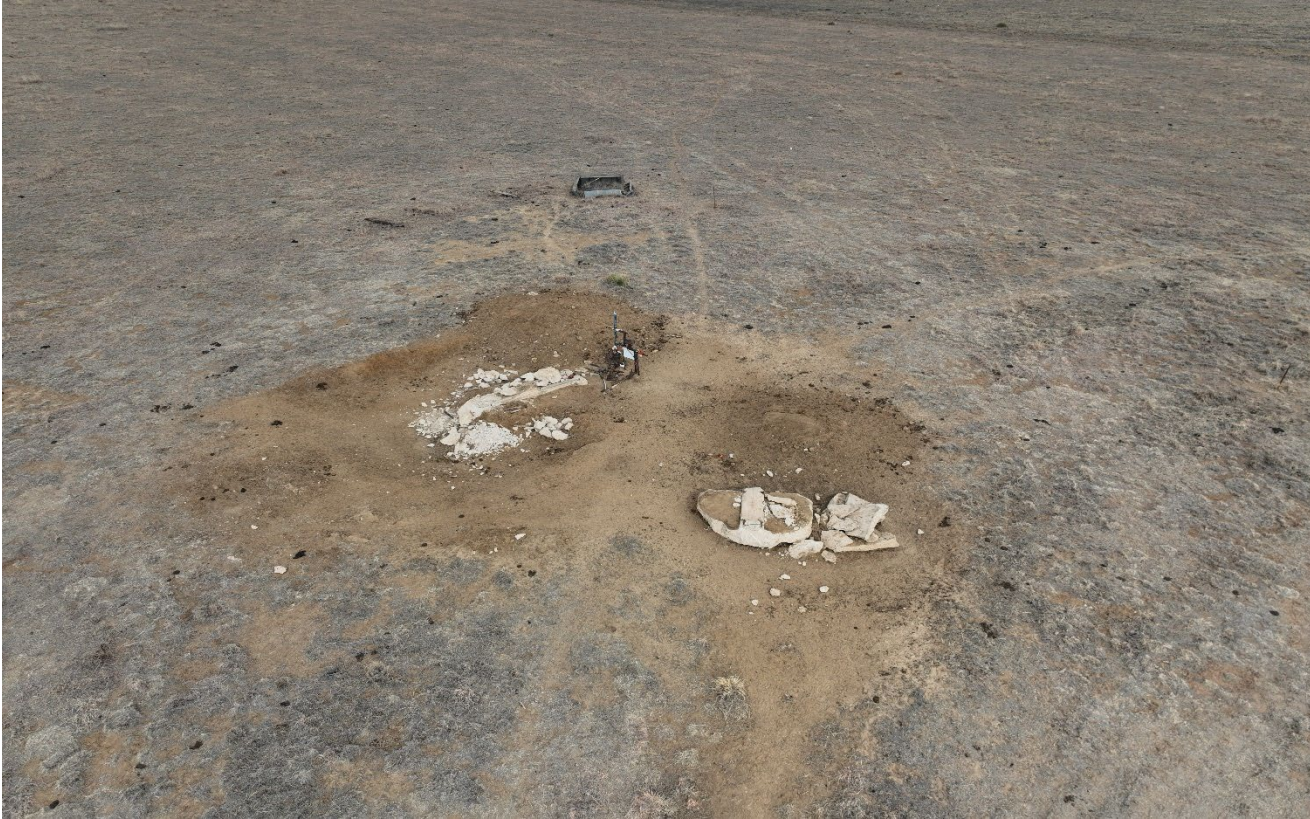
Photo 2. Drone photo (taken on 2/4/25) facing down toward the wellsite.