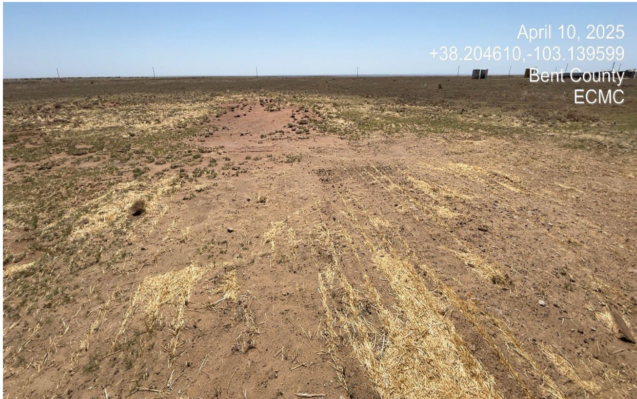
Photo 5. Facing south at the location. This is the area of suspected impacts from the well. See photo #1.