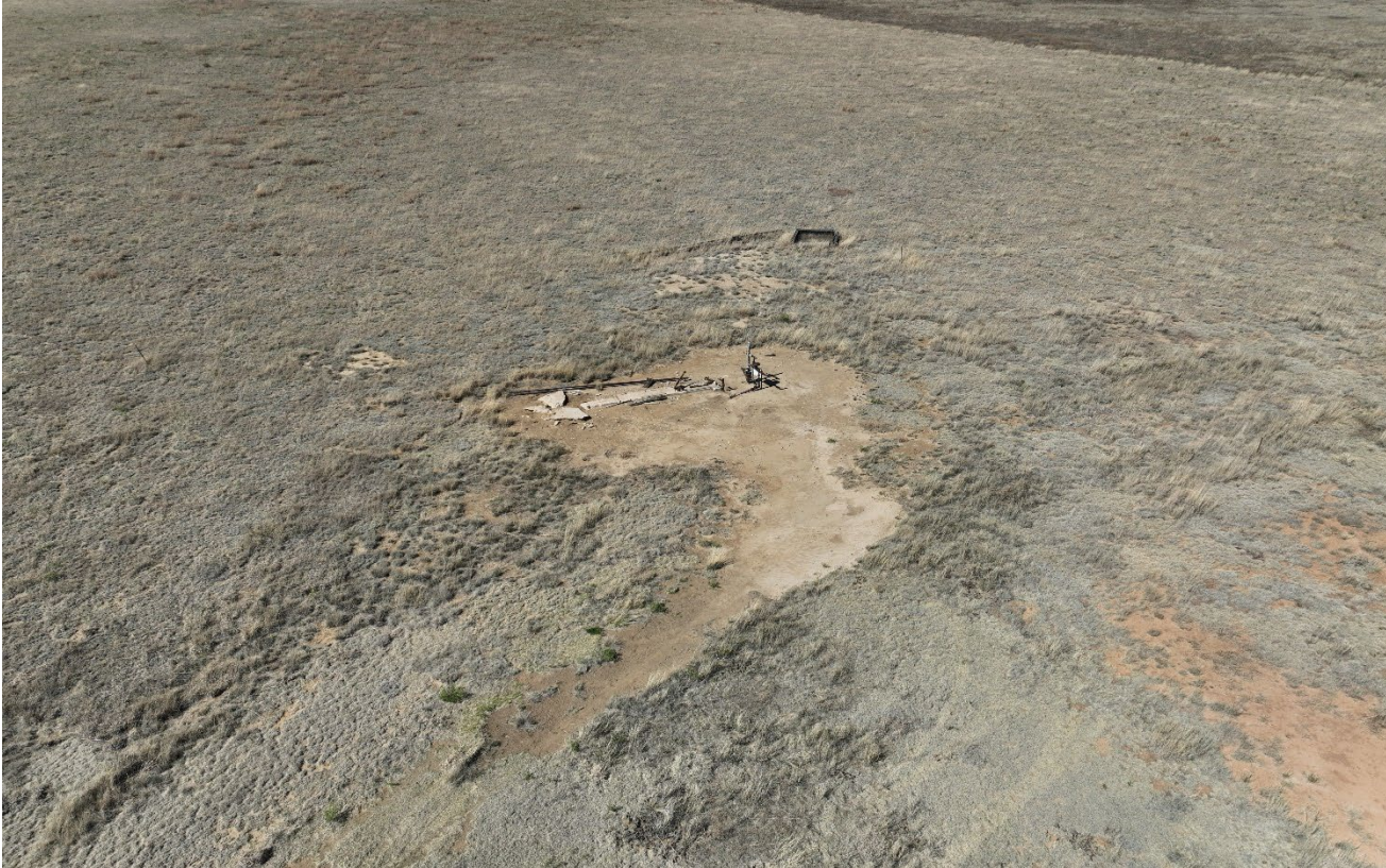
Photo 1. Drone photo (taken on 5/8/24) facing down toward the wellsite. There is an area with no vegetation which appears impacted soil from a historical spill.