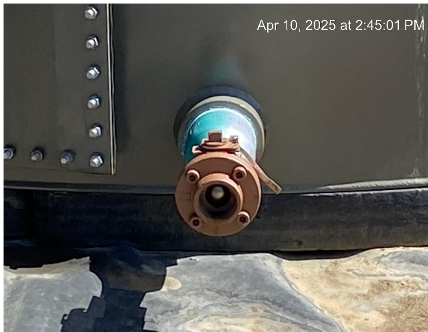
Open end tank valve