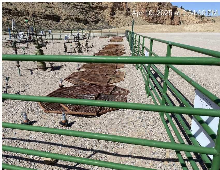
Pad prepped for additional wells