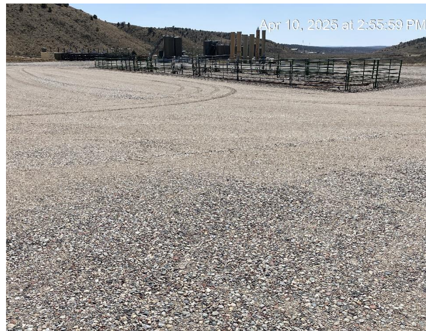
Well pad from Northeast corner