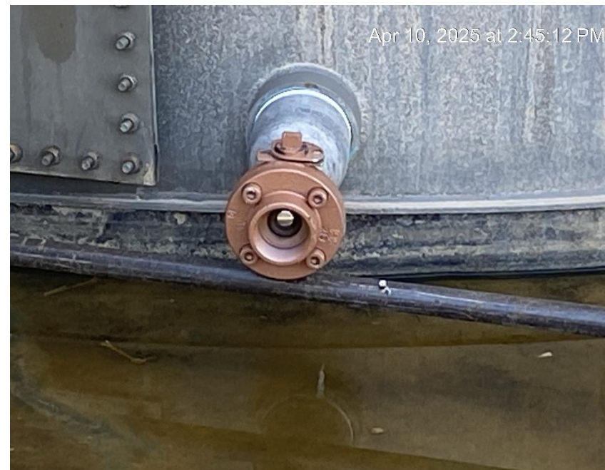
Open end tank valve